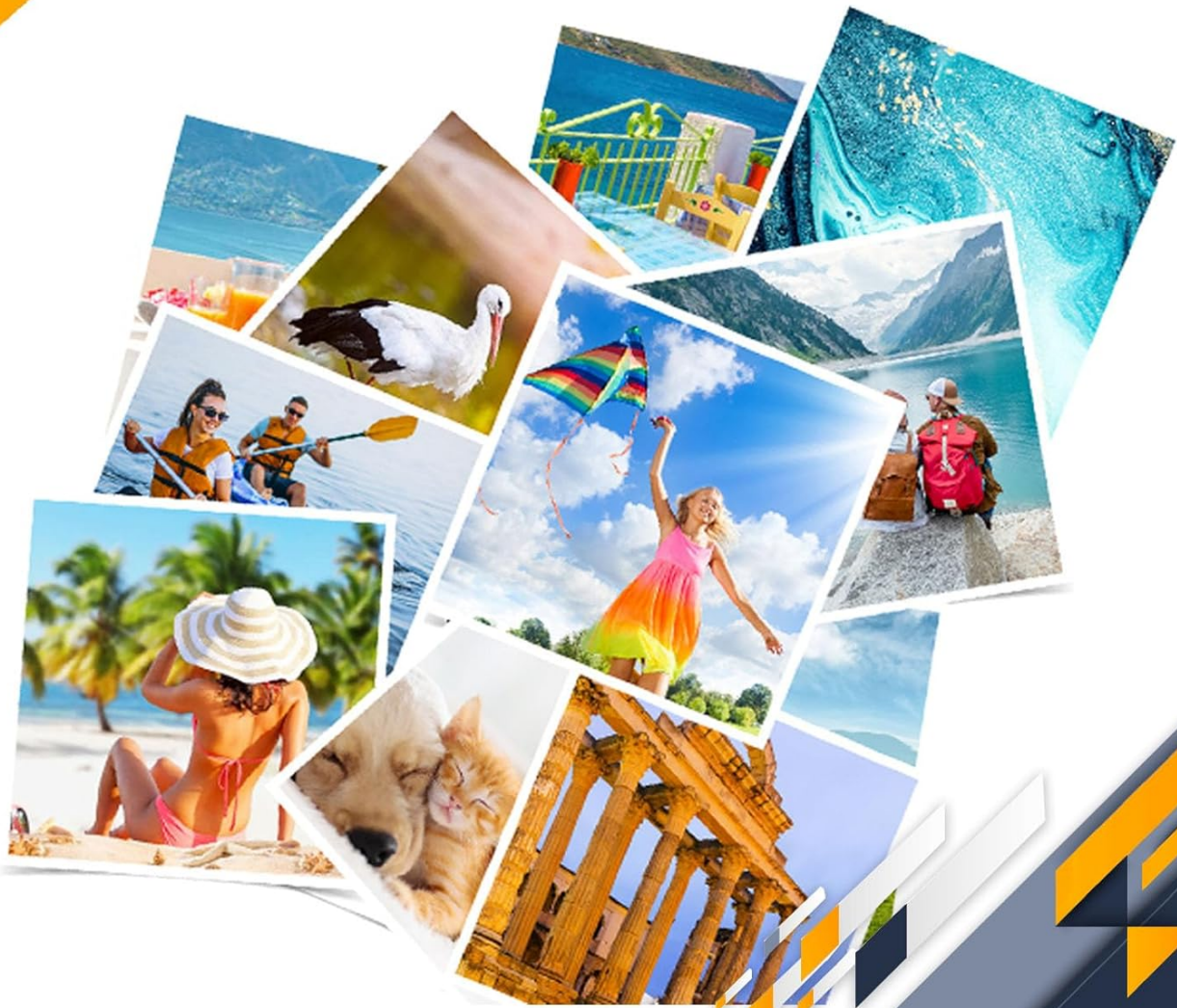
Image: Examples of various colorful and detailed printouts, demonstrating the print quality achievable with the drum unit.