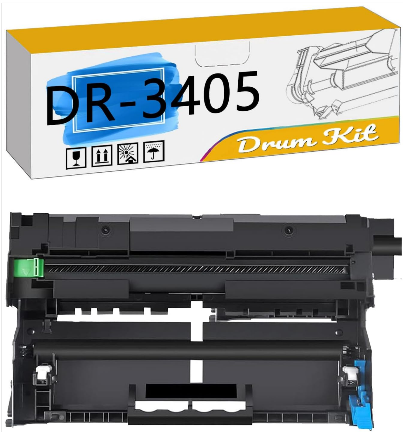
Image: The WMSNUH DR-3405 / DR3405 Drum Kit, a key component for laser printing.