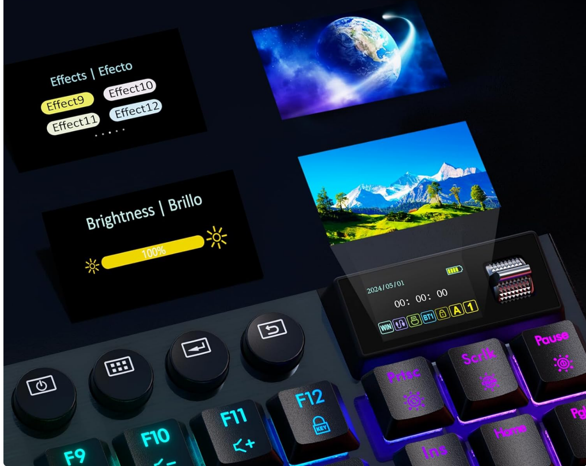
Figure 4: TFT Display with Customization Options