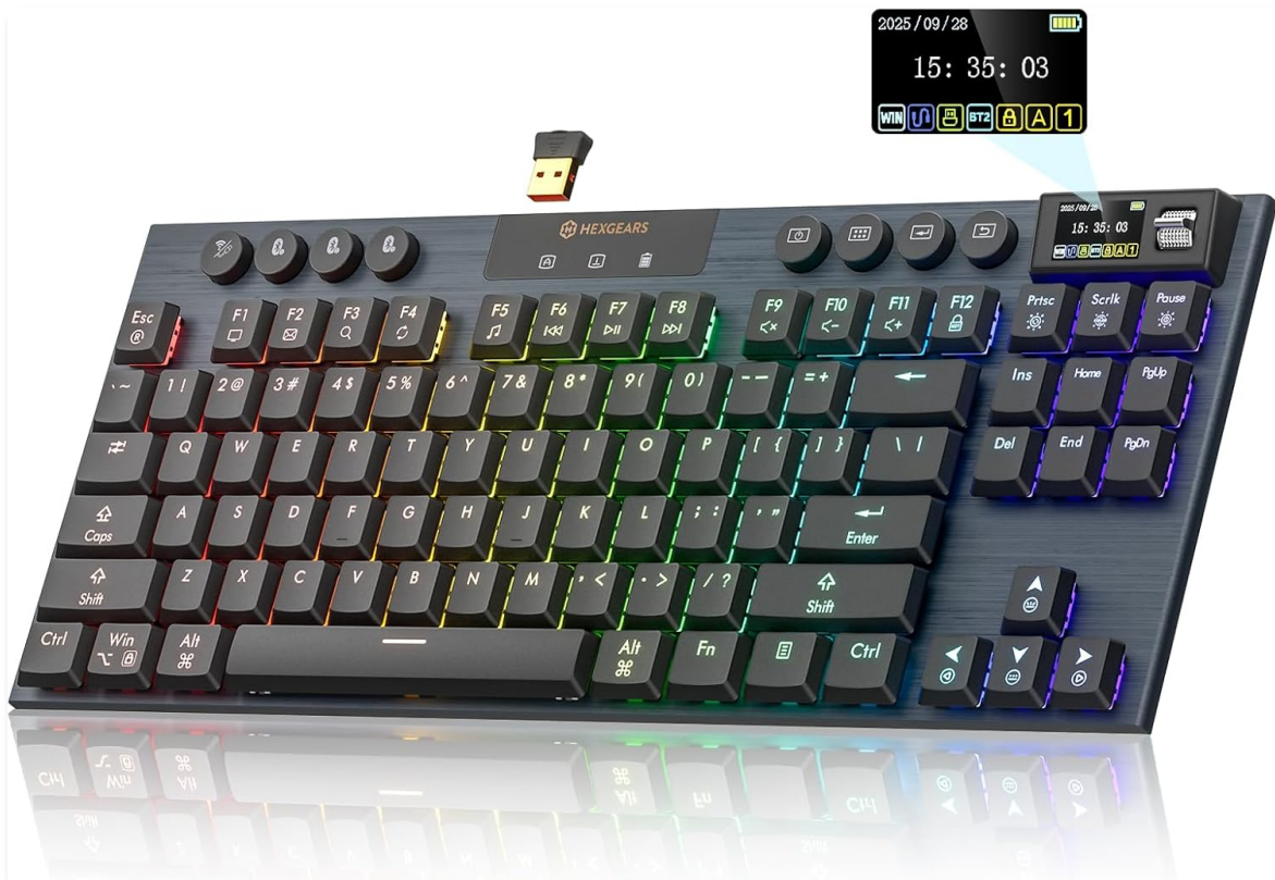
Figure 1: Hexgears Immision A3 Low-Profile Wireless Mechanical Keyboard

This manual provides comprehensive instructions for setting up, operating, and maintaining your Hexgears Immision A3 Low-Profile Wireless Mechanical Keyboard. Please read this guide thoroughly to ensure optimal performance and longevity of your device.