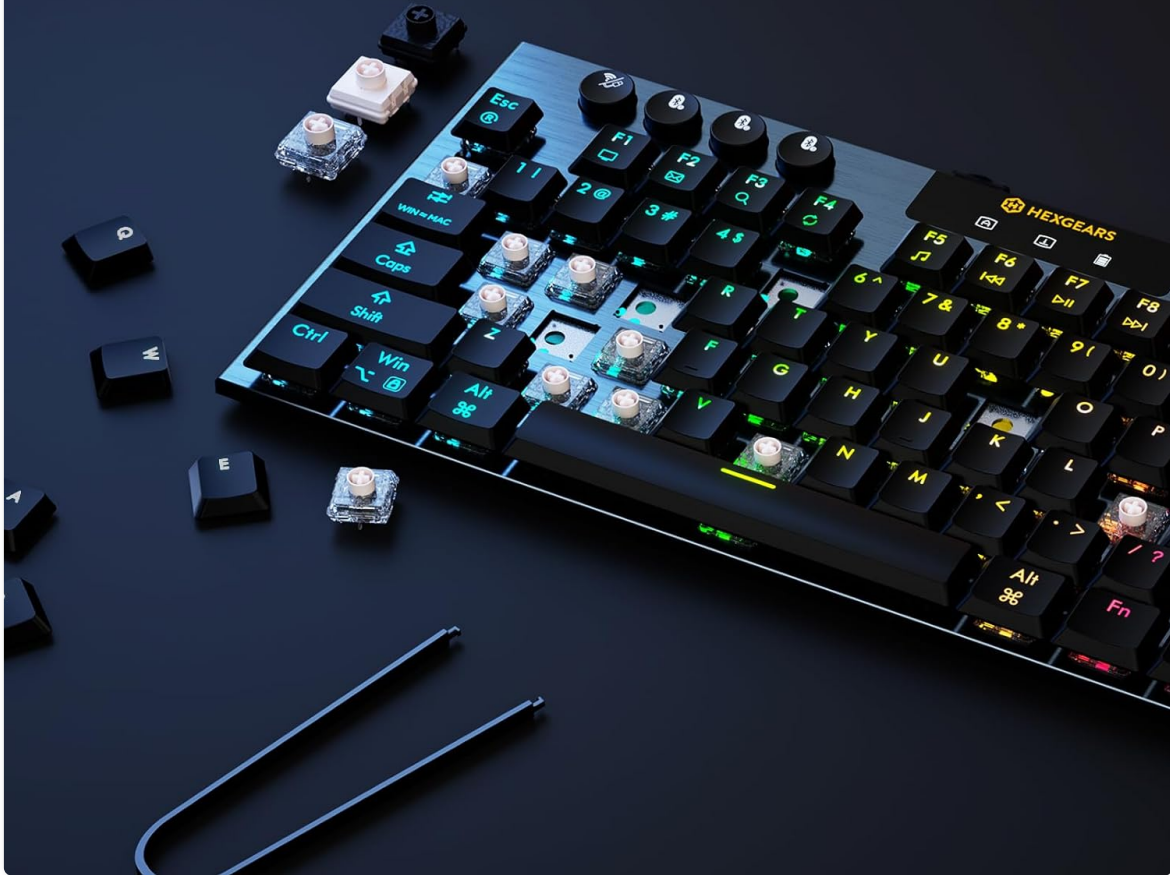
Figure 5: Kailh 3-Pin Hot-Swappable Switches