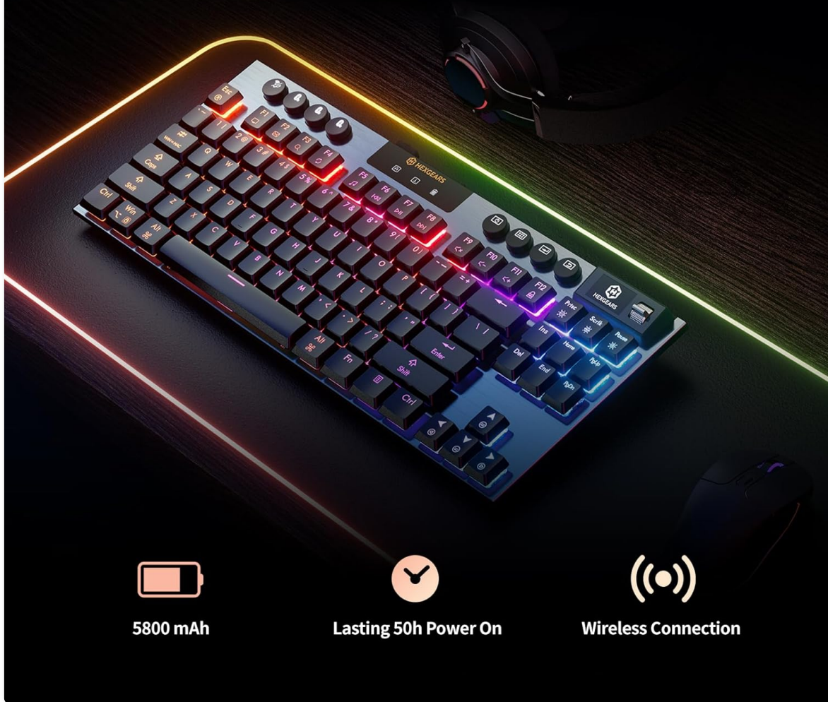
Figure 6: 5800mAh Battery for Long-Lasting Performance