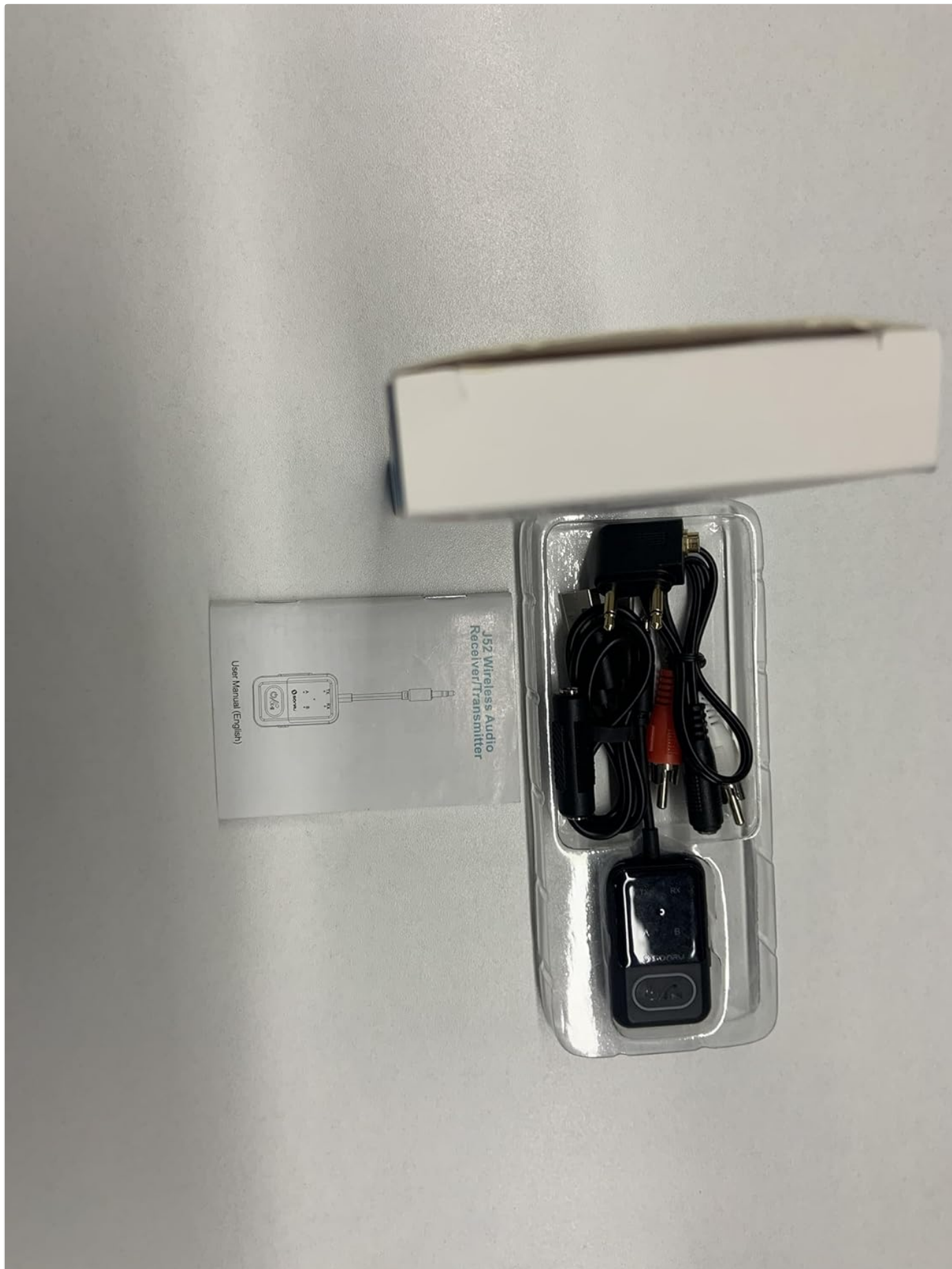
Image: A detailed view of the SONRU Bluetooth adapter highlighting its components: TX/RX working mode indicators, MIC, Next Song/Volume +, Previous Song/Volume -, MFB (Multi-Function Button), Type-C Charging Port, Reset button, A/B connection device

Familiarize yourself with the device's buttons and indicators for optimal use: