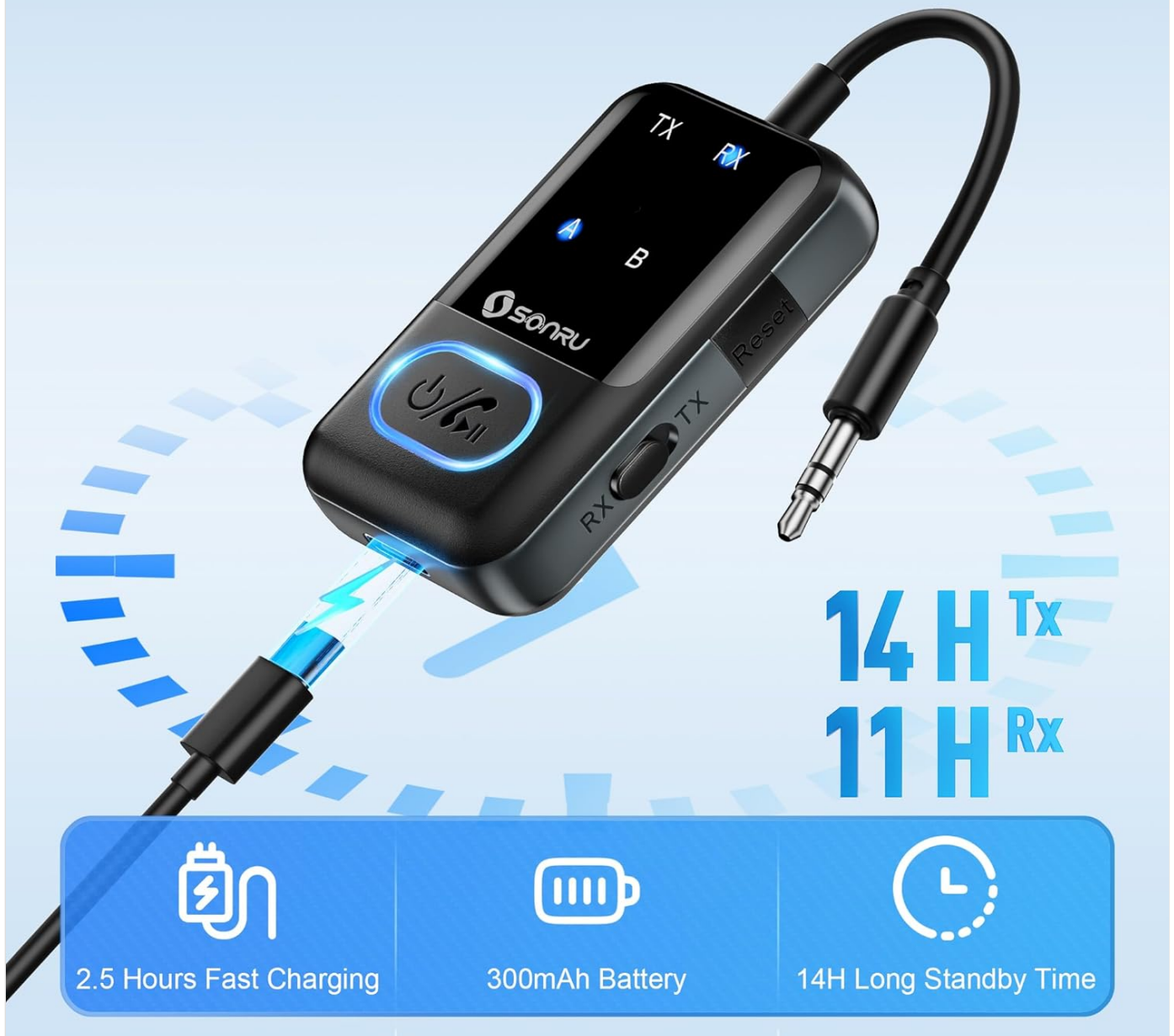
Image: The SONRU Bluetooth adapter being charged via its Type-C port, with indicators showing 2.5 hours for fast charging, a 300mAh battery, and 14 hours of long standby time (or usage time in TX mode).