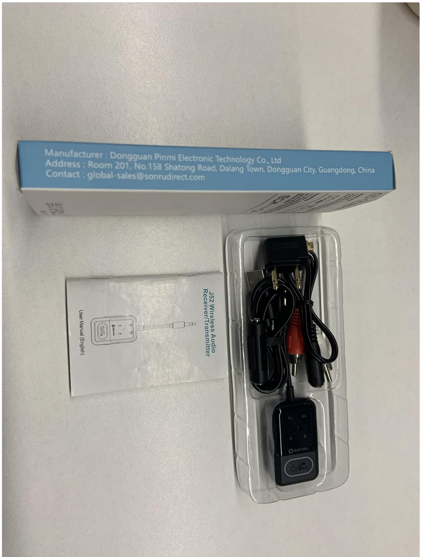
Image: The SONRU Bluetooth 5.3 Transmitter Receiver and its included accessories, such as the 3.5mm audio cable, Type-C charging cable, RCA audio cable, airplane adapter, and female-to-female adapter.