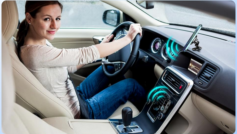
Image: A person driving, with the SONRU Bluetooth adapter connected to the car's audio system, enabling hands-free calling from their smartphone, enhancing driving safety.