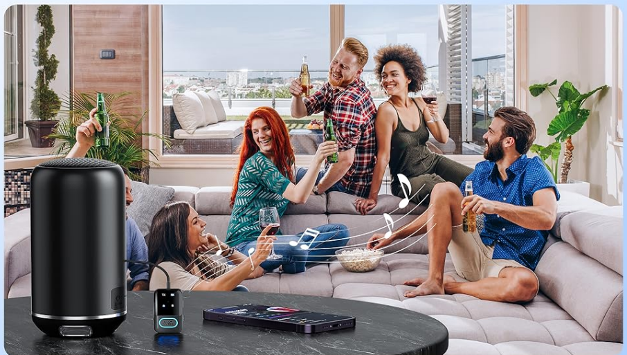
Image: A group of friends at an outdoor gathering, with the SONRU Bluetooth adapter connected to a portable speaker, receiving music wirelessly from a smartphone, enhancing the party atmosphere with wireless audio freedom.

Wireless Freedom Bluetooth Receiver Makes Parties Happier