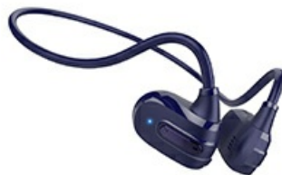
Image: Visual of headphones connected to multiple devices.

The headphones support connecting to two Bluetooth devices at the same time (e.g., a phone and a computer). Follow the standard pairing procedure for each device.