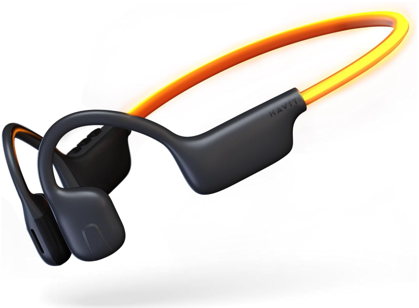
Image: The havit Light Open Ear Headphones, showcasing their sleek design and the prominent orange LED band.