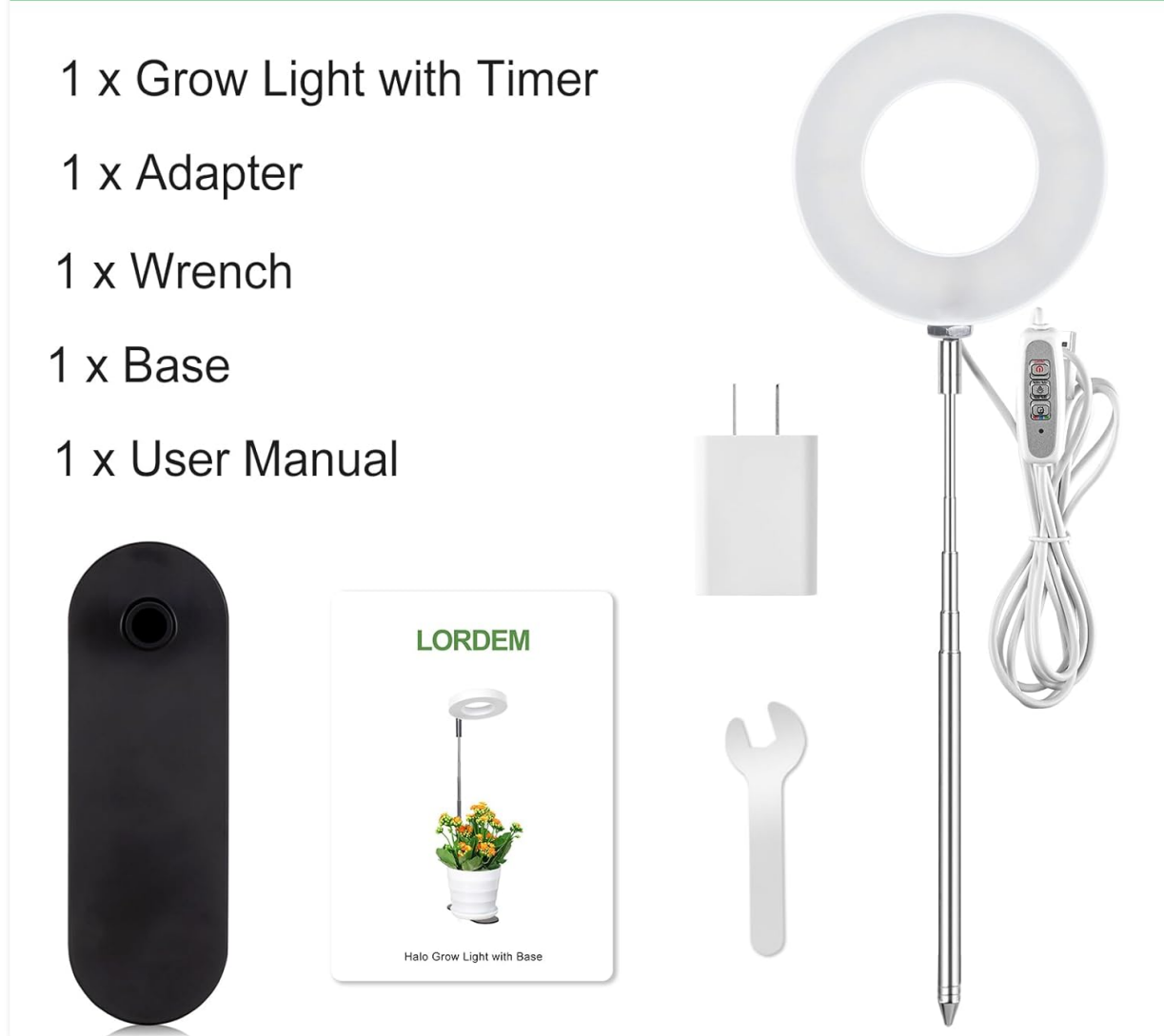
Image 3.1: All components included in the LORDEM Plant Grow Light package.