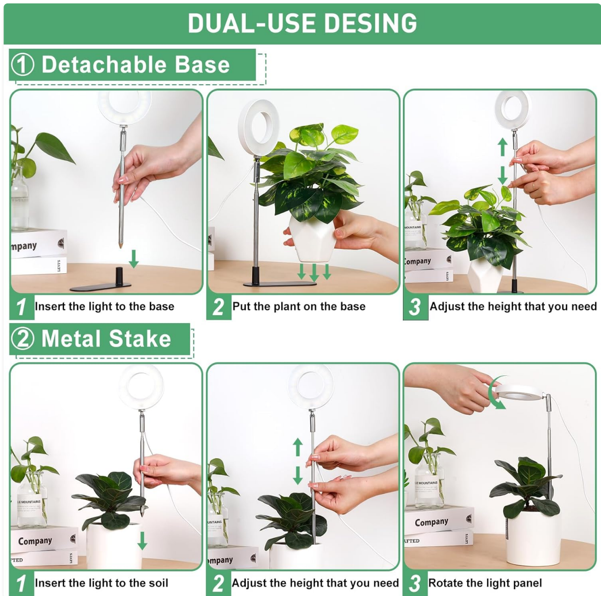
Image 4.1: Visual guide for dual-use setup, illustrating both base and soil insertion methods.