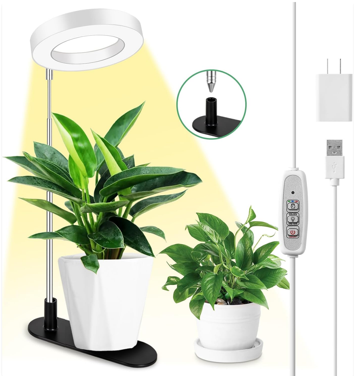
Image 1.1: The LORDEM Plant Grow Light illuminating an indoor plant on a desk.