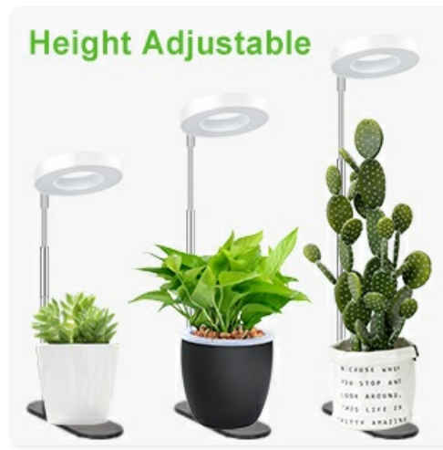
Image 5.3: The grow light's height can be adjusted to suit various plant sizes.