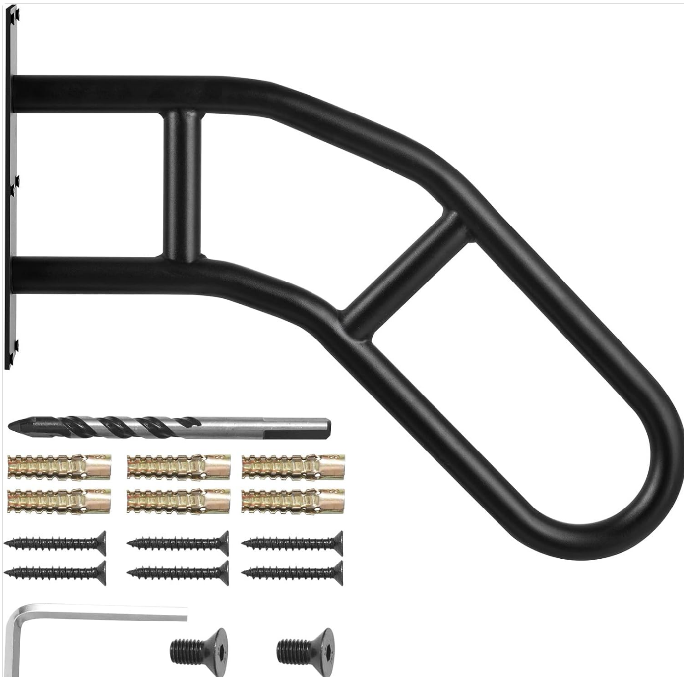
Image 3.1: A complete view of the VEVOR HR-03-29-2 handrail and all accompanying accessories, including screws, expansion tubes, drill bit, and hex wrench.