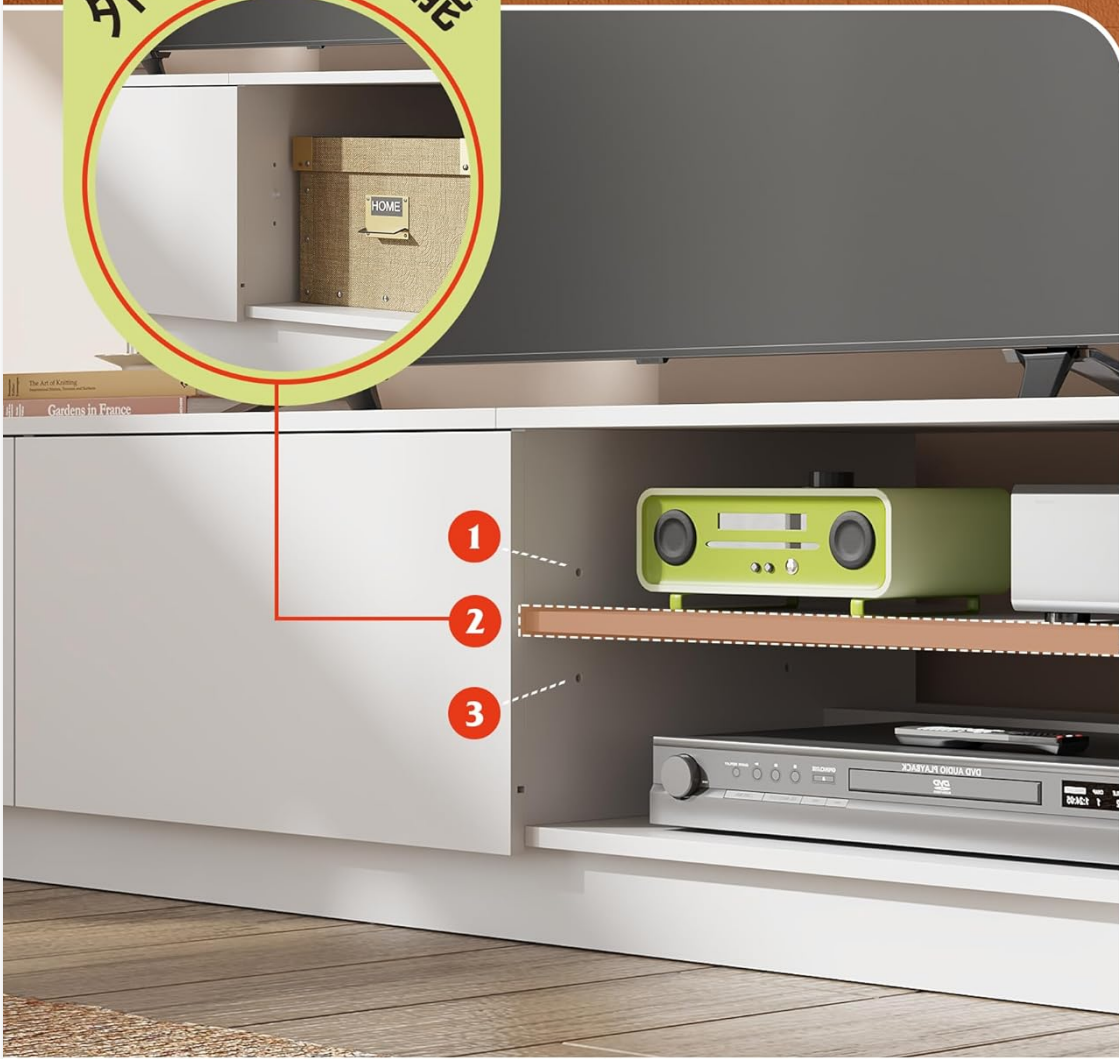
Image: A detailed view of the open storage section, illustrating the three adjustable height options for the shelf, allowing customization for different devices.