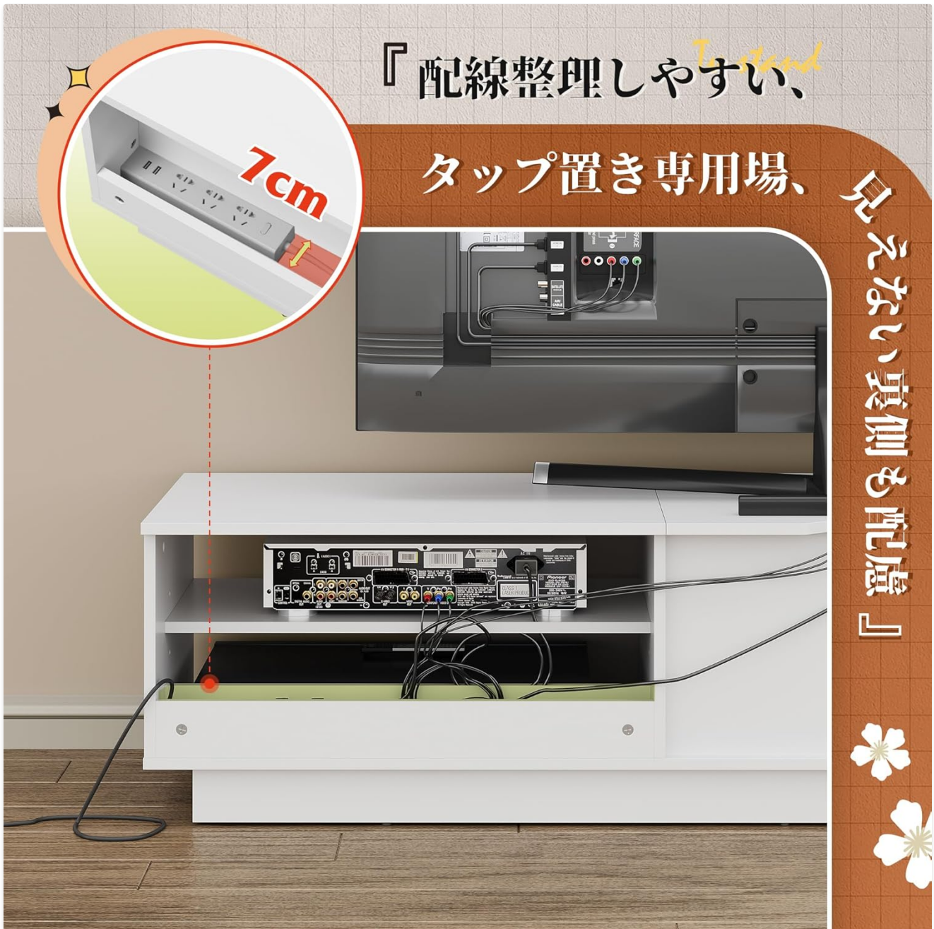
Image: The back of the TV stand, demonstrating the integrated cable management features and the space provided for power strips and wiring.