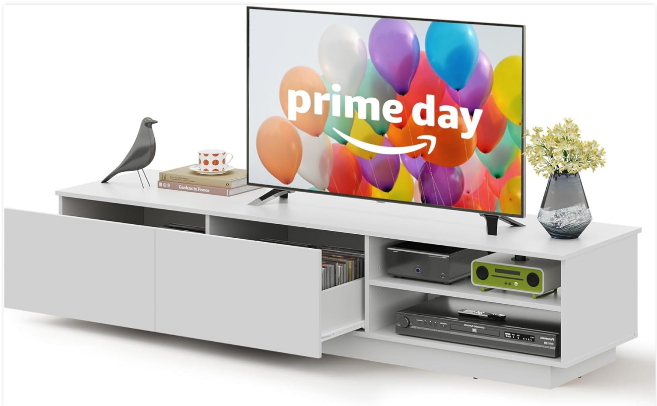
Image: The WLIVE TV Stand in white, featuring a television, decorative bird, books, and a vase with flowers. One drawer is slightly open, revealing storage space.

Thank you for purchasing the WLIVE TV Stand. This manual provides detailed instructions for the assembly, operation, and maintenance of your new TV stand. Please read this manual thoroughly before assembly and retain it for future reference.