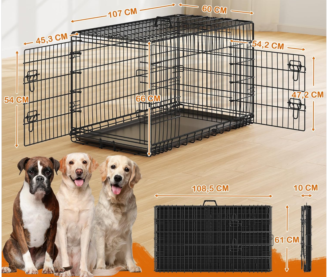
Image: A diagram illustrating the various dimensions of the dog crate (length, width, height, door sizes) and showing examples of medium-sized dog breeds (Boxer, Labrador, Golden Retriever) for which this crate is suitable.

Confort et sécurité optimaux pour votre ami à fourrure dans toutes les tailles