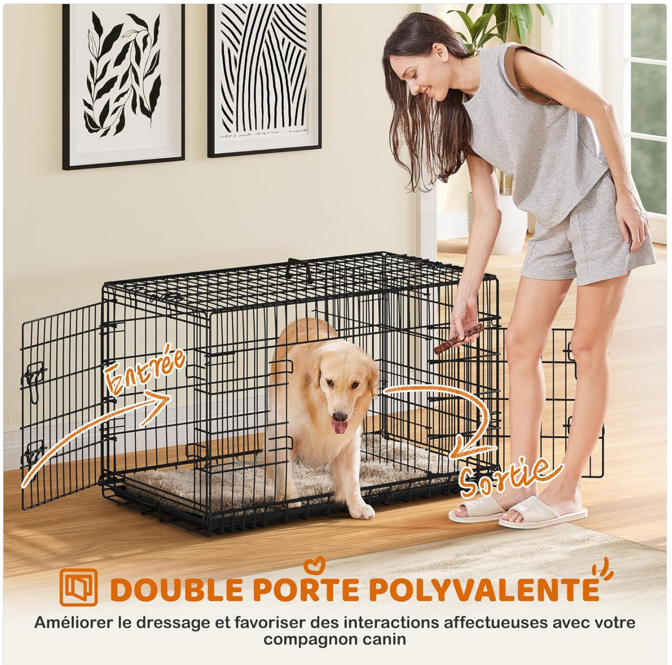
Image: A dog demonstrating the use of the double doors, with arrows indicating entry and exit points, highlighting the versatility for training and interaction.