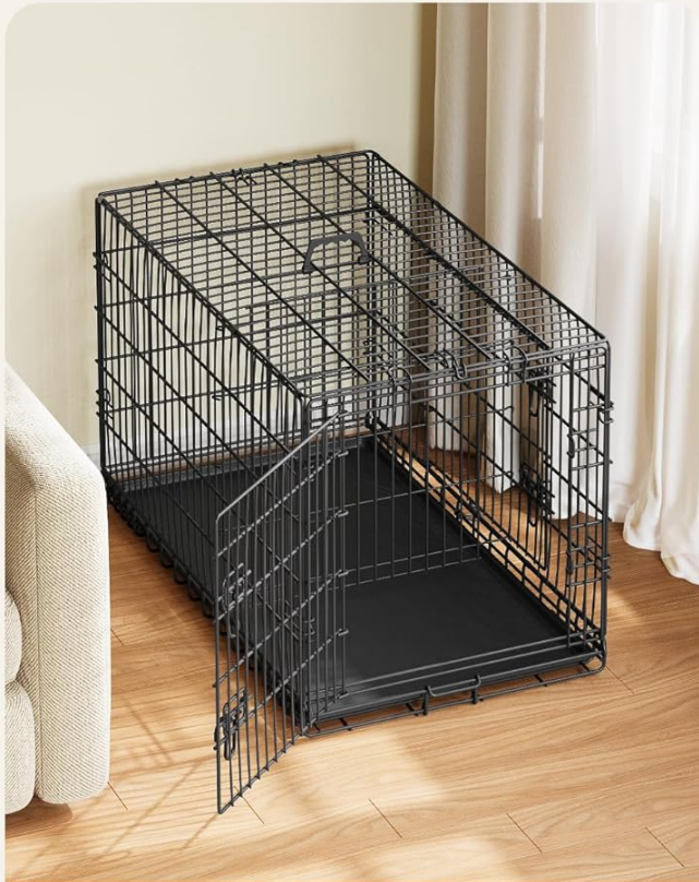
Porte latérale pour les espaces restreints

La conception à deux portes permet de s'adapter facilement à chaque espace