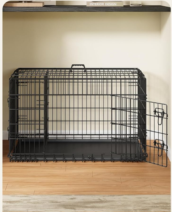
Porte avant pour les espaces spacieux

Image: Two separate views of the crate, one showing the side door open for use in confined spaces, and the other showing the front door open for more spacious areas, illustrating the dual-door convenience.