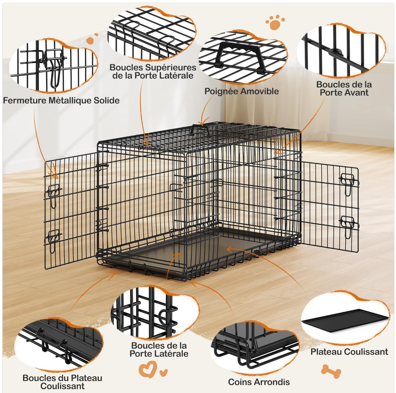
Image: A close-up view of various crate components, including the solid metal latch, top and side door buckles, removable handle, sliding tray, tray buckles, and rounded corners, illustrating the crate's robust construction and user-friendly features.

4. Installing the Divider (Optional): The crate includes a removable divider for adjusting the internal space, which is particularly useful for puppy training. Follow these steps: