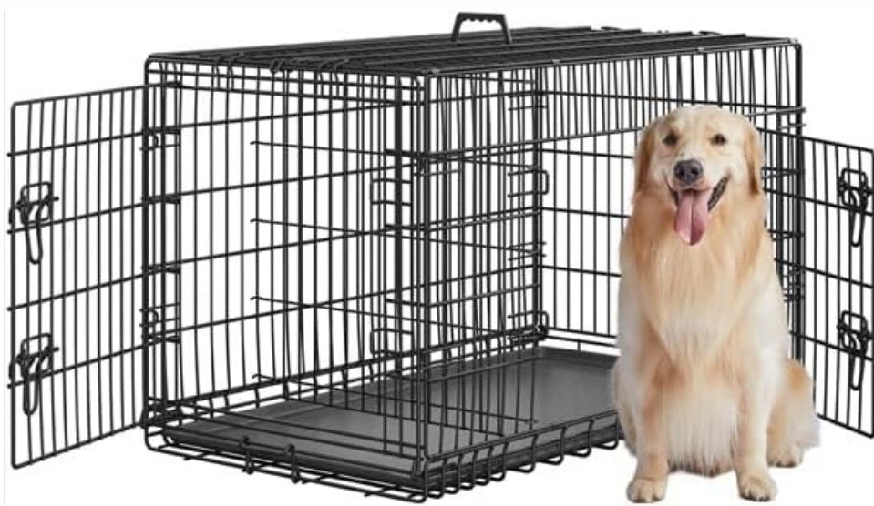
Image: The Yaheetech Foldable Dog Crate, showcasing its spacious design, with a happy Golden Retriever sitting beside it. The crate features two open doors, a removable tray, and a sturdy metal construction.

Thank you for choosing the Yaheetech Foldable Dog Crate. This manual provides essential information for the proper setup, operation, and maintenance of your new dog crate. Designed for versatility and convenience, this crate offers a safe and comfortable space for your pet at home, during training, or while traveling.