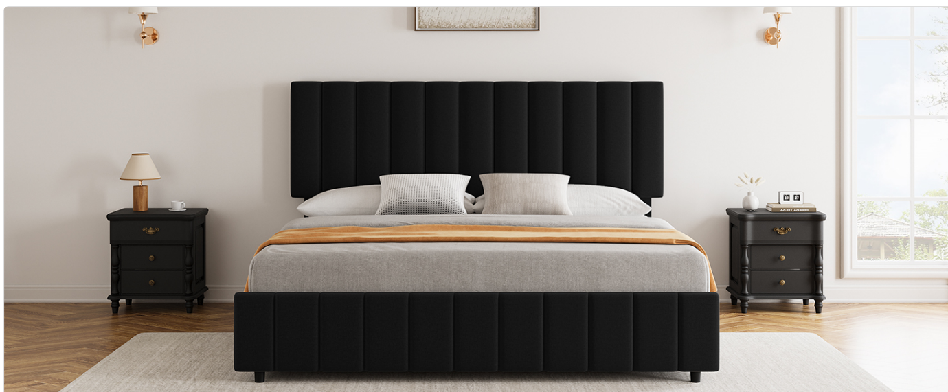
Figure 3.3: Illustration demonstrating the adjustable headboard feature, allowing height customization from 42.9" to 45.7" to fit various mattress thicknesses.