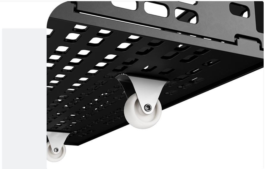
Figure 4.3: Close-up of the heavy-duty wheels on each drawer, designed for smooth and sturdy support when sliding the drawers in and out.

Each drawer is equipped with 4 heavy-duty wheels, providing smooth and sturdy support for easy sliding in and out.