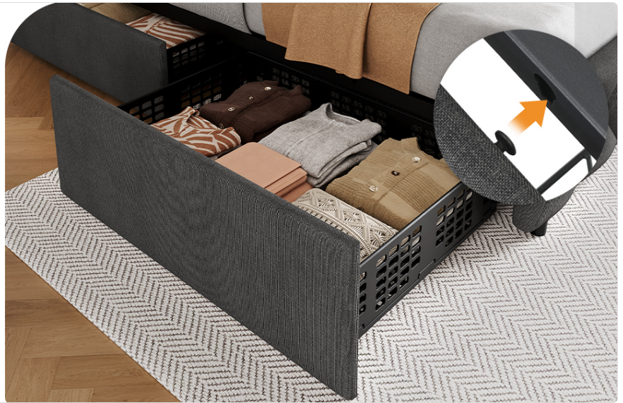
Figure 4.2: Detail of the drawer fixture design, which includes a small screw aligning with a hole to prevent the drawer from slipping out during use.

Each drawer comes with a small screw, aligning with the hole to prevent from slipping out.