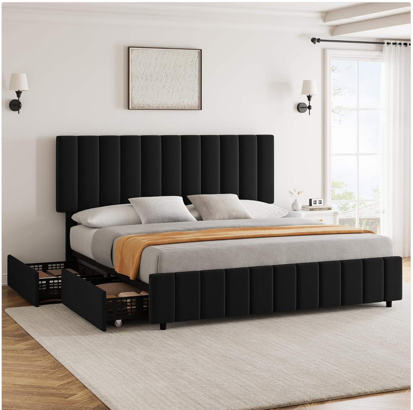
Figure 2.1: The GarveeHome Queen Upholstered Platform Bed Frame in black, featuring an adjustable headboard and four pull-out storage drawers.