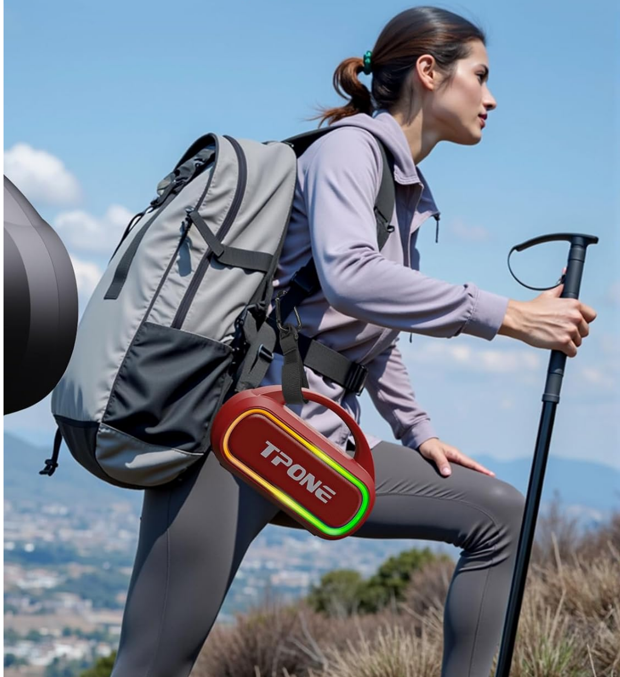
Image: The speaker demonstrating its IPX5 waterproof capability.

Your browser does not support the video tag.