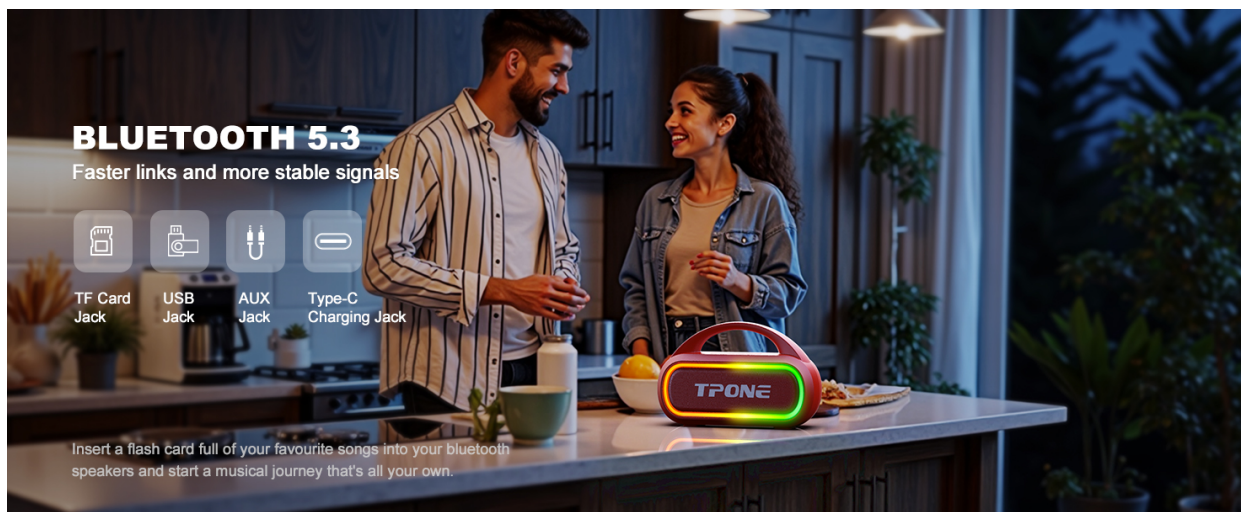
Image: Connectivity options including TF Card, USB, AUX, and Type-C charging.