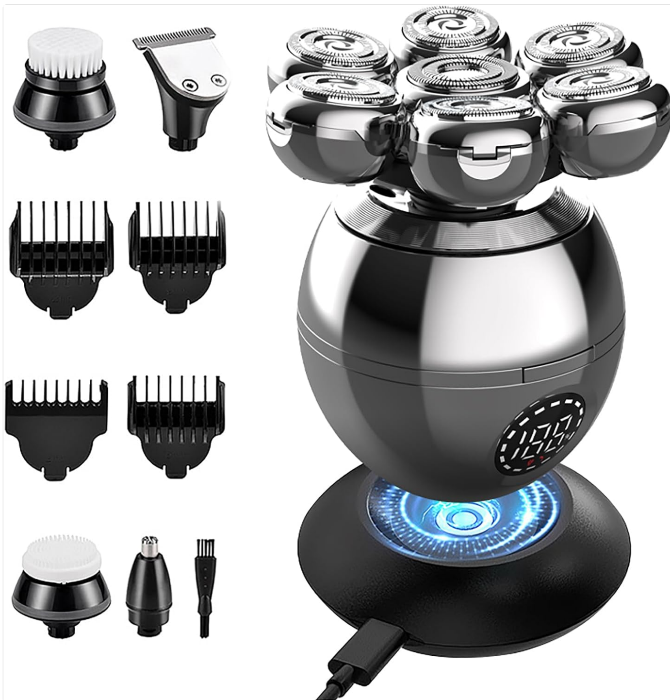
Image: The WAIKIL Multifunctional 7-Head Electric Shaver main unit, along with its various interchangeable heads including the facial massage brush, cleaning brush, nose hair trimmer, sideburns trimmer, and four limit combs. The charging base and a small cleaning brush are also shown.