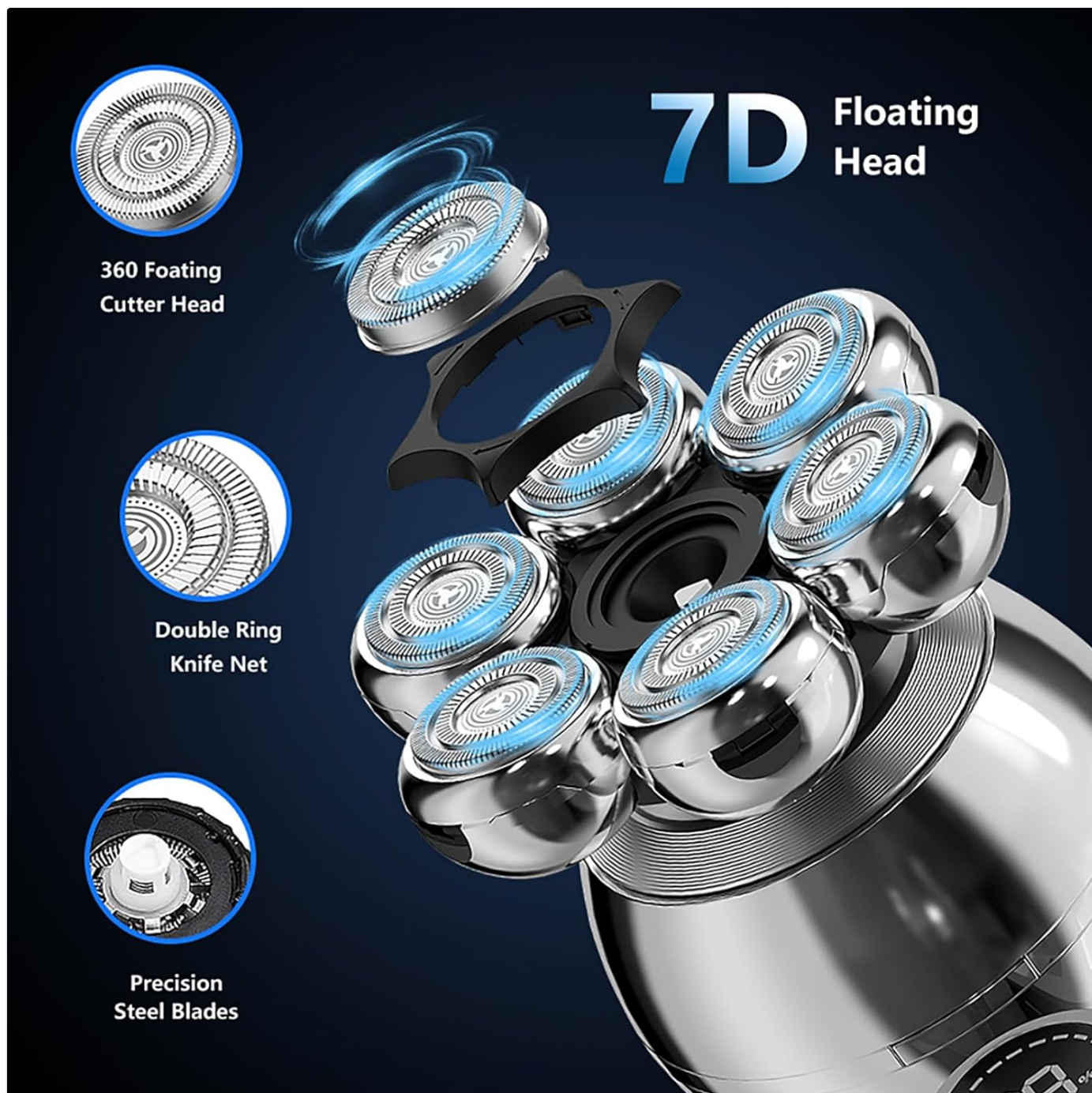
Image: A detailed view of the 7D Floating Head system. It illustrates the 360-degree floating cutter heads, the double-ring knife net for efficient cutting, and the precision steel blades designed for a close and smooth shave.