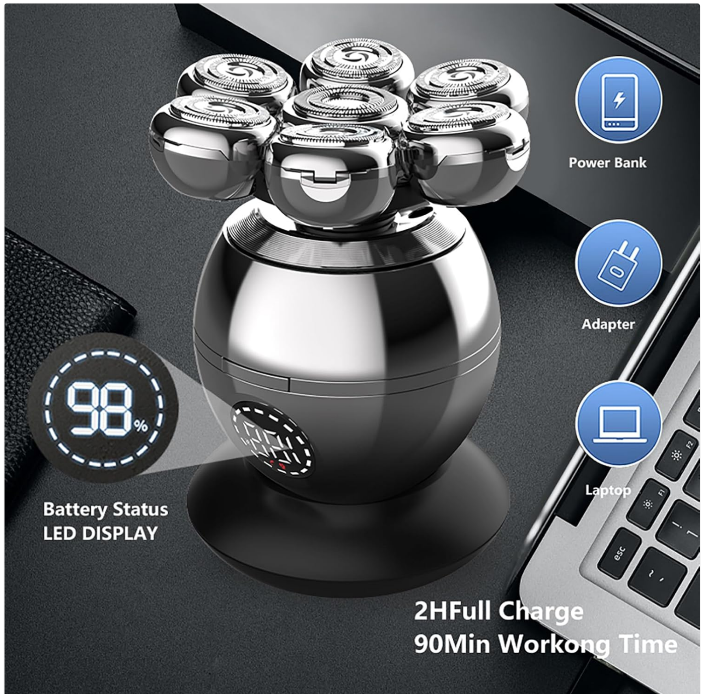
Image: The WAIKIL electric shaver resting on its charging base. The shaver's LED display clearly shows the battery percentage, indicating charging status. Icons for power bank, adapter, and laptop illustrate compatible charging methods.