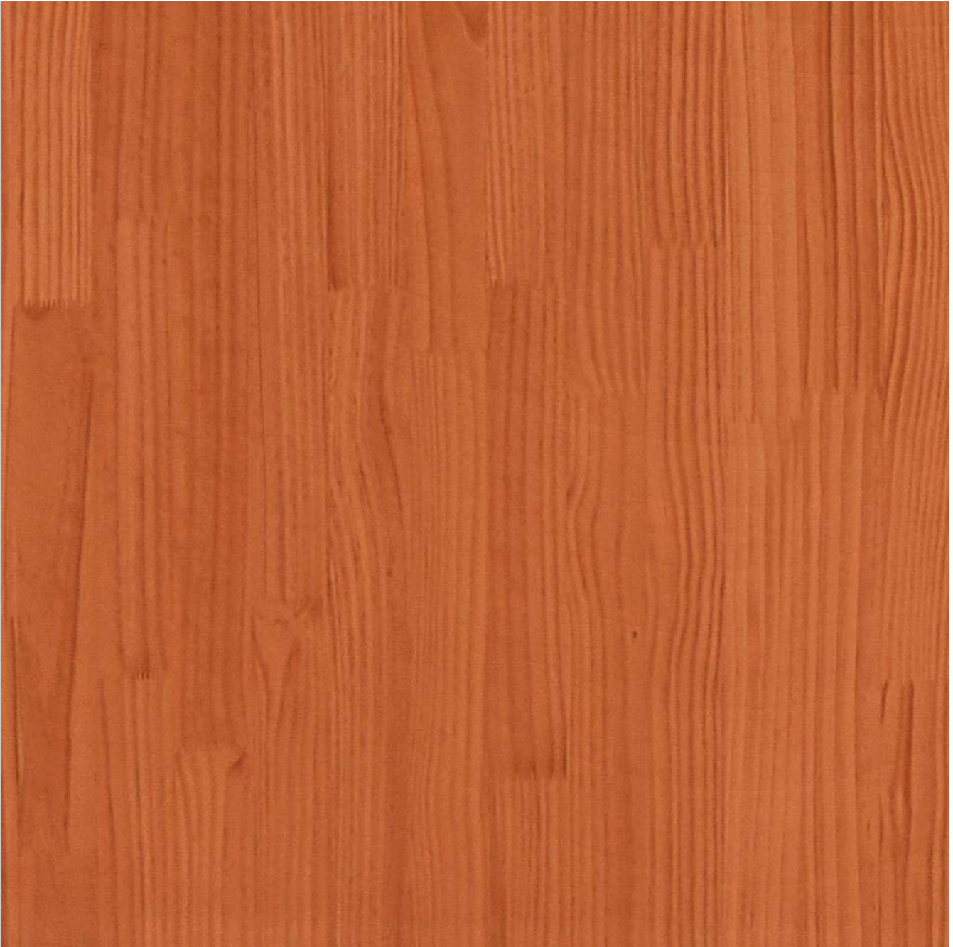
Image 6.1: Close-up view of the solid pine wood with waxed brown finish.

wood from direct sunlight and extreme temperature changes to prevent warping or fading.