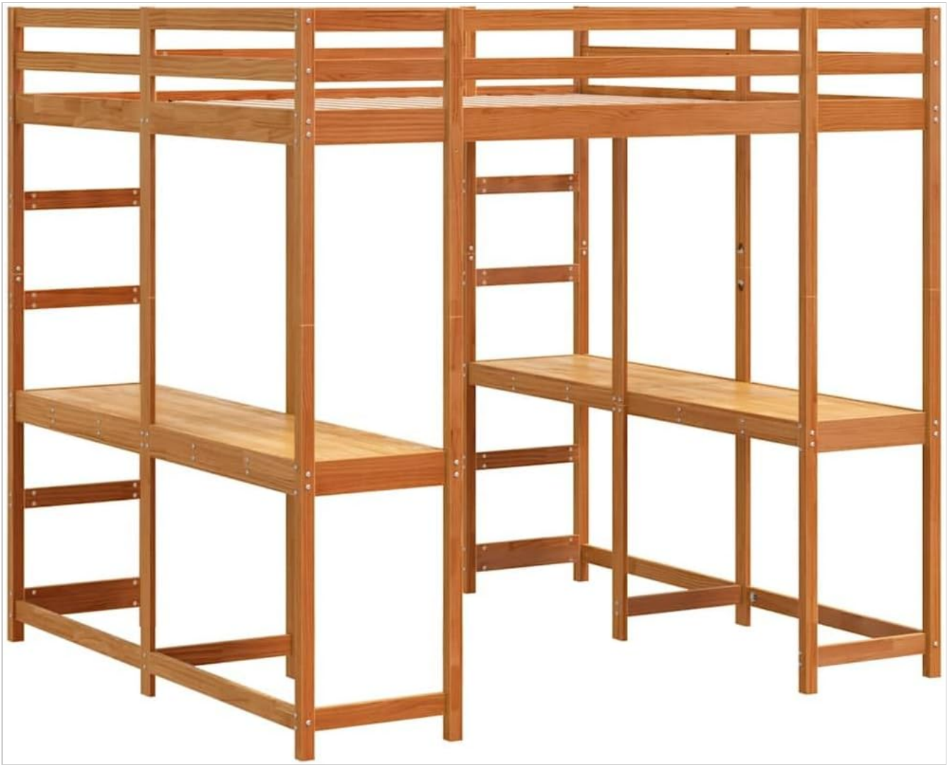
Image 4.2: Angled view illustrating the two integrated desk areas.