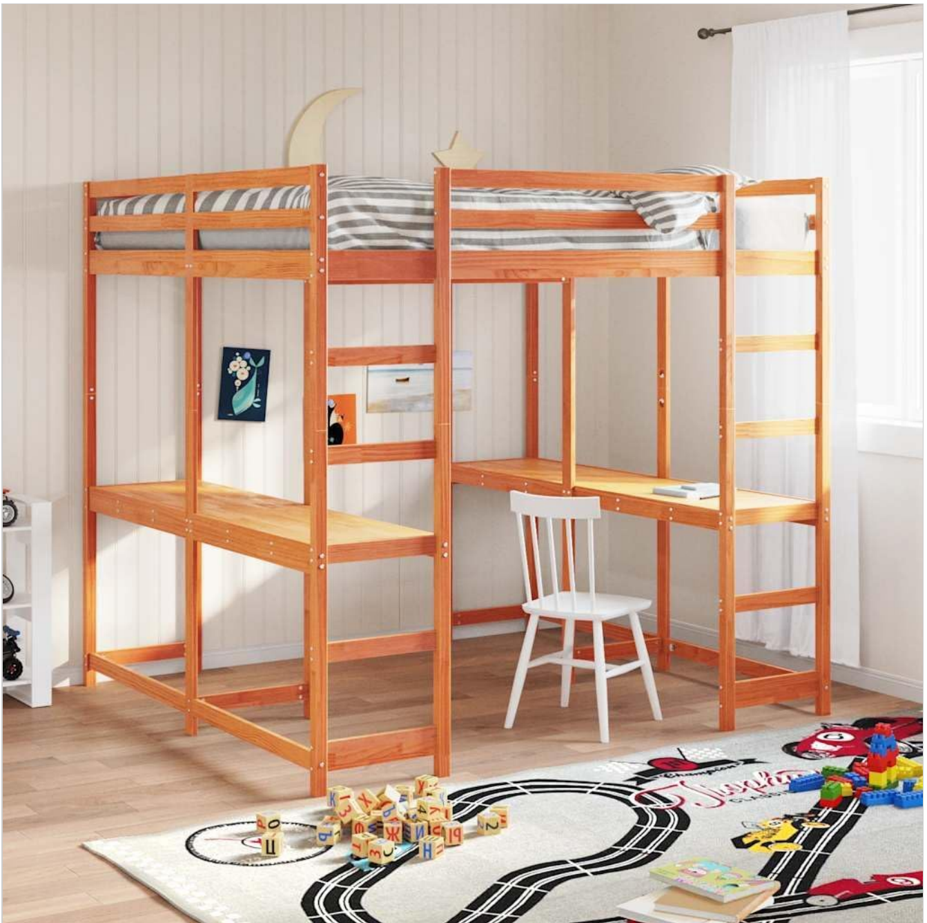
Image 1.1: Fully assembled vidaXL bunk bed with integrated desk and ladder in a room setting.