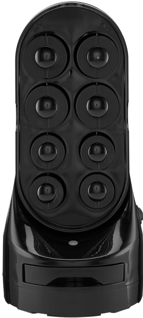
Figure 1: Front view of the BaBylissPRO Nano Titanium Standing Hot Roller Set, showing the vertical design and roller placement.