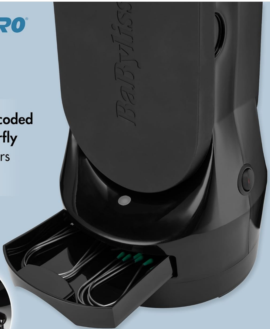
Figure 2: Side view of the hot roller set with the storage drawer open, revealing the roller pins and butterfly clips.