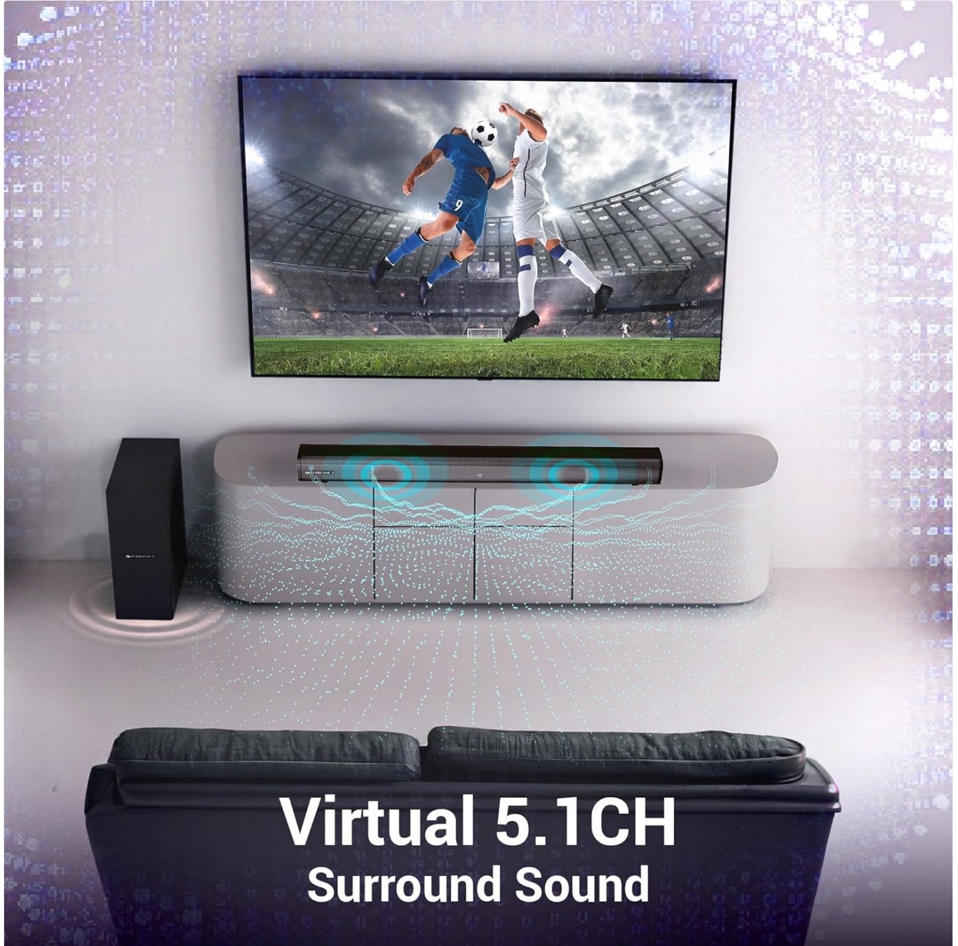
Image: A visual representation of the virtual 5.1 channel surround sound experience, showing the soundbar and subwoofer creating an immersive audio field around a television.

The ZEB-Juke Bar 3903 features virtual 5.1 surround sound, simulating a multi-channel environment for an immersive and cinematic audio experience.