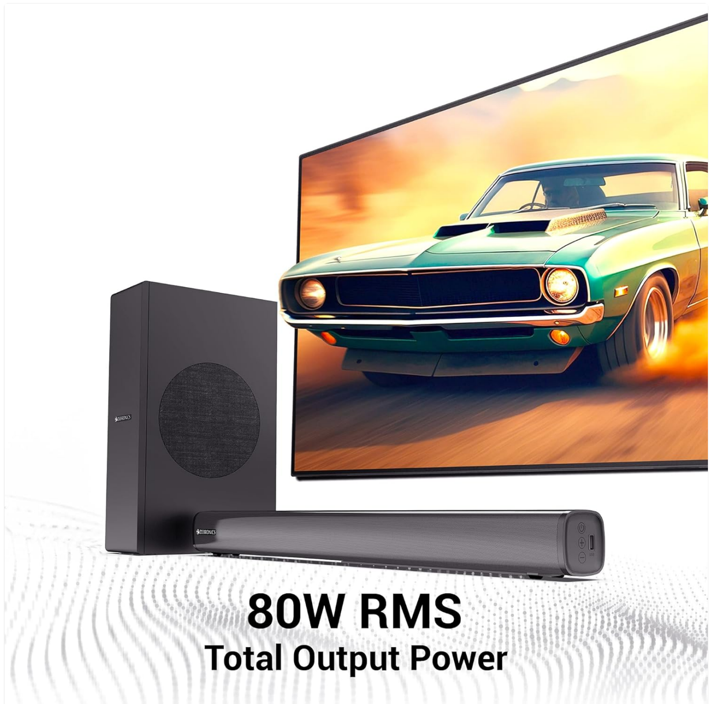
Image: The soundbar and subwoofer setup, highlighting the impressive 80W RMS total output power for a rich audio experience.

The ZEBRONICS Juke BAR 3903 is an 80W RMS sound system designed to enhance your audio experience. It features a soundbar with dual drivers and a dedicated subwoofer for powerful bass.