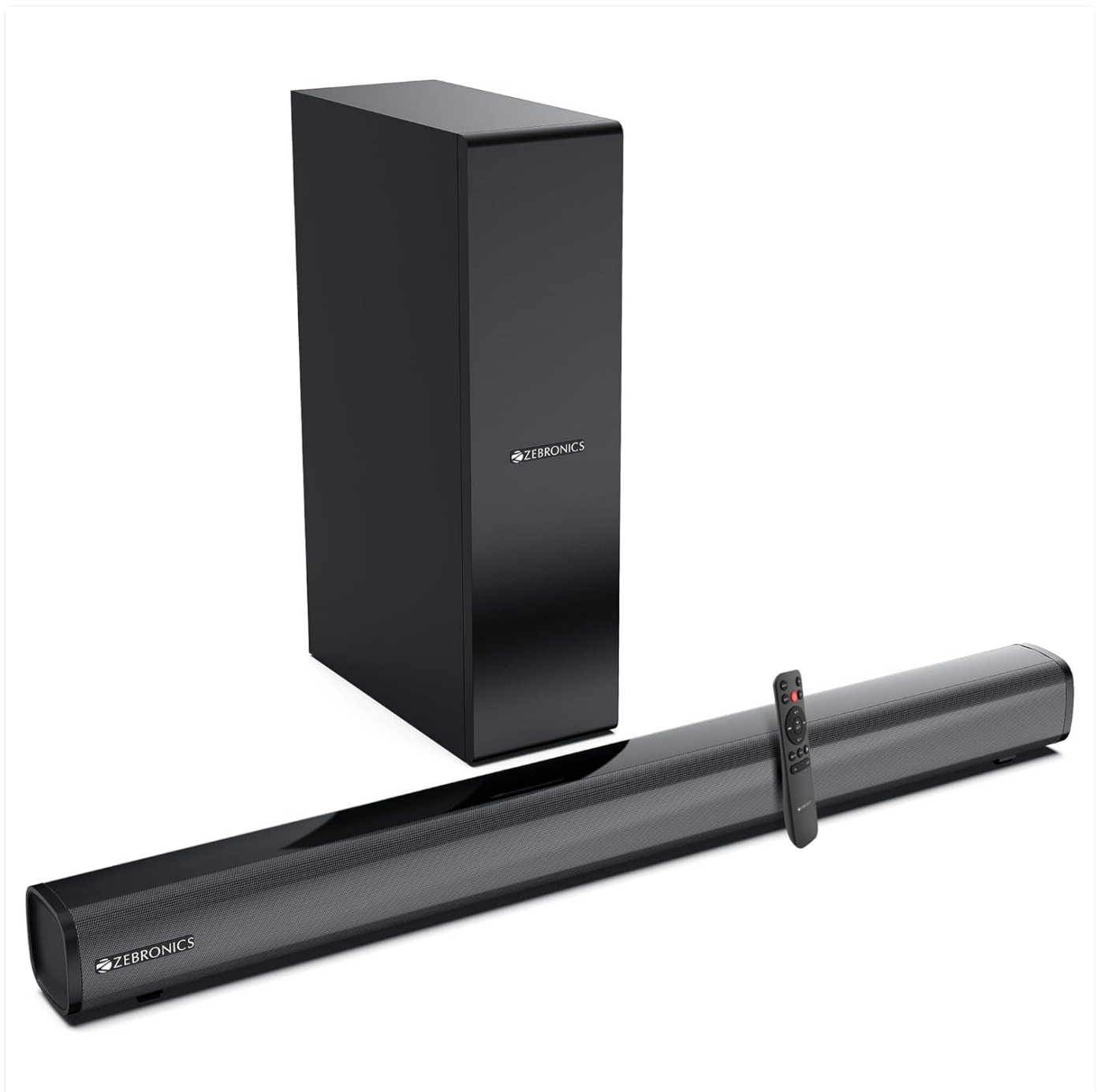
Image: The ZEBRONICS Juke BAR 3903 Soundbar, its accompanying subwoofer, and the remote control, showcasing the complete system.