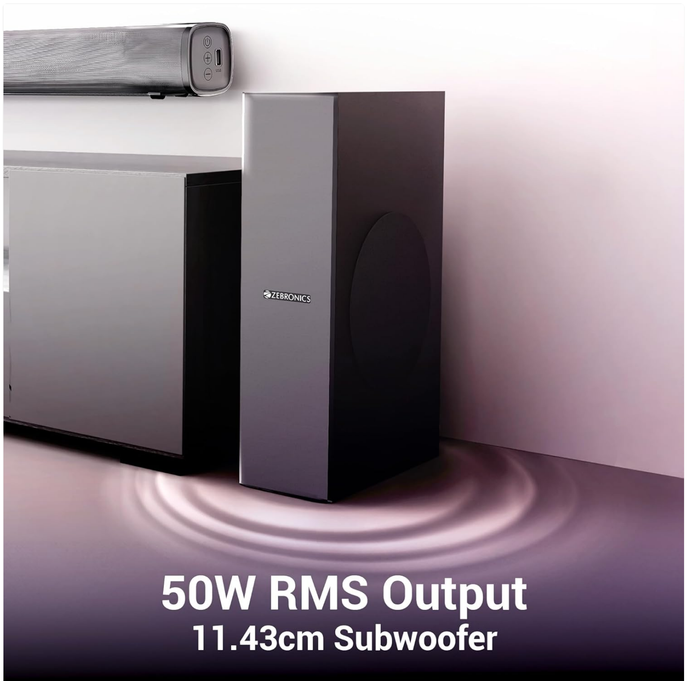
Image: The subwoofer, emphasizing its 50W RMS output and 11.43cm driver for deep bass.