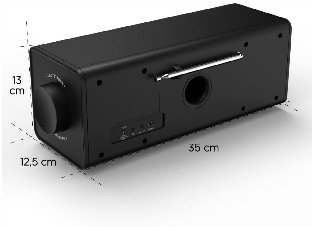
Image: Diagram showing the dimensions of the Hama DR2002BT Digital Radio: 35 cm (width), 12.5 cm (depth), and 13 cm (height).