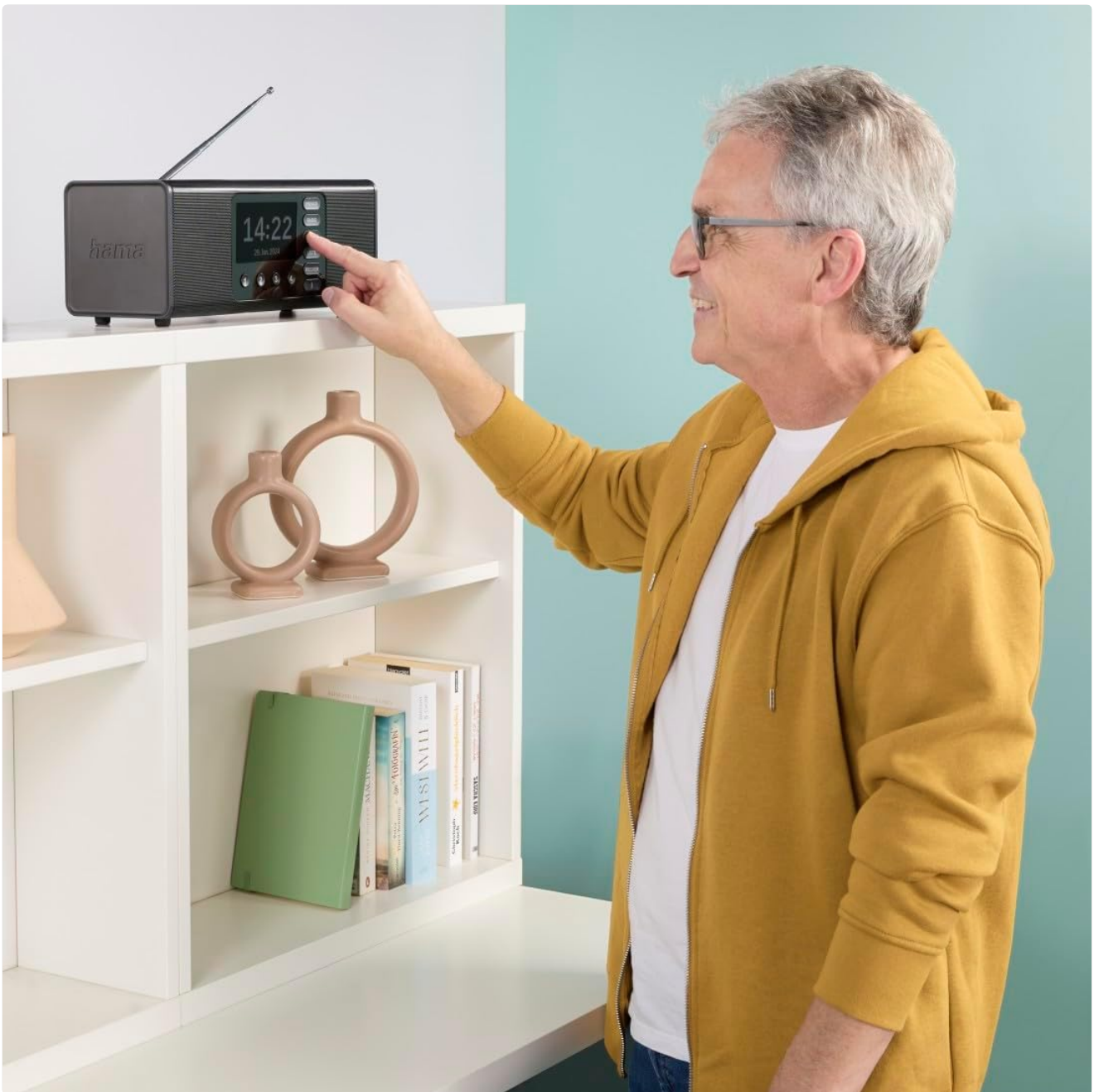
Image: A person interacting with the Hama DR2002BT Digital Radio, demonstrating its ease of use for setting functions like alarms or tuning stations.