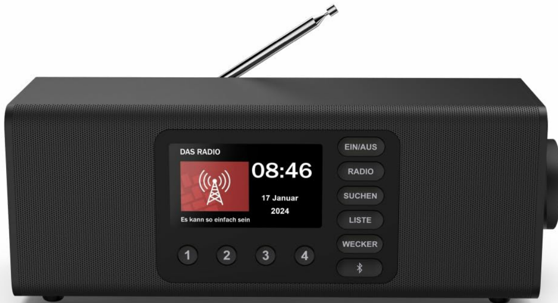
Image: Front view of the Hama DR2002BT Digital Radio, showcasing its display and control buttons.