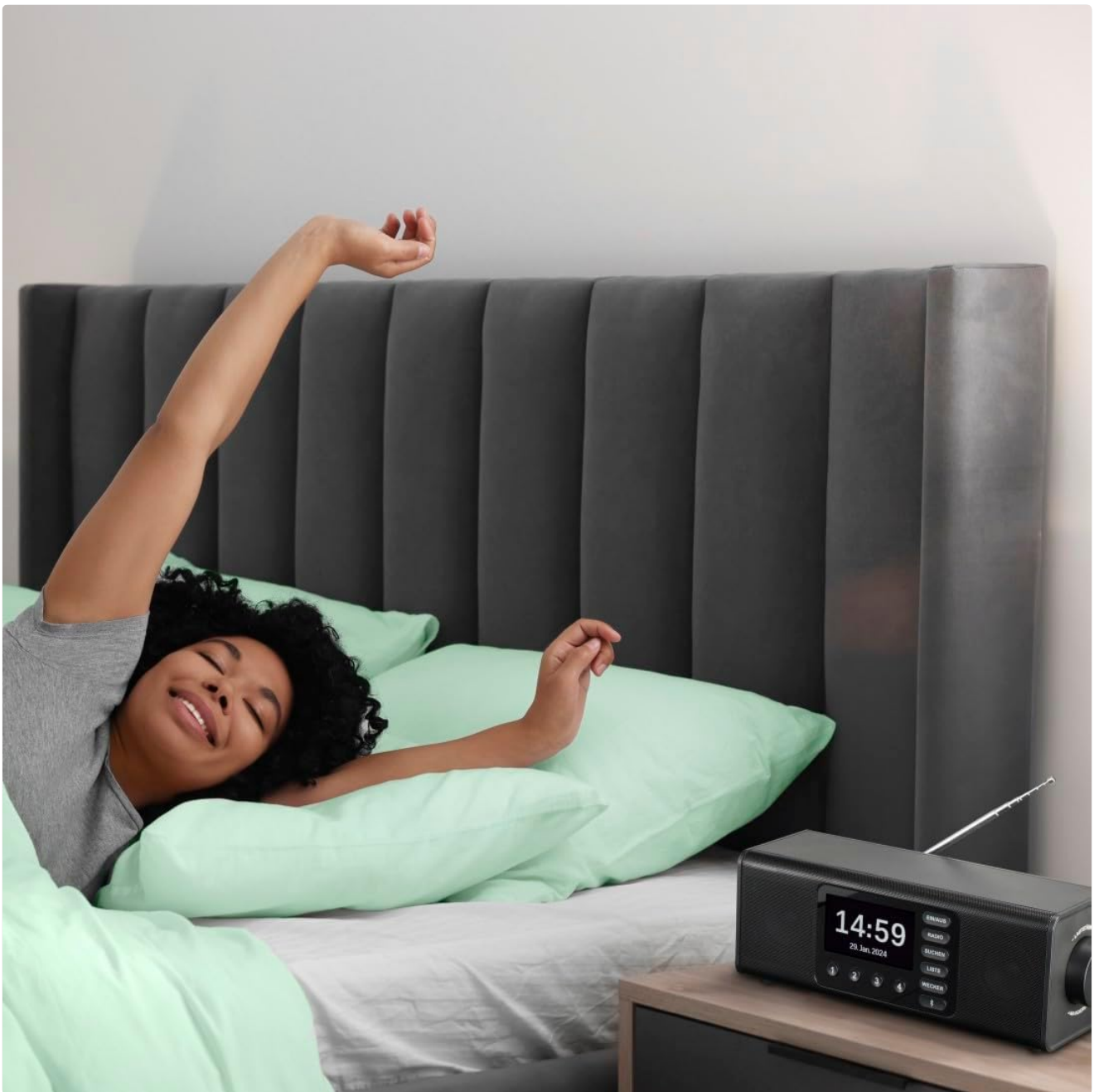
Image: A person waking up with the Hama DR2002BT Digital Radio placed on a bedside table, illustrating its alarm clock functionality.

The radio features two independent alarm settings.