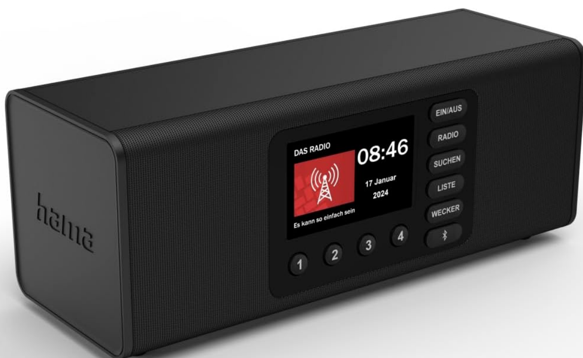
Image: Front panel of the radio highlighting the display and control buttons, with icons for Bluetooth, DAB+, and Alarm functions.

The front panel features a 4.3-inch TFT color display, large control buttons, and a rotary knob for easy navigation and selection. Key buttons include: