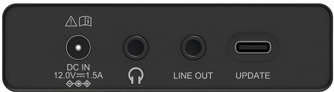
Image: Close-up of the rear panel showing the DC IN, Headphone, Line Out, and UPDATE (USB-C) ports.

The rear panel provides essential connectivity options: