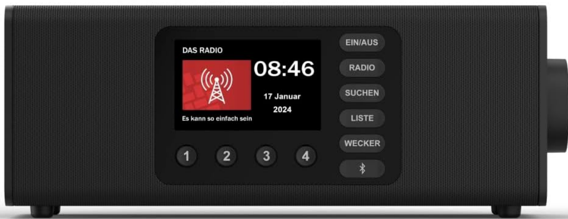
Image: Front view of the radio with Bluetooth and stereo speaker icons, indicating its wireless audio streaming capability.

The Hama DR2002BT can stream audio from your smartphone, tablet, or laptop via Bluetooth 5.0.