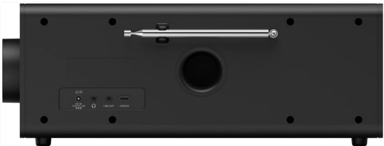
Image: Rear view of the Hama DR2002BT Digital Radio with its telescopic antenna extended for optimal signal reception.