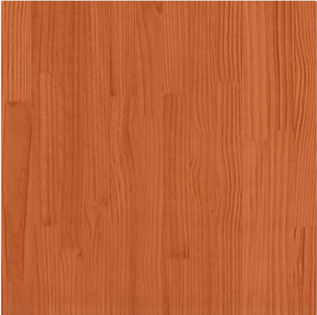
Figure 6.1: A close-up image revealing the natural grain and texture of the solid pine wood, emphasizing the material's rustic characteristics.