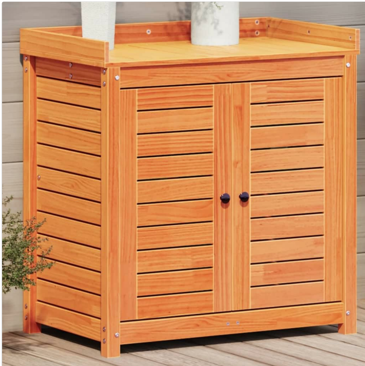
Figure 5.1: A clear front view of the assembled potting table with its cabinet doors closed, ready for use as a functional gardening station.