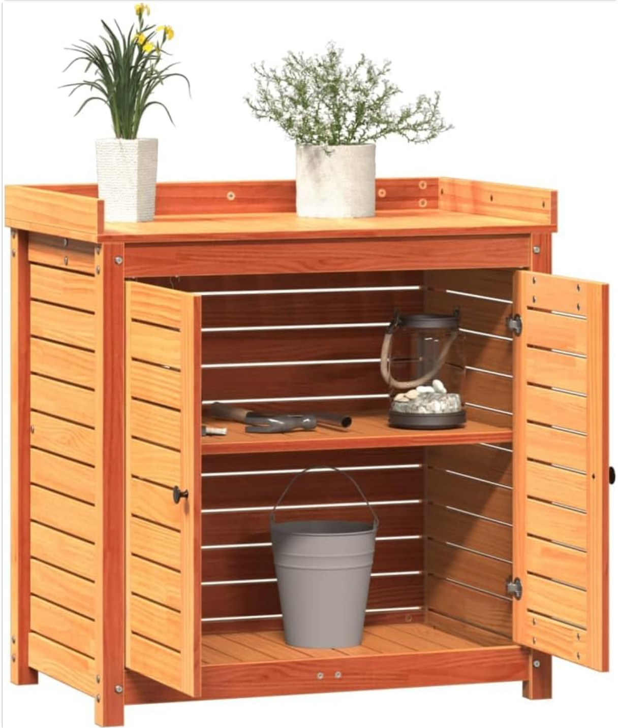
Figure 3.1: The potting table with its cabinet doors open, illustrating the internal storage shelf and overall construction, which includes various panels and hardware.