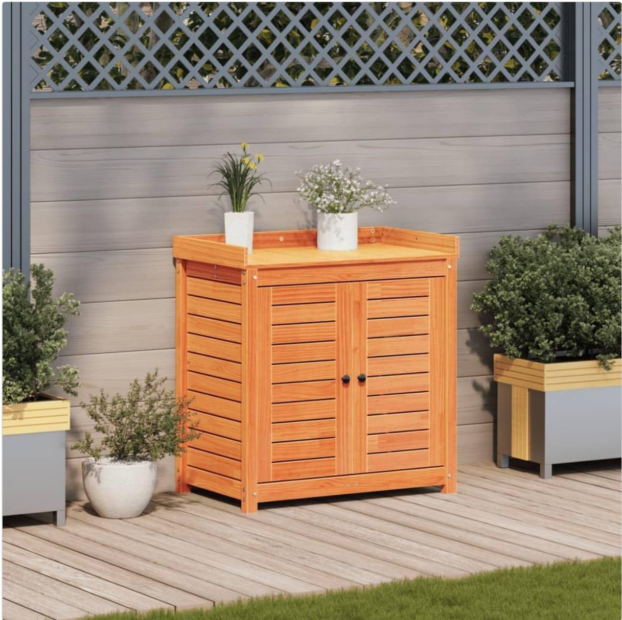
Figure 1.1: The Generic 844635 Potting Table positioned in an outdoor garden environment, showcasing its functional design and natural wood finish.