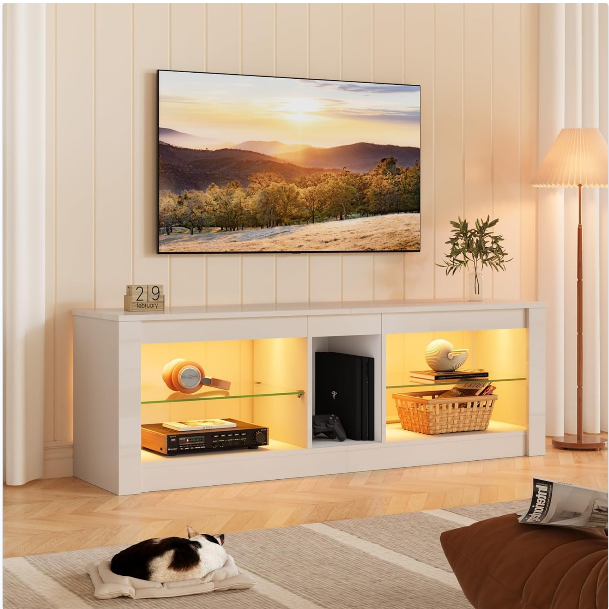
Image: The Bestier Modern TV Stand, showcasing its design and integrated LED lighting in a typical living room setup.