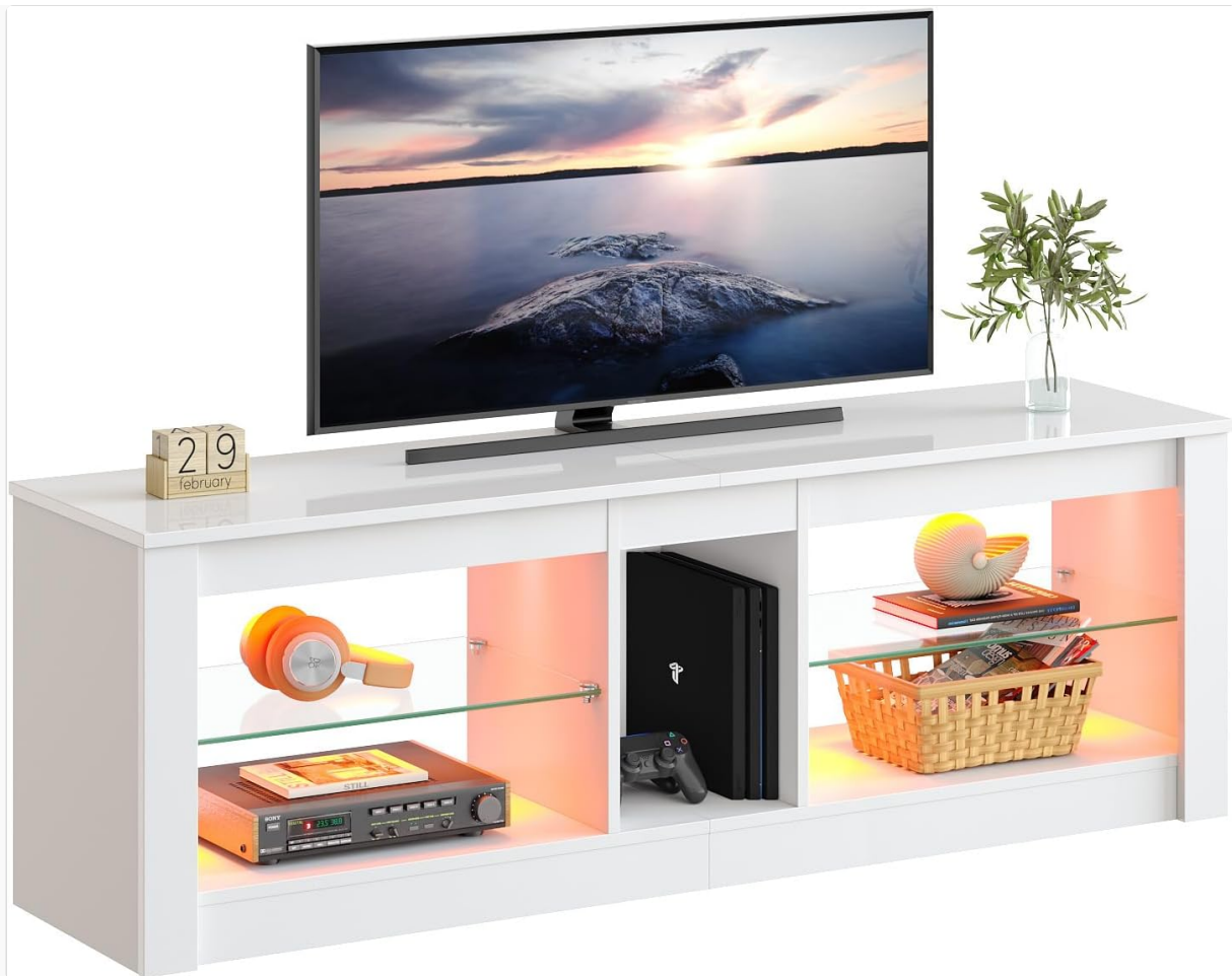
Image: Detailed view of the TV stand's construction, highlighting its sturdy structure, use of safe P2 particle board, the anti-tip kit, and cable management features.