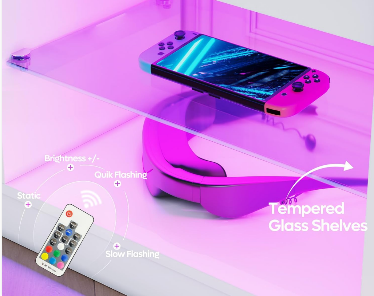
Image: The LED remote control and the illuminated tempered glass shelves, demonstrating the 22 dynamic lighting modes and brightness adjustments.