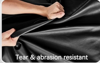
Tear & abrasion resistant