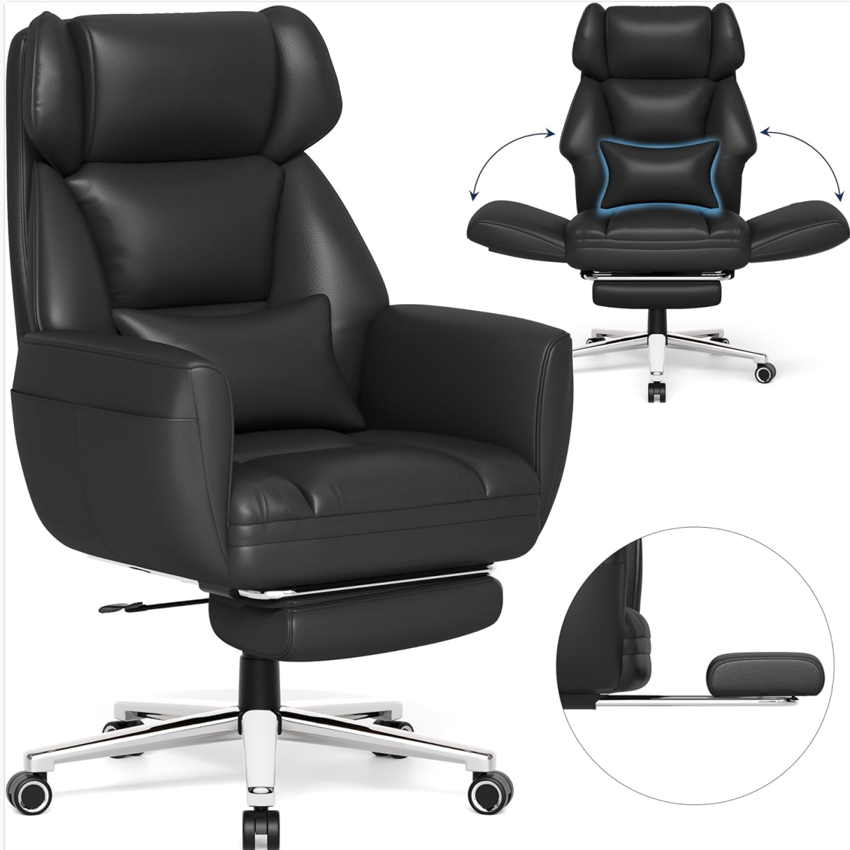
Image: The GABRYLLY GY82766 ergonomic office chair in black, showcasing its design and features.

Important: Ensure all components are securely fastened before using the chair. Do not overtighten screws.