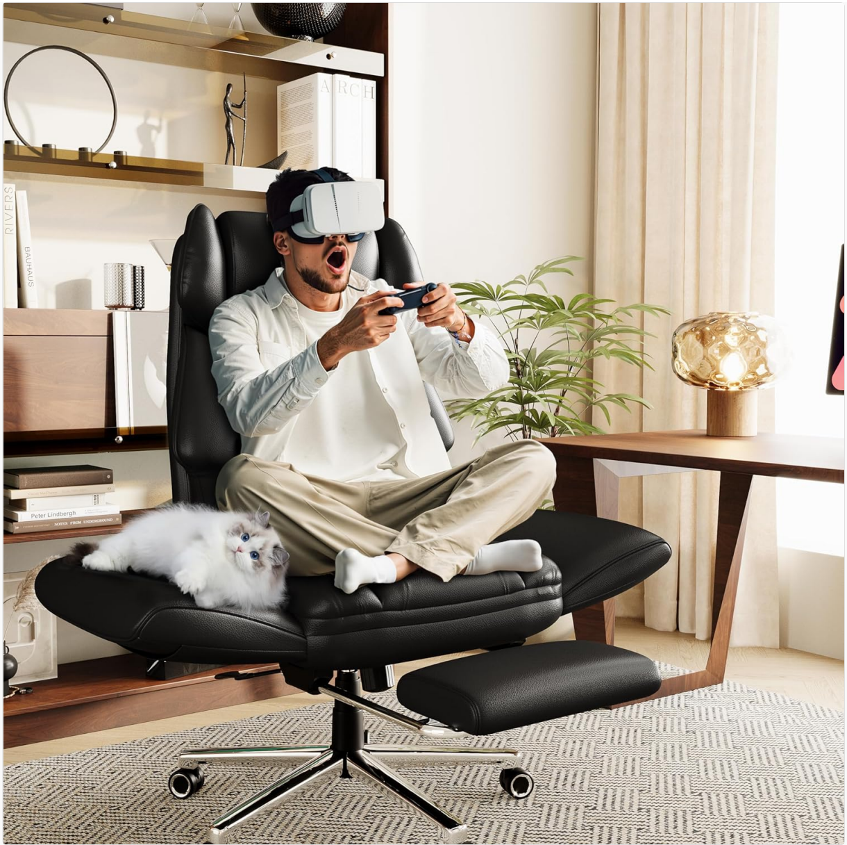
Image: A person comfortably seated cross-legged on the chair with the footrest extended, demonstrating its use for relaxation.