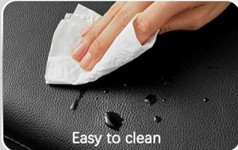
Easy to clean