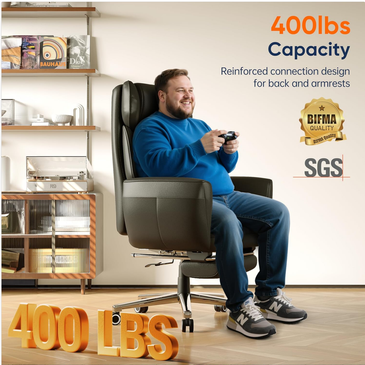
Image: A person seated in the chair, highlighting its 400 lbs weight capacity and BIFMA/SGS quality certifications.