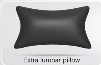
Extra lumbar pillow