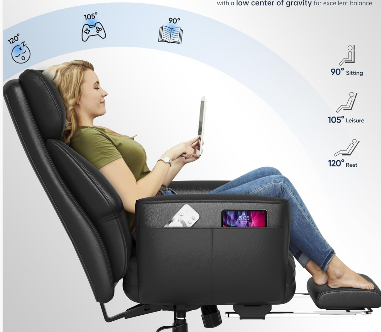
Image: Illustration of the chair's 3-gear recline function, showing 90°, 105°, and 120° positions with a person using a tablet.

3 lockable recline positions, reclining up to 120°, with a low center of gravity for excellent balance.