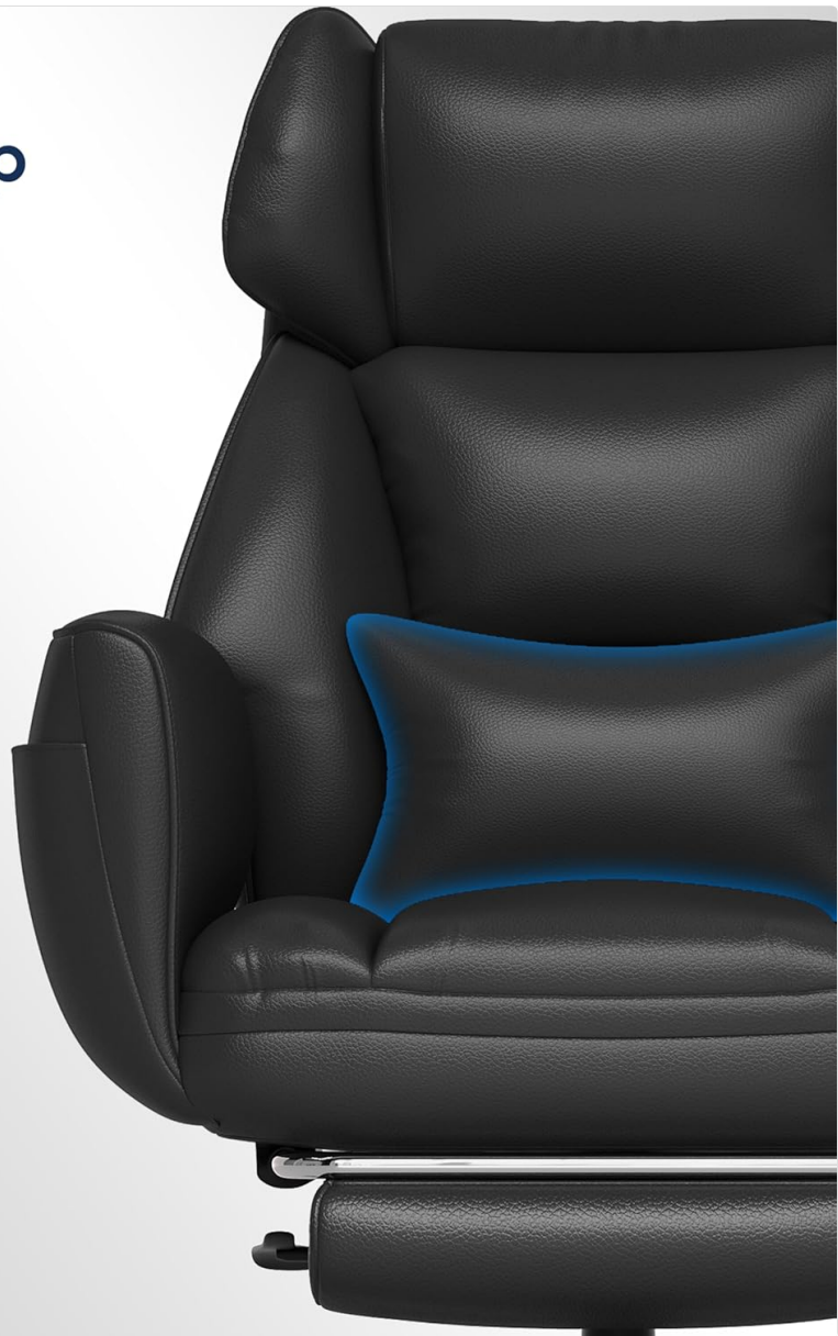
Image: Close-up showing the chair's premium craftsmanship, including tear and abrasion-resistant, easy-to-clean leather with double stitching.