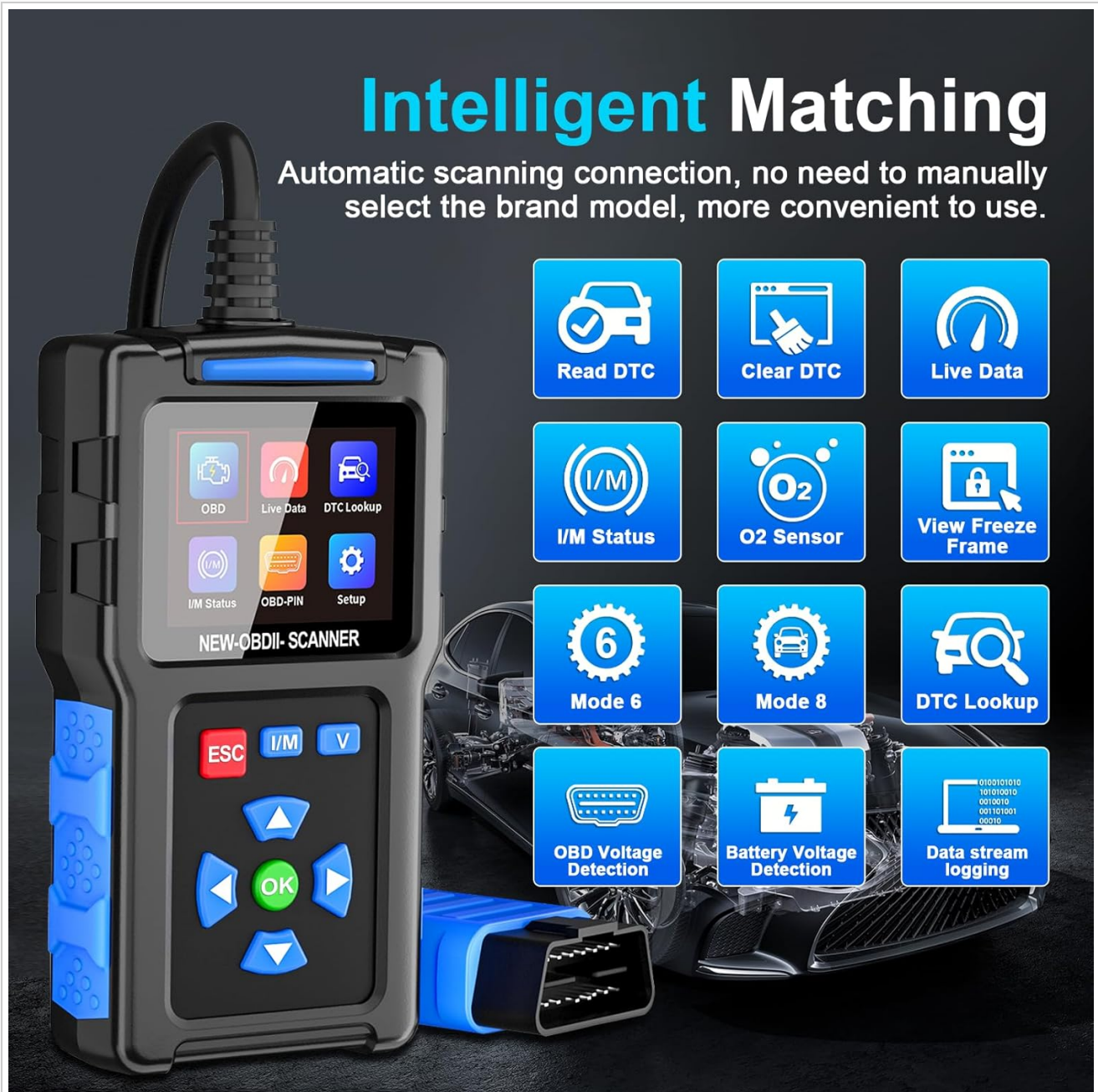
Figure 2.1: T200 Main Interface and Functions

This image shows the Topdiag T200 scanner's display with icons for various functions like Read DTC, Clear DTC, Live Data, I/M Status, O2 Sensor, View Freeze Frame, Mode 6, Mode 8, DTC Lookup, OBD Voltage Detection, Battery Voltage Detection, and Data Stream Logging.