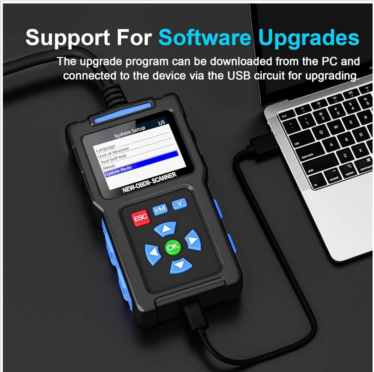
Figure 5.1: Software Update Process

This image shows the Topdiag T200 scanner connected via a USB cable to a laptop, illustrating the process for performing a software update.