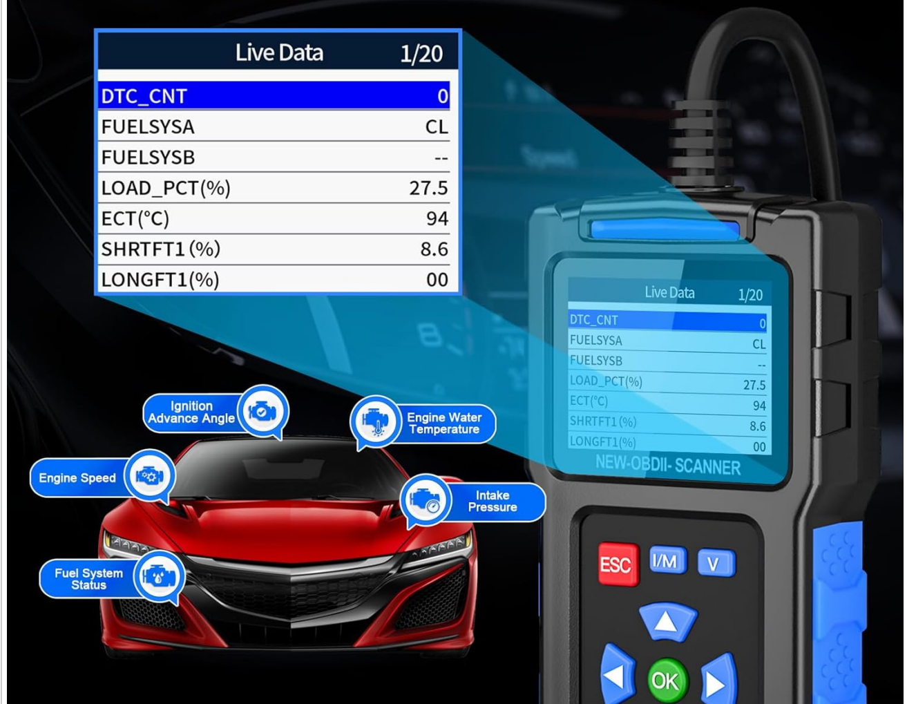
Figure 3.3: Live Data Viewing

View real-time car data, car condition data at a glance, Protect your travel safety.