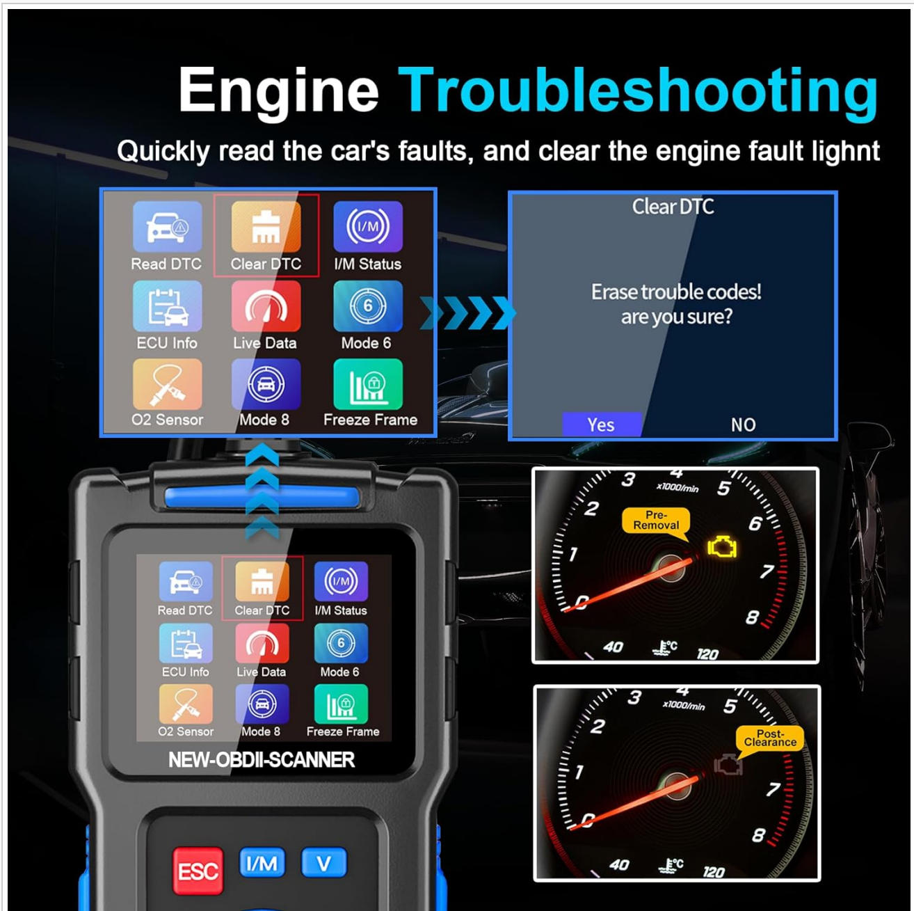
Figure 3.1: Clearing DTCs

The image illustrates the process of clearing DTCs, showing a prompt asking for confirmation to erase codes and a comparison of the dashboard engine light before and after clearance.