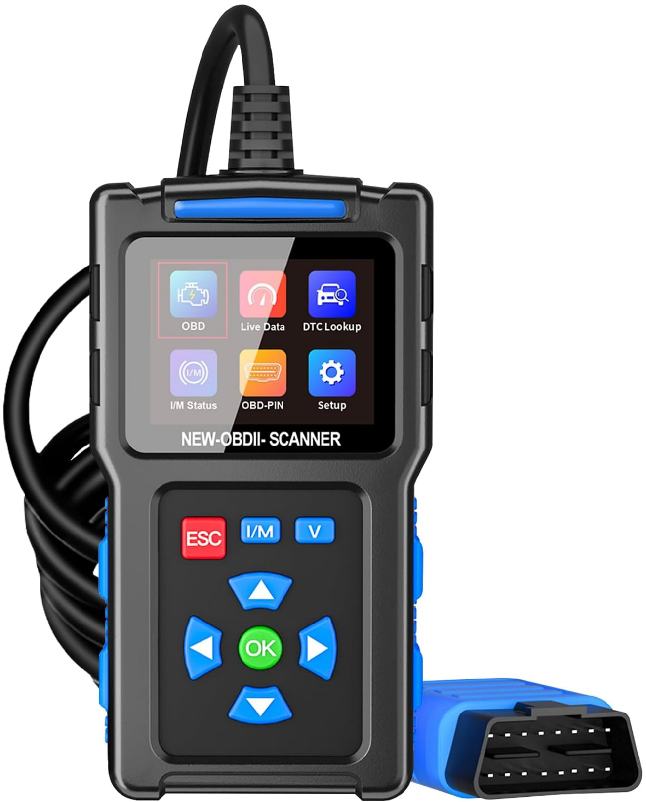
Figure 1.1: Topdiag T200 OBD2 Scanner

The image displays the Topdiag T200 OBD2 Scanner, a handheld device with a color screen and navigation buttons, connected to an OBD-II diagnostic cable.