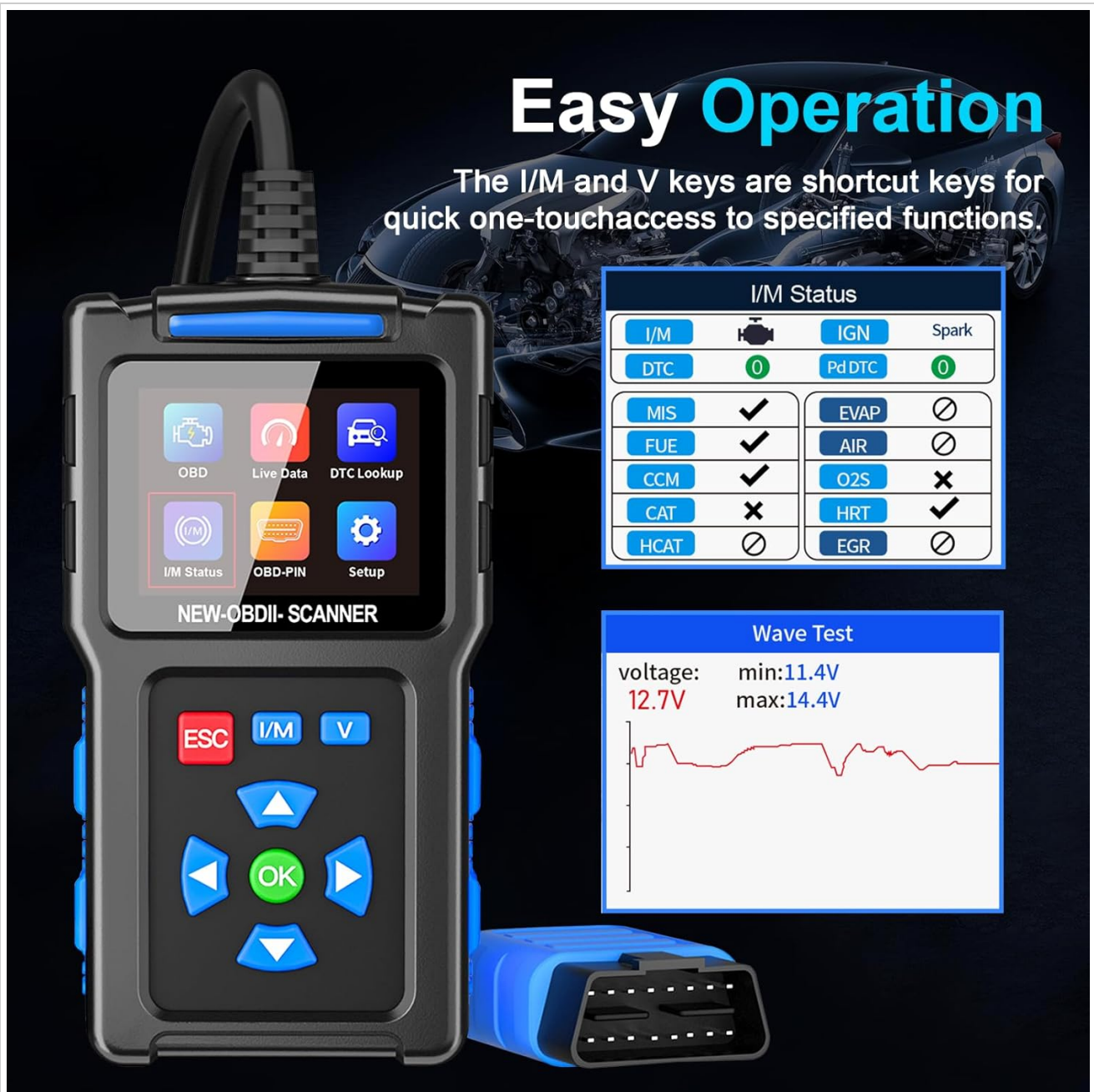
Figure 3.2: I/M Readiness Status

The I/M and V keys are shortcut keys for quick one-touch access to specified functions.