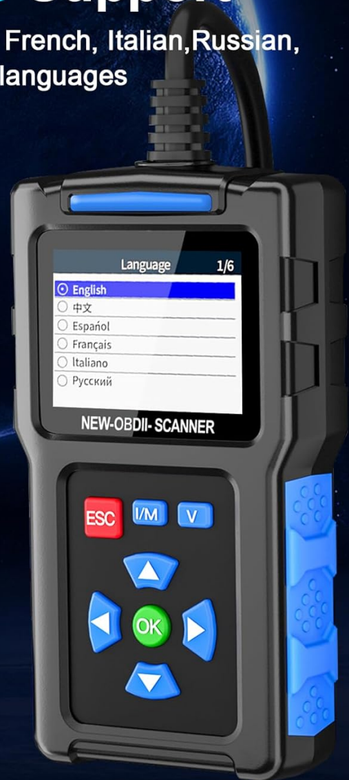
Figure 3.8: Multi-Language Support

The image shows the T200's language selection menu, highlighting English as the currently selected language among options like Spanish, French, Chinese, Italian, and Russian.