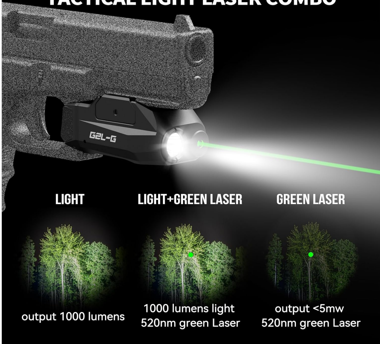
Image: Visual representation of the G2L-G's light and laser modes.