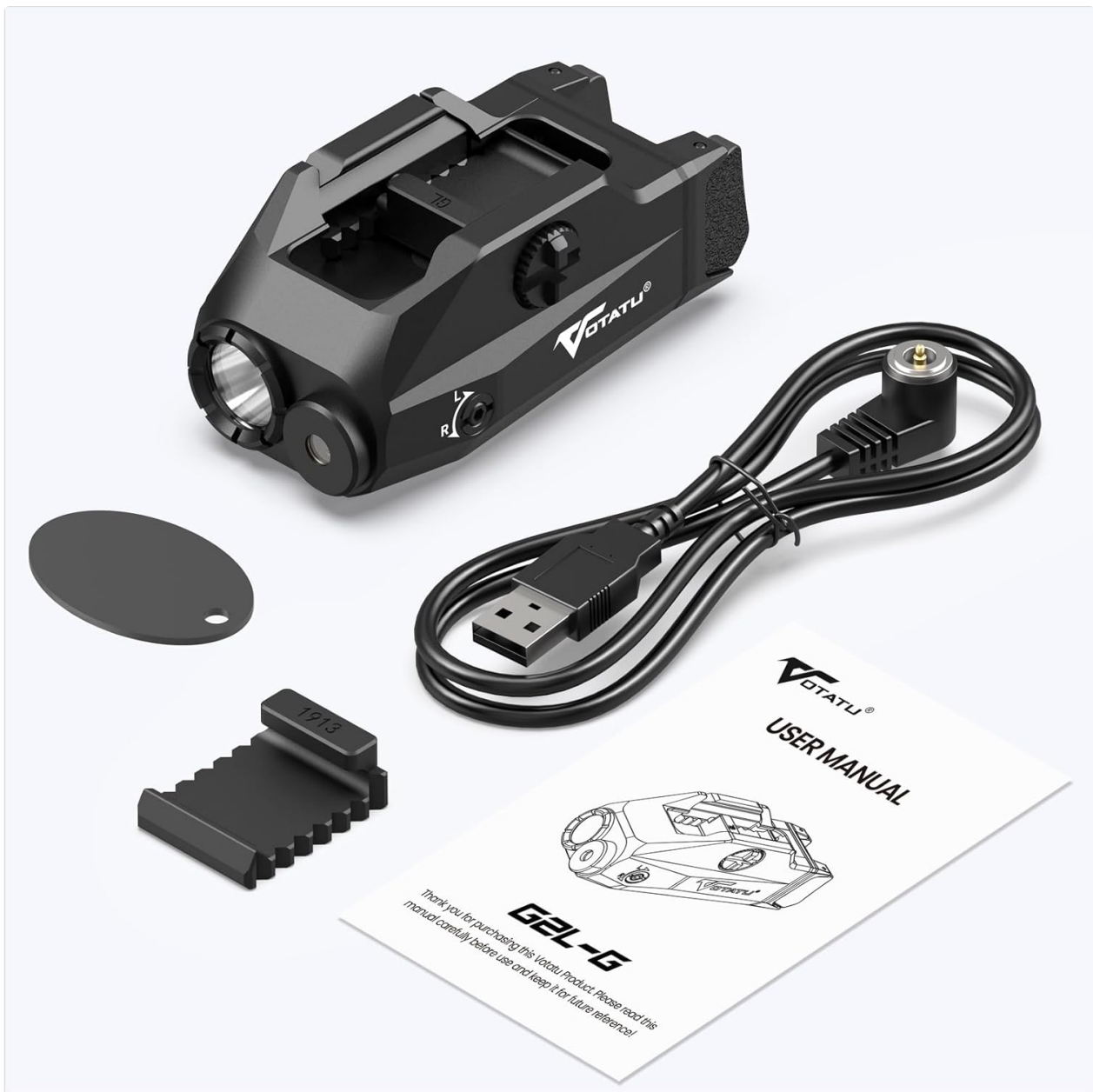
Image: The G2L-G's ambidextrous switches, designed for intuitive control.