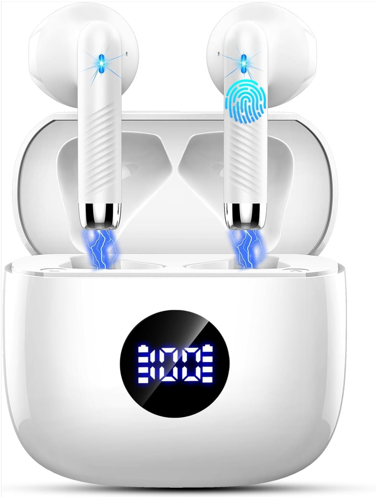
Image: zakotu J53 Wireless Earbuds in their charging case, showing the digital LED battery display and touch control areas.