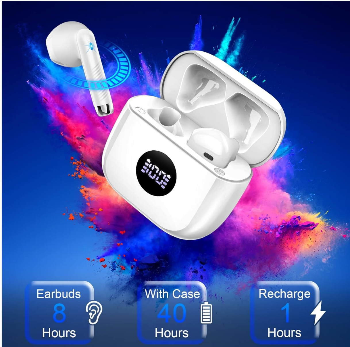
Image: The zakotu J53 charging case displaying battery levels, indicating up to 8 hours of earbud playback and 40 hours with the case, with a 1-hour recharge time.