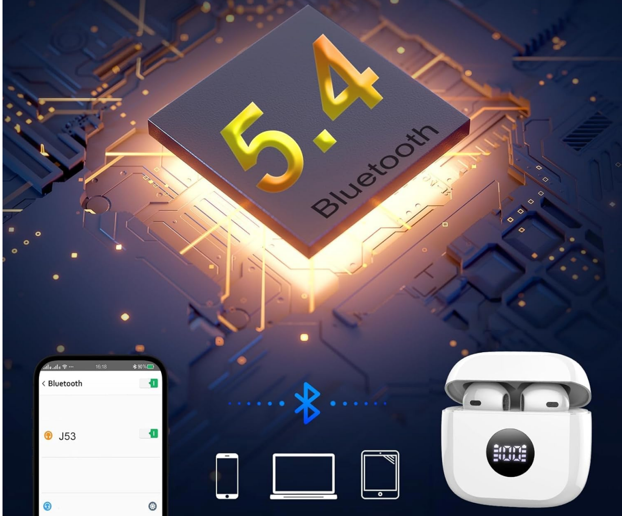
Image: Diagram illustrating the Bluetooth 5.4 connection process for the J53 earbuds with various devices, showing "J53" in the device's Bluetooth settings.

Connecting and pairing in 1 second once you open the charging case.