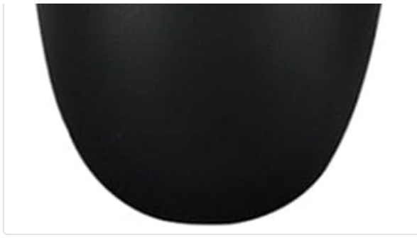
Figure 2: Back view of the remote control, highlighting the battery compartment for installation.