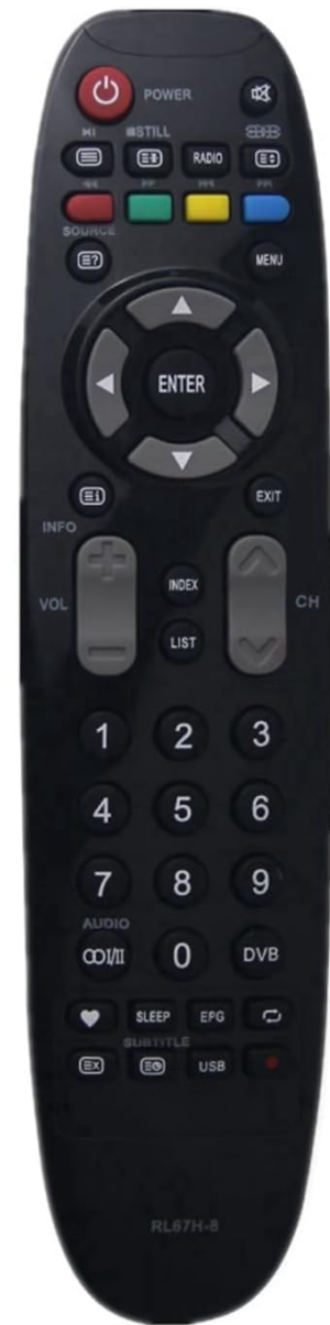
Figure 4: Product description image showing material (Plastic/ABS) and function (Infrared Control).