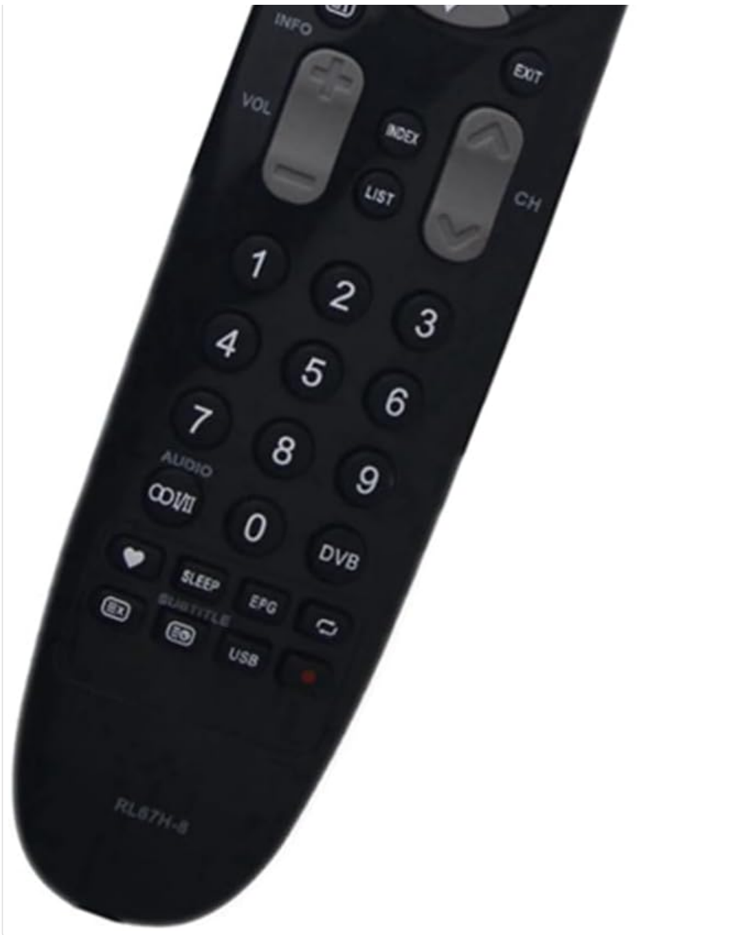
Figure 1: Front view of the Geuxe RL67H-8 TV Remote Control, showing all buttons and layout.