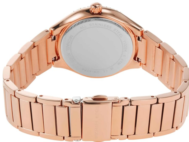
Image 4.1: Rear view of the watch, showing the case back where battery access is located.

The watch uses 1 product-specific battery (included). When the watch stops running or the hands move erratically, it indicates a low battery. Battery replacement should be performed by a qualified watch technician to ensure proper sealing and maintain water resistance.