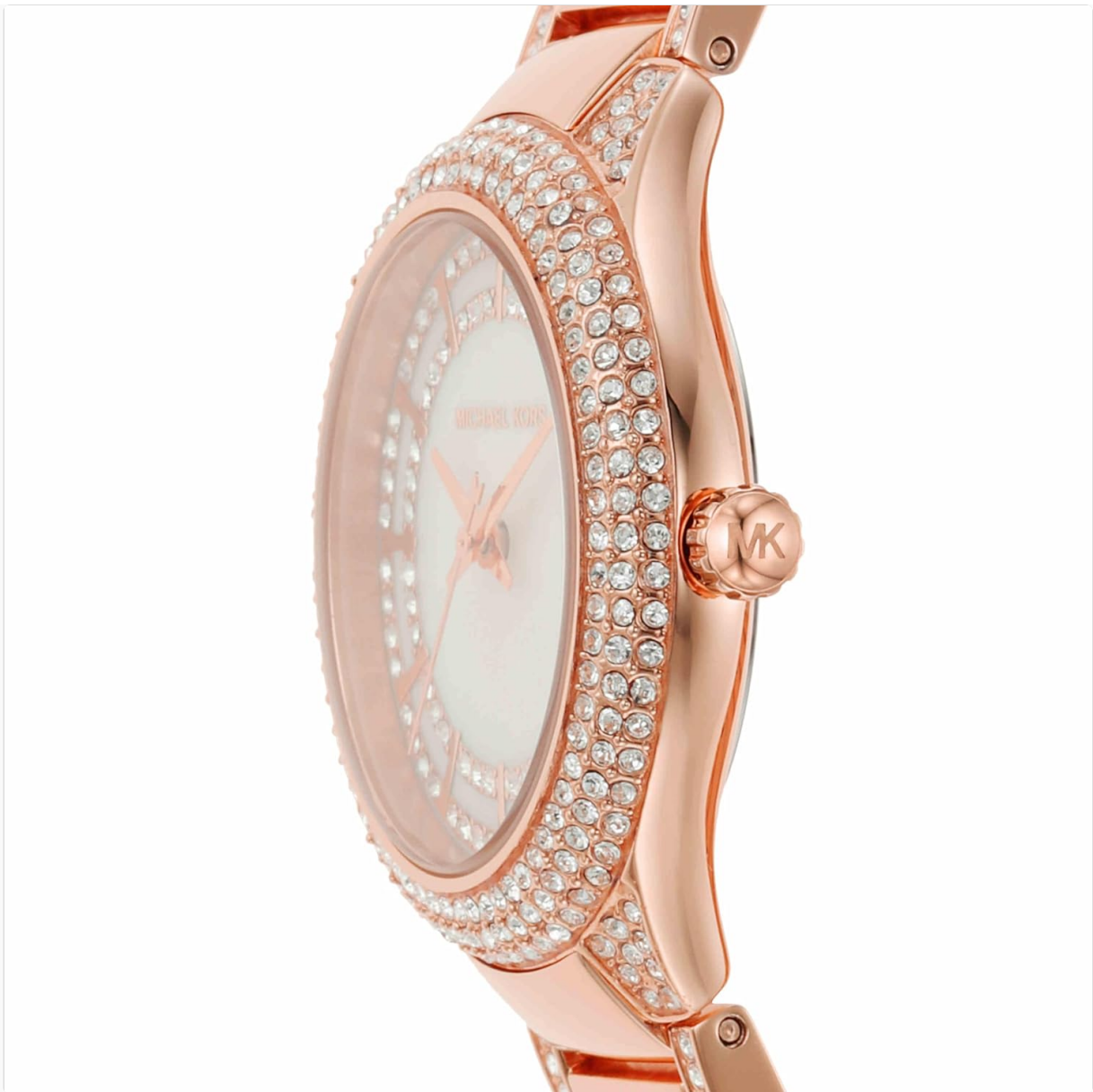
Image 2.1: Side view of the watch, highlighting the crown used for time adjustment.