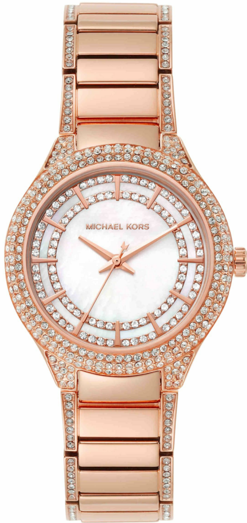
Image 1.1: Front view of the Michael Kors Sylvia Rose Gold Watch MK4656, showcasing the rose gold-tone finish and pavé crystal detailing.