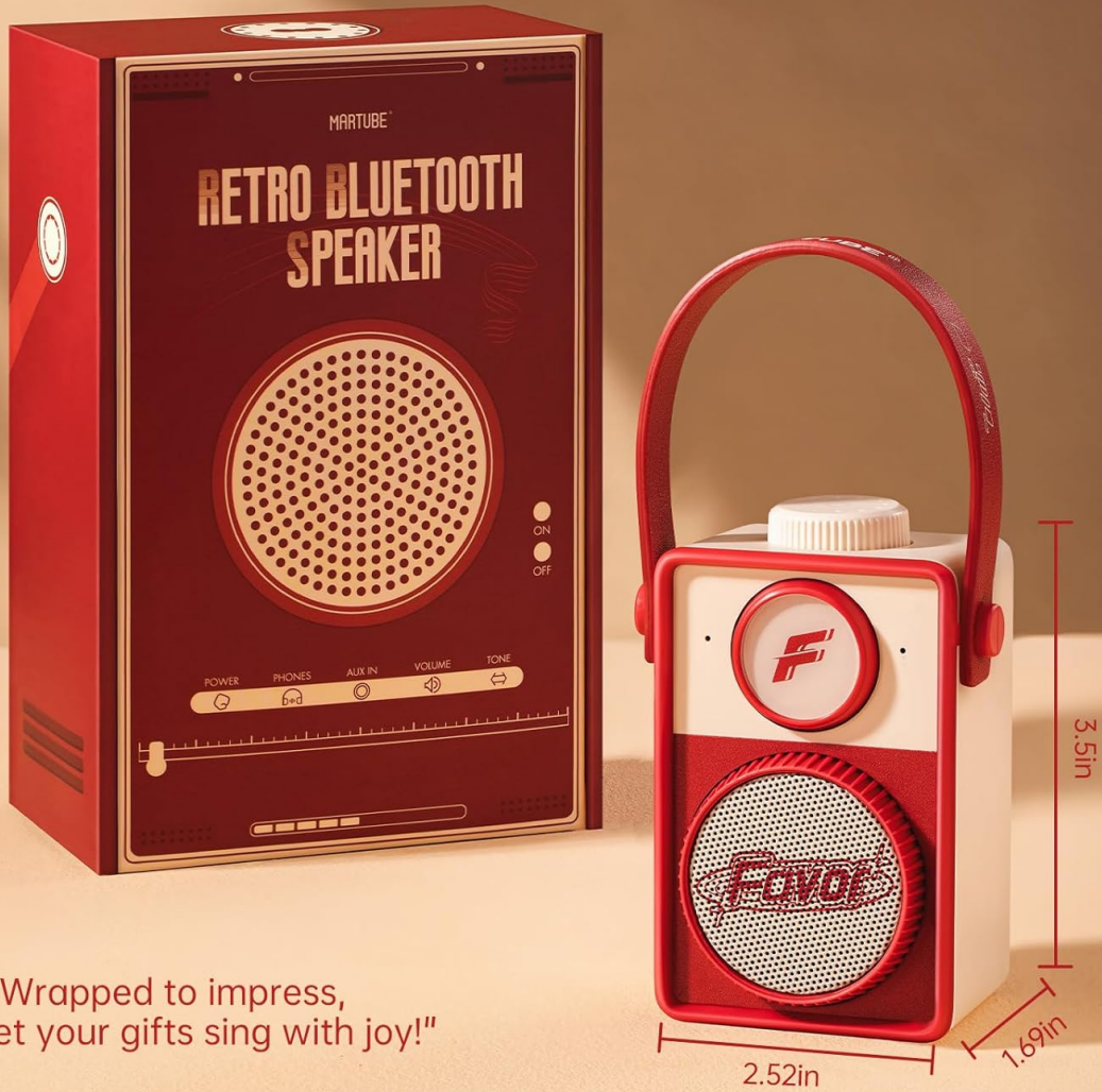
Image: The MARTUBE Retro Portable Bluetooth Speaker shown alongside its packaging, highlighting its compact size and gift-ready presentation.