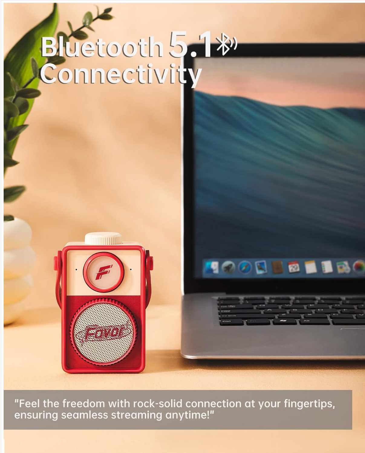
Image: The speaker demonstrates its Bluetooth 5.1 connectivity, shown paired with a laptop for seamless audio streaming.

Your browser does not support the video tag.