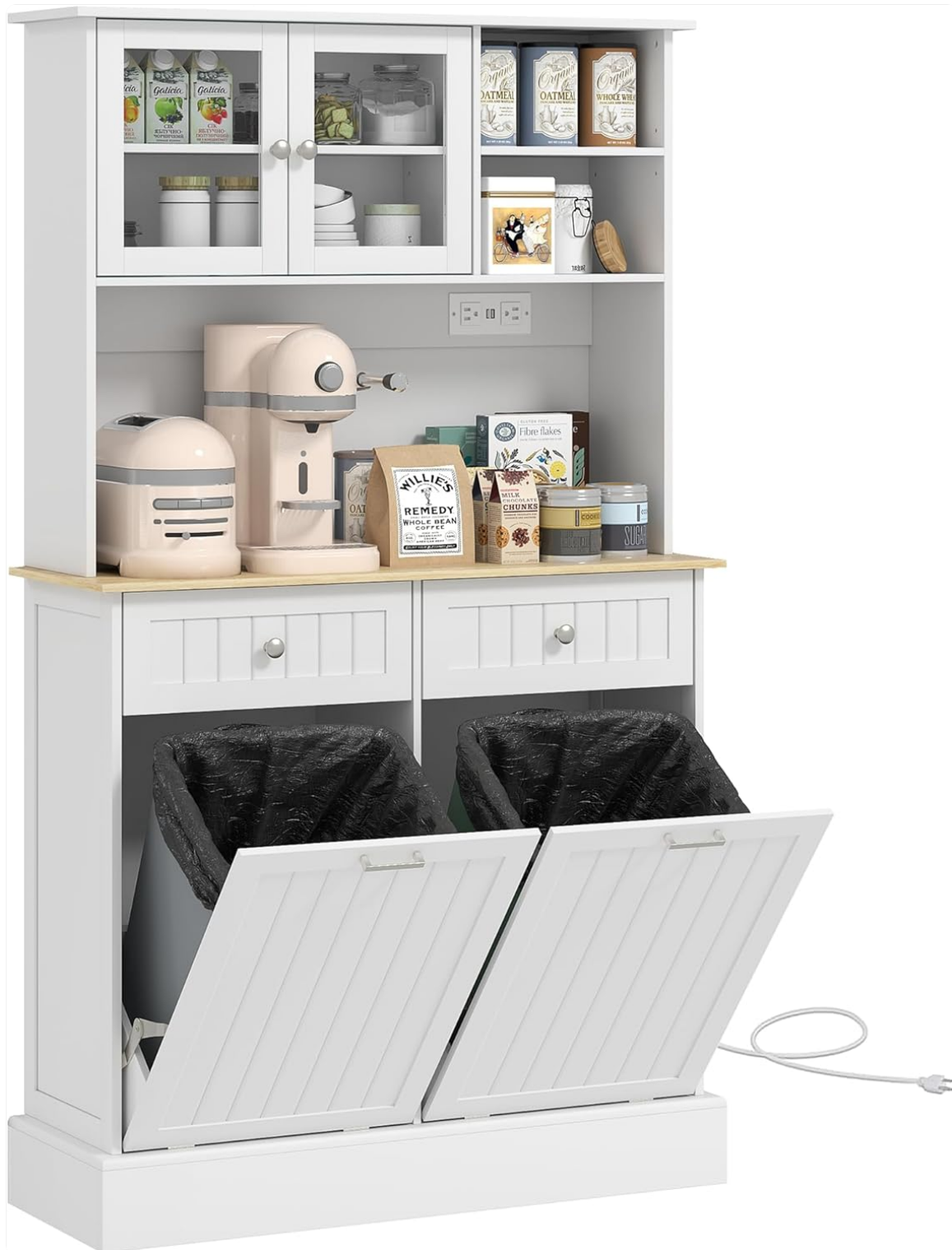
Figure 1.1: Front view of the HOMCOM Kitchen Pantry Storage Cabinet.