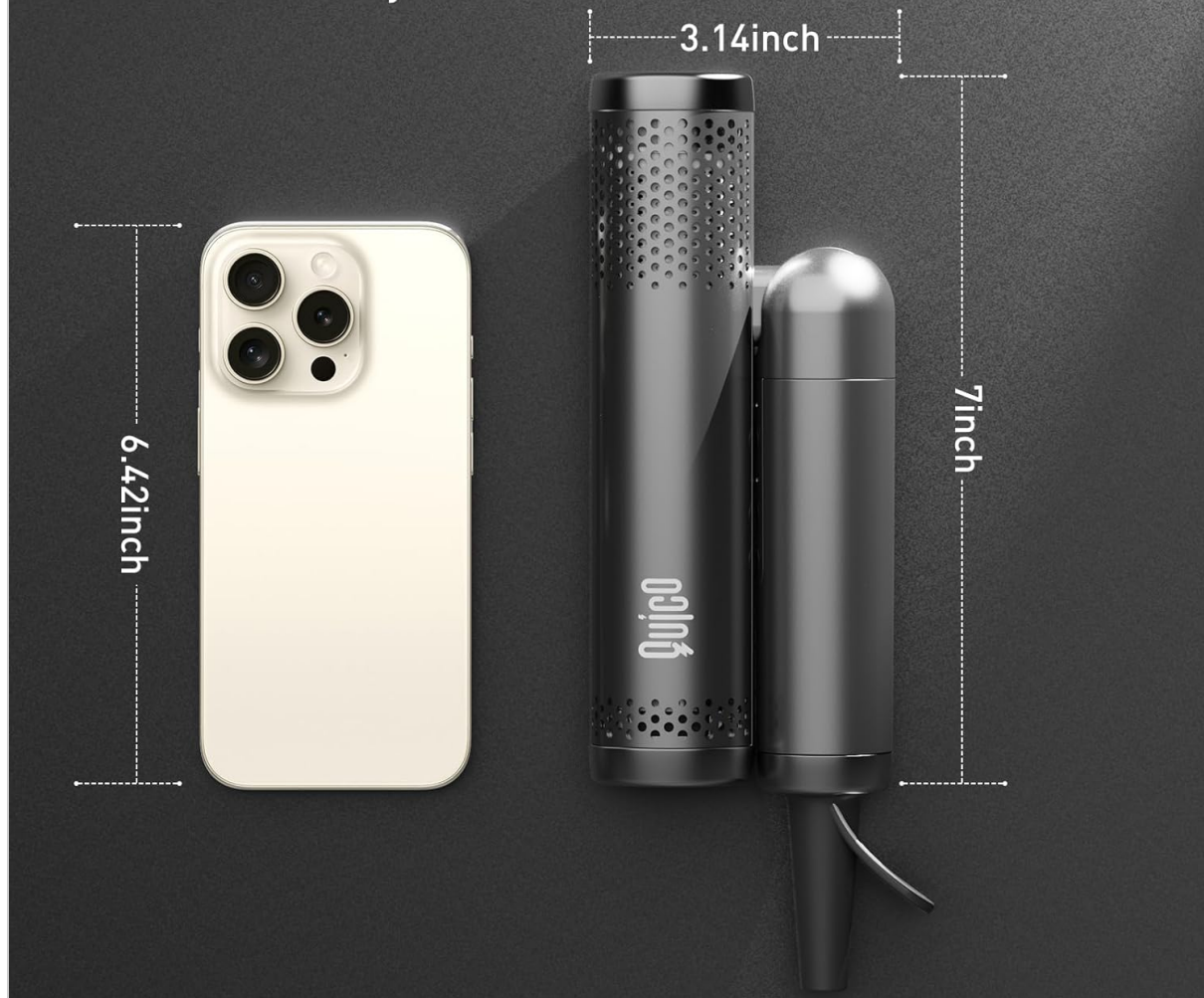
Figure 4: Foldable Design for Portability