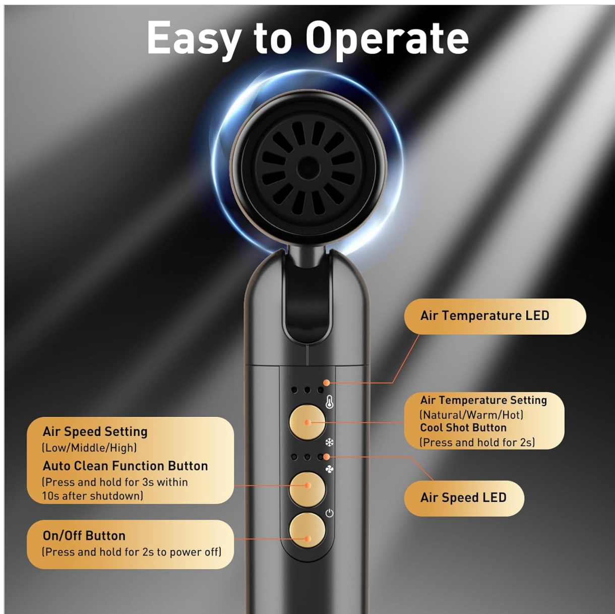
Figure 7: Control Panel Overview