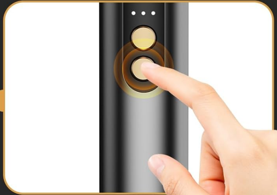
Figure 6: Magnetic Nozzle Attachment

Device OFF while plugged in, long press the Air Speed Button /Auto-Cleaning for about 3 seconds to start Auto Clean. It'll automatically shut down after cleaning for 5 seconds.