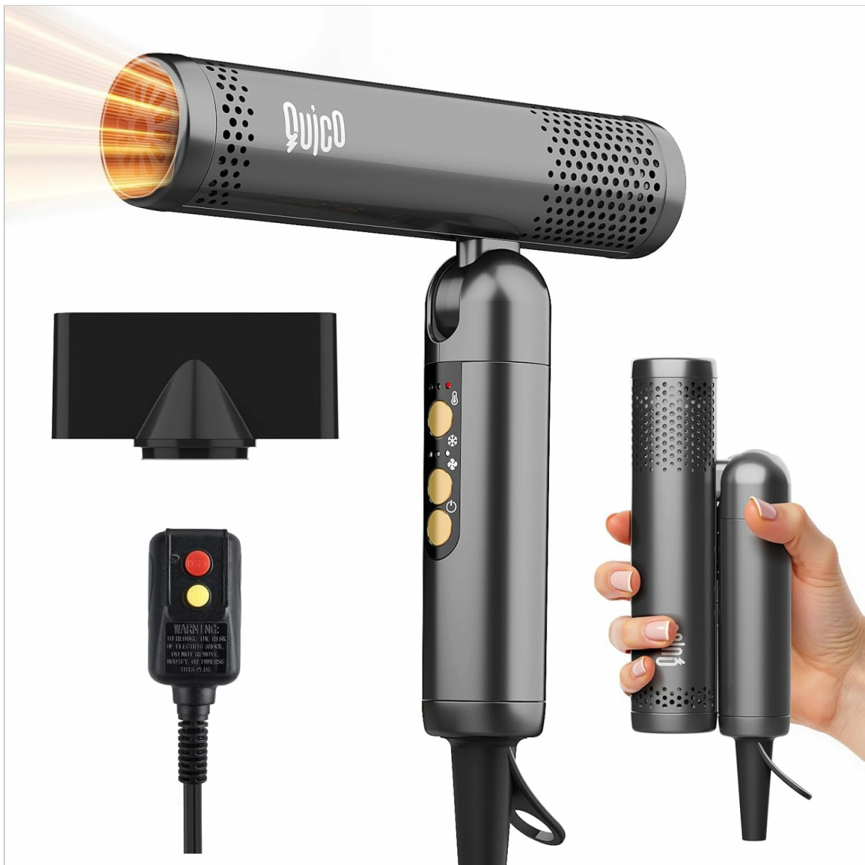
Figure 1: QUICO HC410 Travel Hair Dryer (Grey)