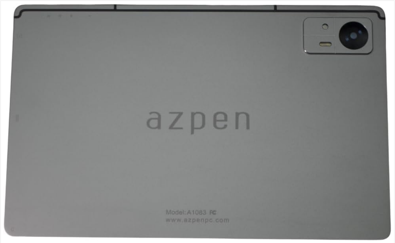
Image: The rear view of the Azpen A1083 tablet, clearly displaying the 'azpen' brand logo and 'Model: A1083' text. This image helps in identifying the specific model of the device.