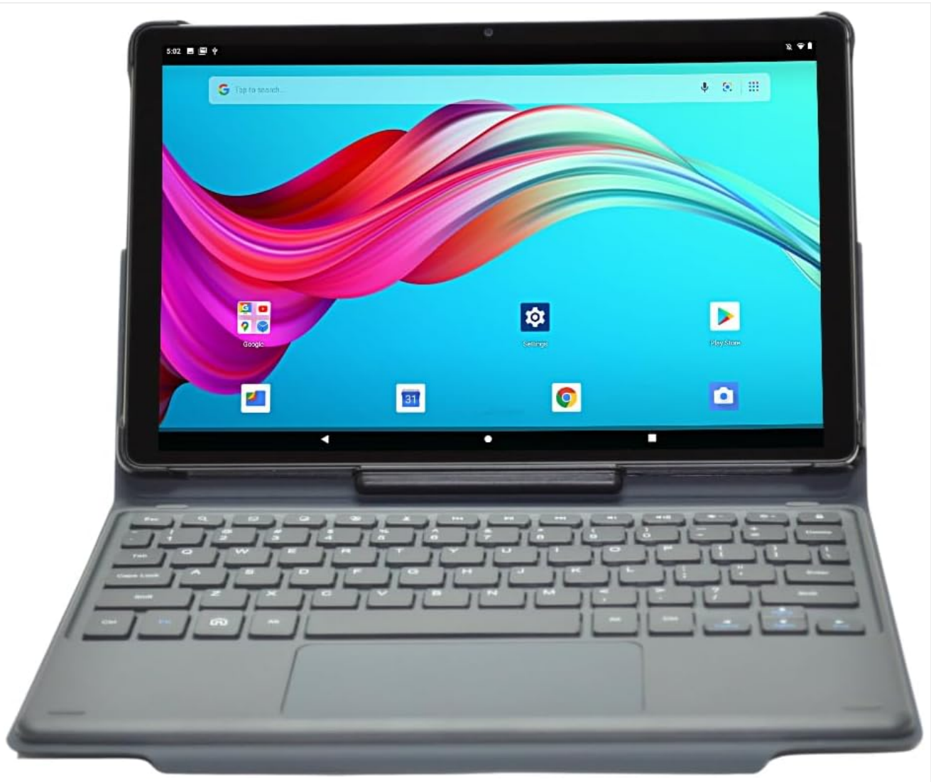
Image: The Azpen A1083 tablet securely attached to its Pogo Pin keyboard folio, displaying the Android home screen. This illustrates the tablet in its ready-to-use configuration.