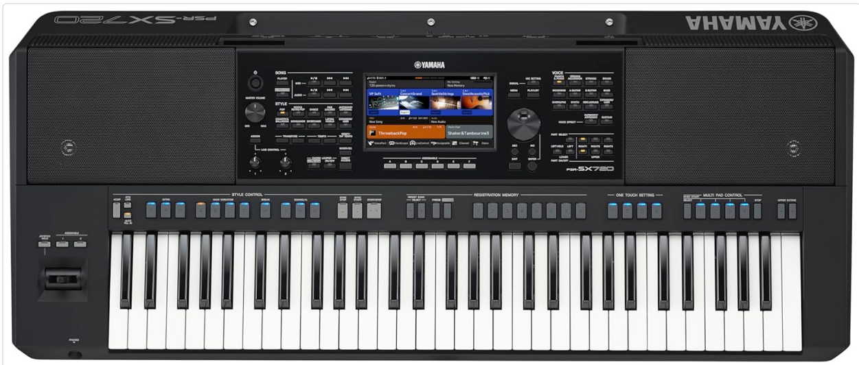
Figure 4.1: Top view of the PSR-SX720 keyboard, highlighting the layout of keys, screen, and controls.

The Yamaha PSR-SX720 is designed for both performance and composition, featuring a comprehensive control panel and a responsive keyboard.