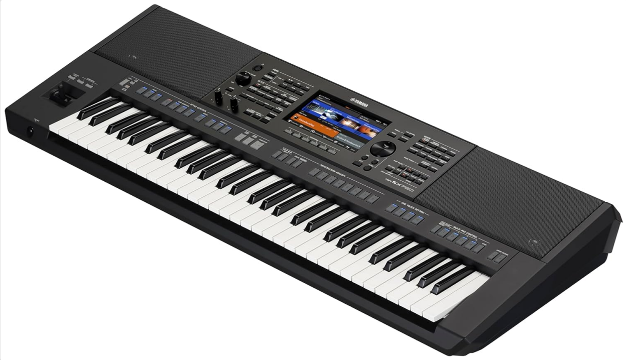
Figure 4.2: Angled view of the PSR-SX720, illustrating its compact yet powerful design.