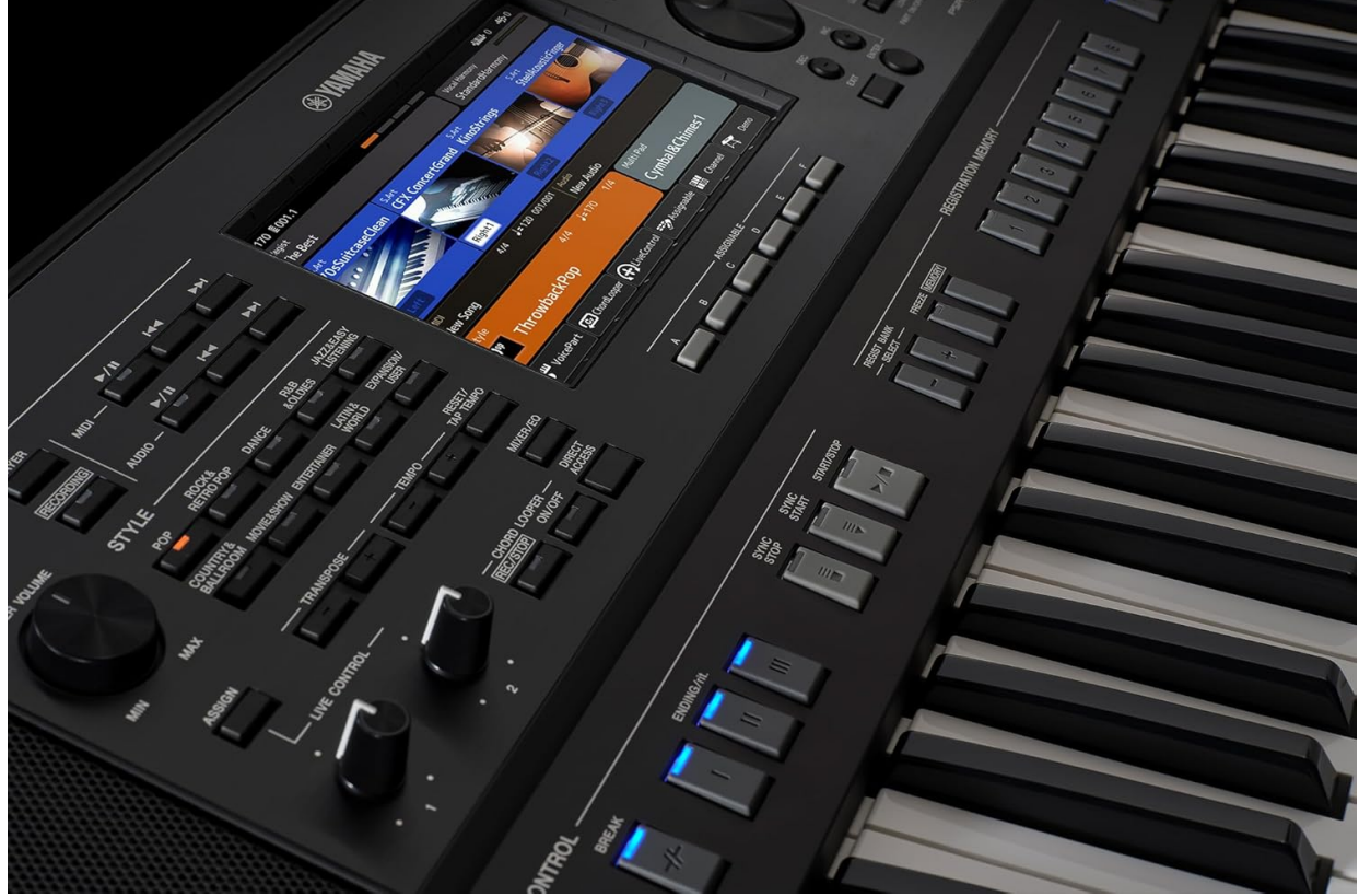
Figure 6.2: Detail of the Live Control knobs and Style Control section.