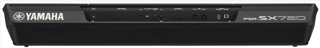
Figure 5.1: Rear panel connections of the PSR-SX720, including power, audio, and data ports.

The PSR-SX720 offers various connectivity options for audio input and output.