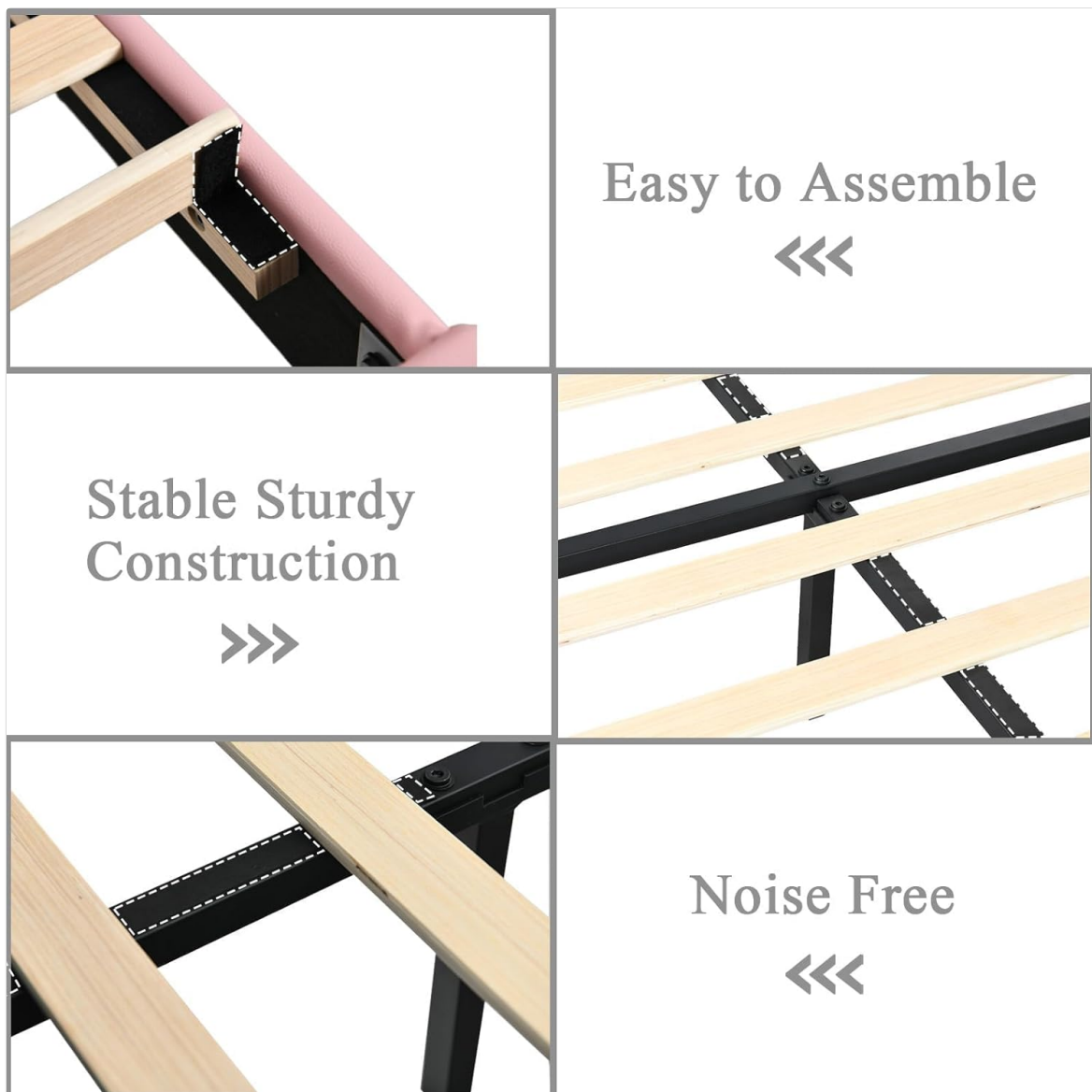
This image illustrates the easy assembly process, the stable and sturdy construction, and the noise-free design elements of the bed frame.