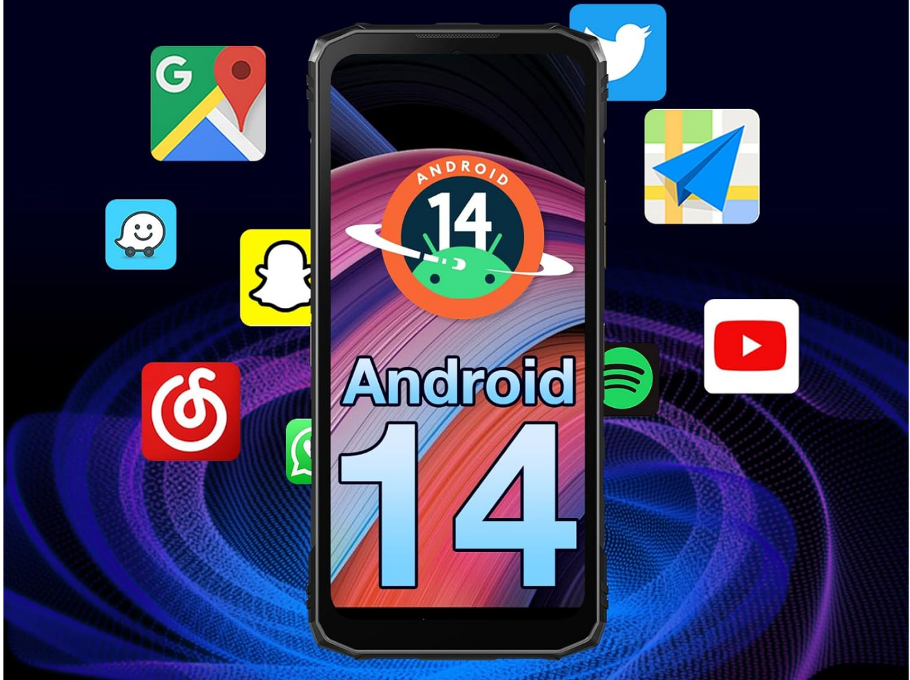
Figure 7: Visual showcasing the Android 14 operating system interface on the DOOGEE Blade 10 Ultra.