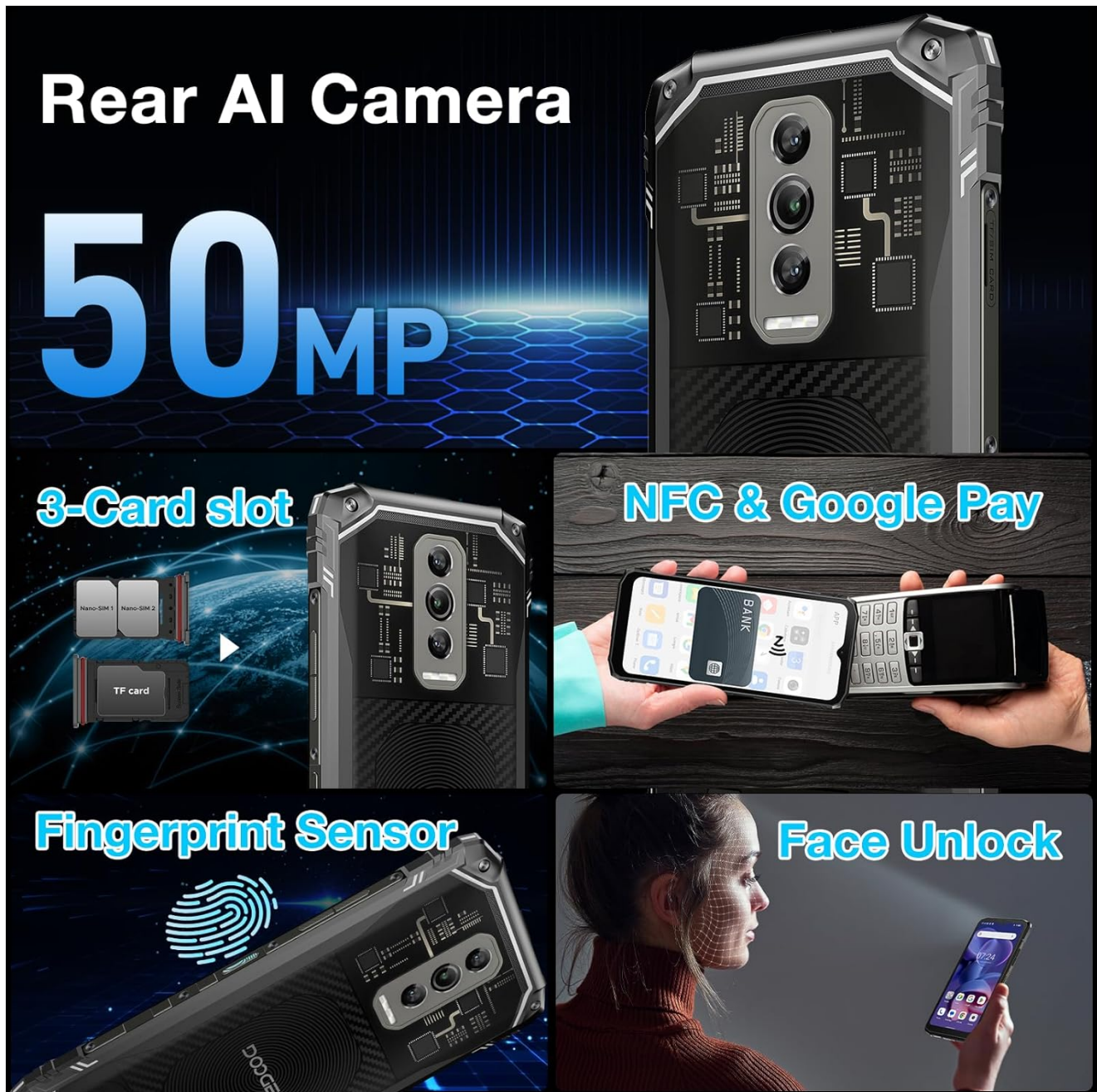
Figure 2: Diagram illustrating the insertion of dual Nano-SIM cards and a TF card into the phone's tray.

The DOOGEE Blade 10 Ultra supports dual 4G SIM cards and a TF (microSD) card for expandable storage. Locate the SIM tray on the side of the device. Use the provided SIM ejector tool to open the tray. Carefully place your Nano-SIM cards and TF card into their respective slots as indicated on the tray. Ensure the tray is fully inserted and flush with the phone's body to maintain water and dust resistance.