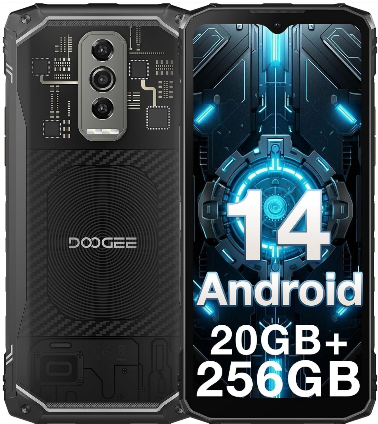
Figure 1: Front and back view of the DOOGEE Blade 10 Ultra, showcasing its sleek design and rear camera module.