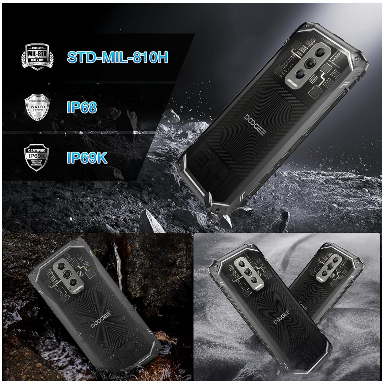
Figure 6: Icons representing MIL-STD-810H, IP68, and IP69K certifications, indicating the phone's robust design.