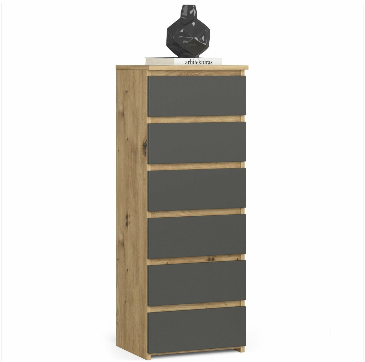
Image 1.1: The AKORD CL6 6-Drawer Commode, showcasing its design and potential placement in a living area. The commode features a light oak finish with graphite grey drawer fronts, complementing modern and classic interiors.