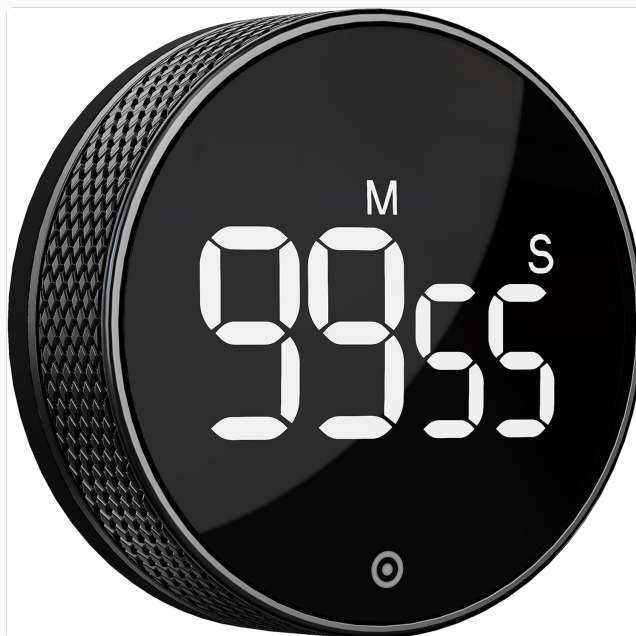
Figure 1: BlueSnail LED Digital Productivity Timer.

This manual provides detailed instructions for the BlueSnail LED Digital Productivity Timer, Model BS-8124. This versatile timer is designed for various applications, including kitchen use, classroom activities, gym workouts, and office tasks, to enhance time management and productivity.