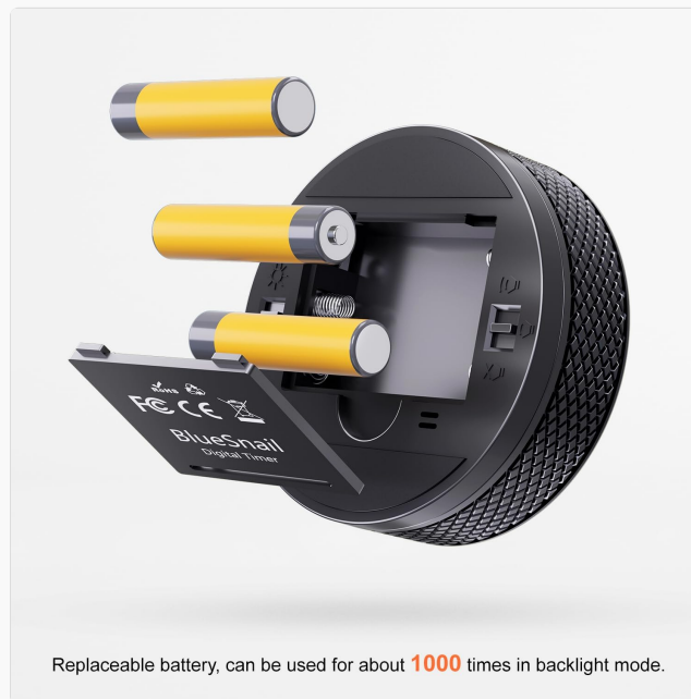
Figure 2: Battery installation for the BlueSnail LED Digital Productivity Timer.