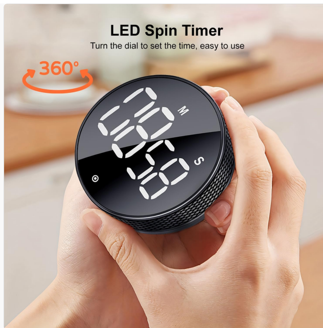
Figure 3: Adjusting time by rotating the outer ring.