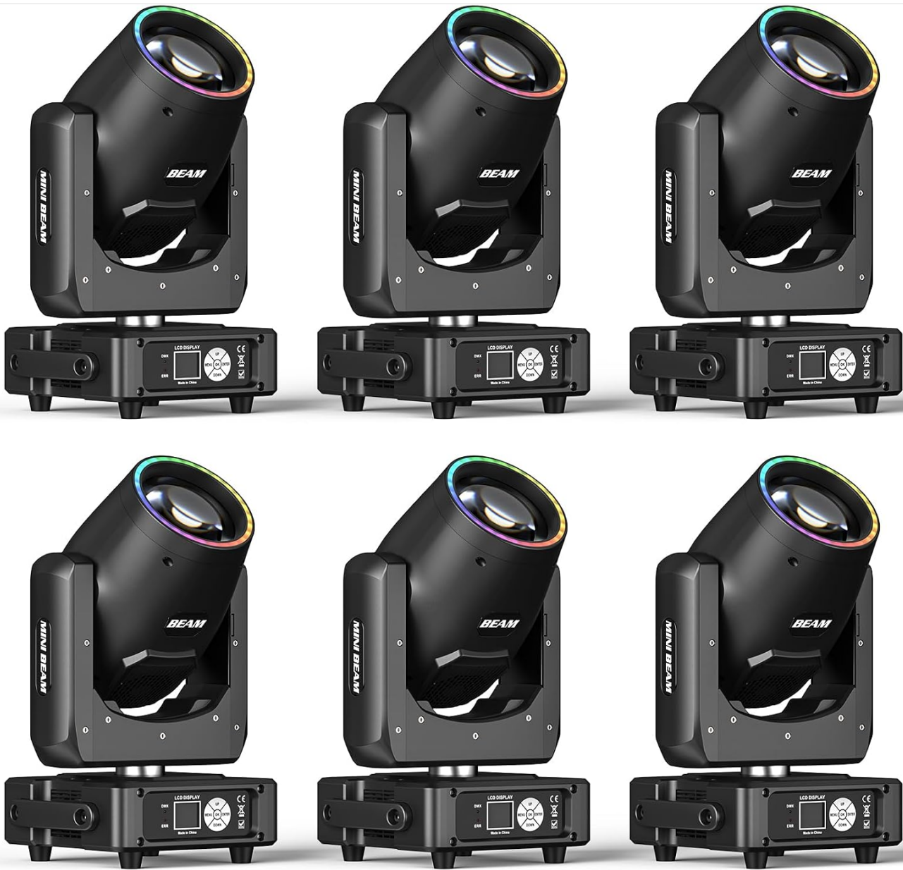
Figure 2.1: Contents of the Xelleye 230W Eternalblade Stage Lights package (6-pack shown).