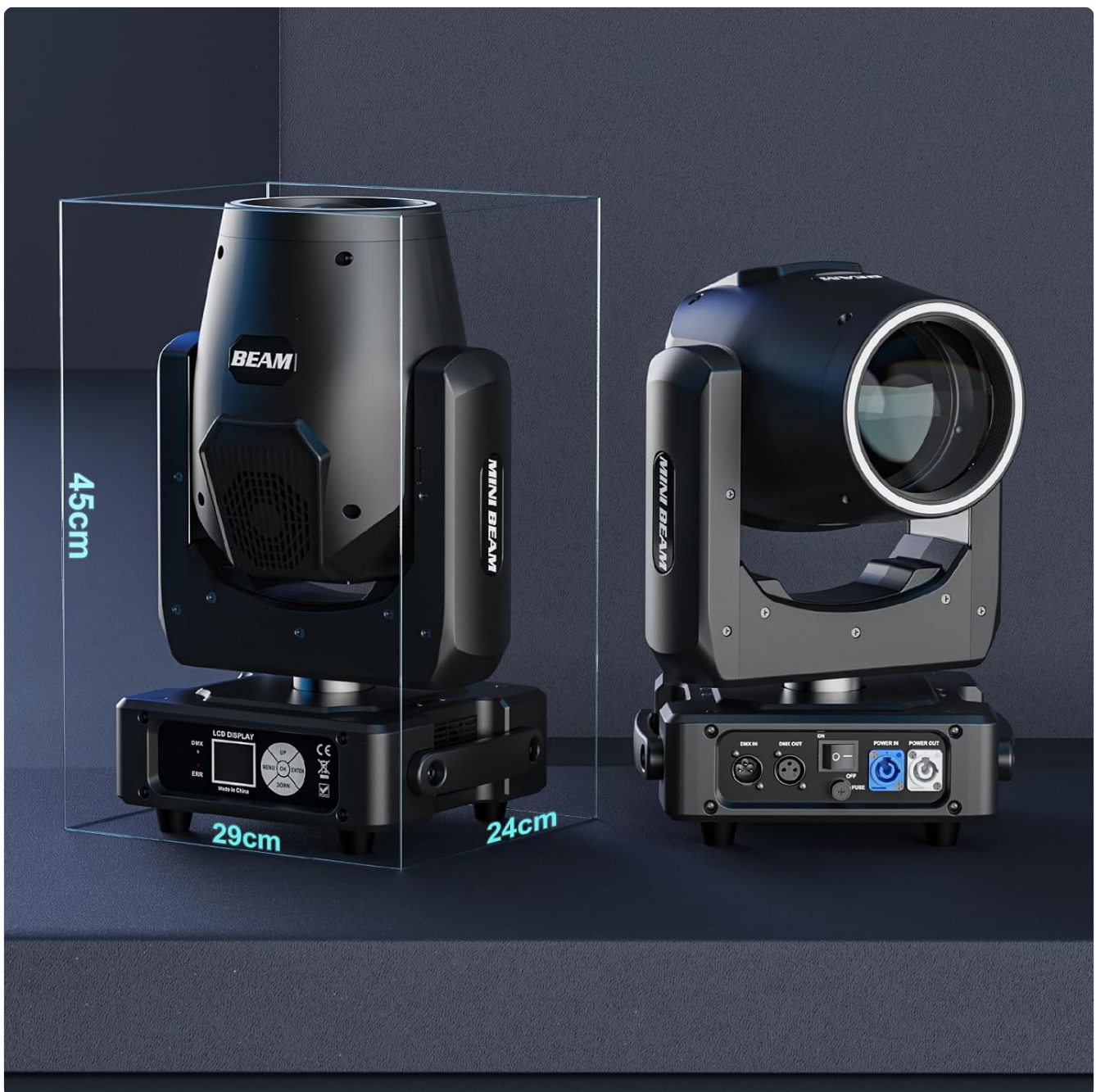
Figure 3.1: Product Dimensions.