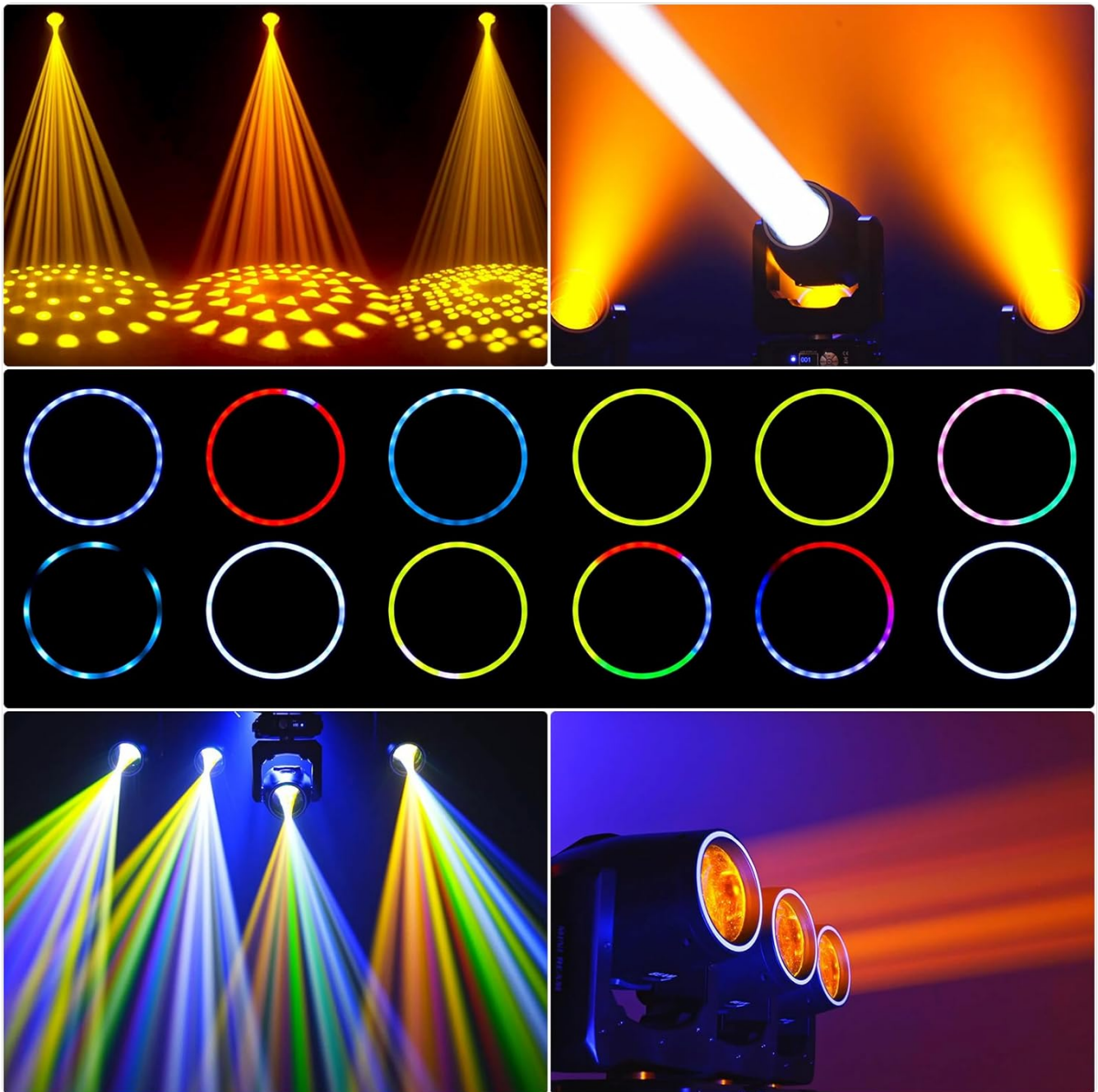
Figure 5.3: Examples of Light Effects.