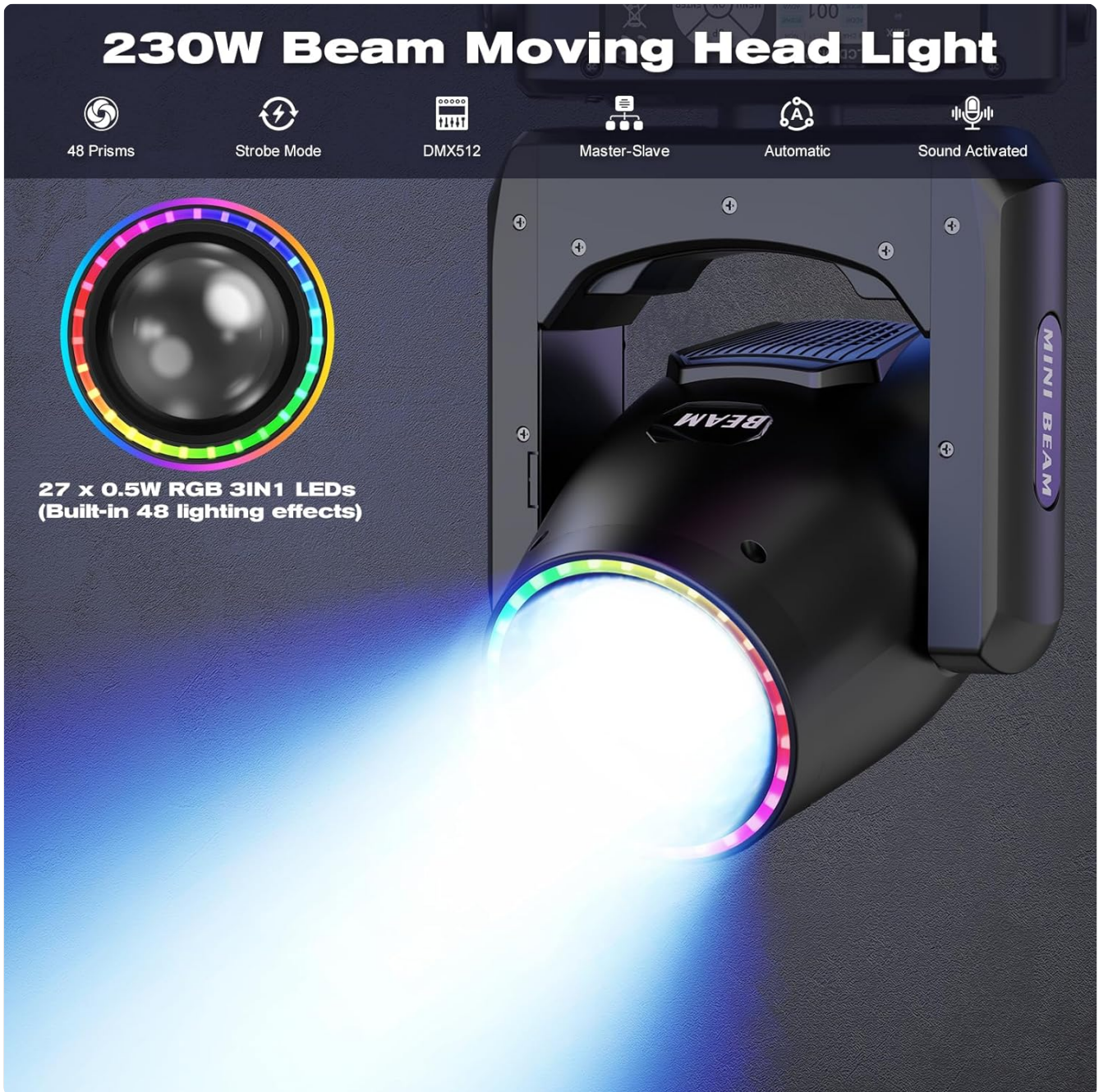
Figure 5.1: Key Features and Control Options.