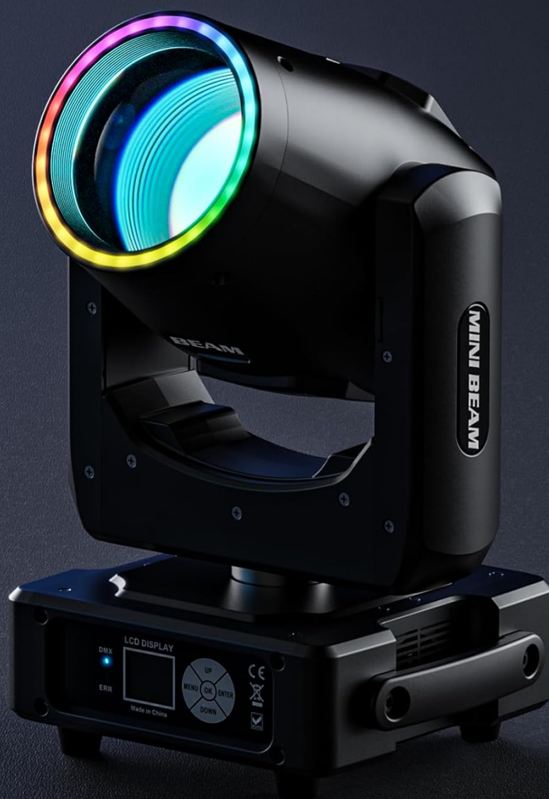
Figure 5.2: Color and Gobo Options.