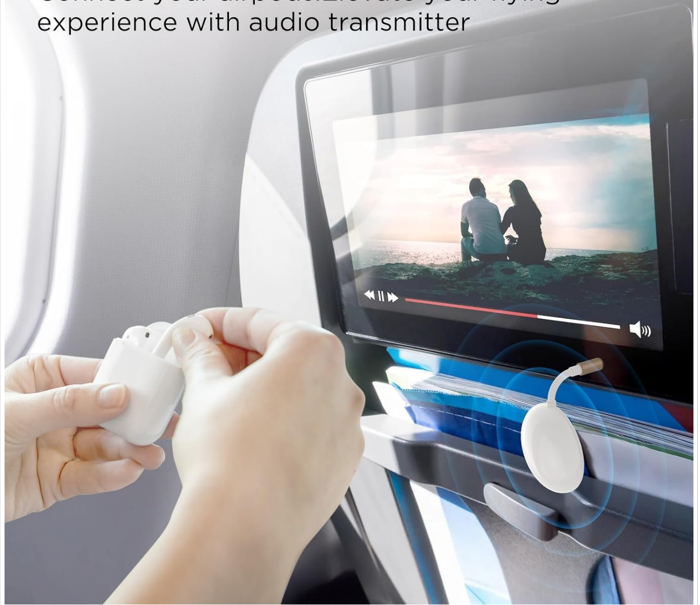
Image: Enjoy Music at 30,000 Feet - A user connecting their AirPods to an airplane's entertainment screen via the transmitter.

Connect your airpods. Elevate your flying experience with audio transmitter