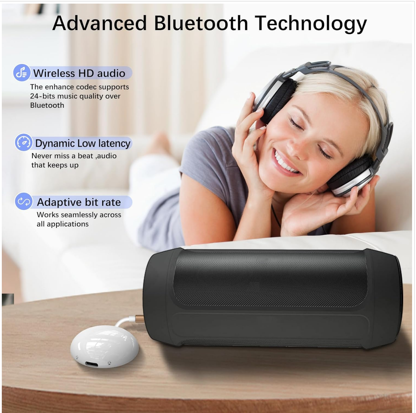
Image: Advanced Bluetooth Technology - A woman enjoying wireless HD audio with dynamic low latency and adaptive bit rate, demonstrating the transmitter's high-performance capabilities.

Works seamlessly across all applications