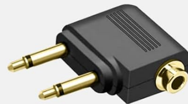
Dual 3.5mm Adapter