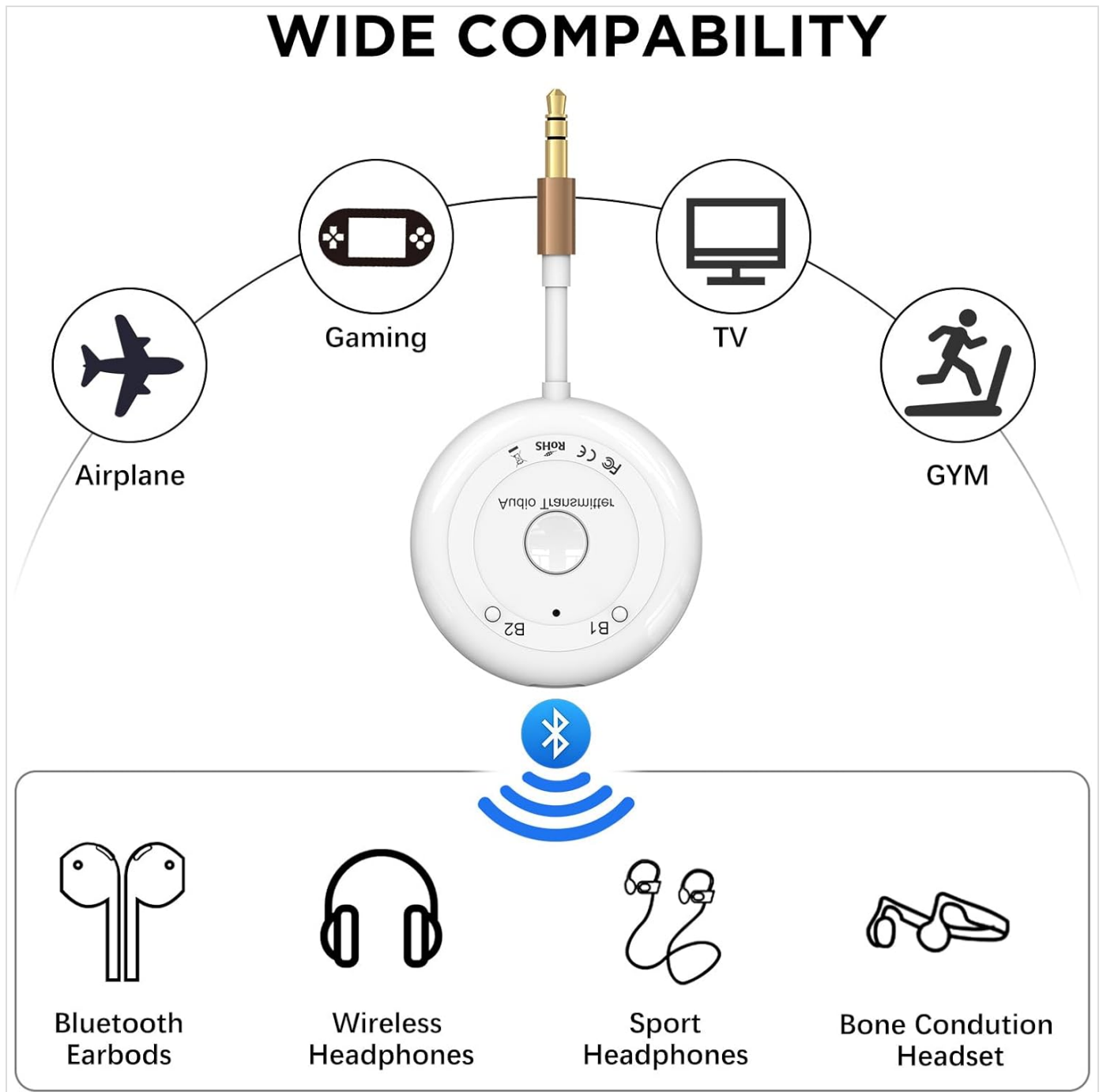
Image: Wide Compatibility - Illustrates the transmitter's use with airplanes, gaming devices, TVs, and gym equipment, and its compatibility with Bluetooth earbuds, wireless headphones, sport headphones, and bone conduction headsets.