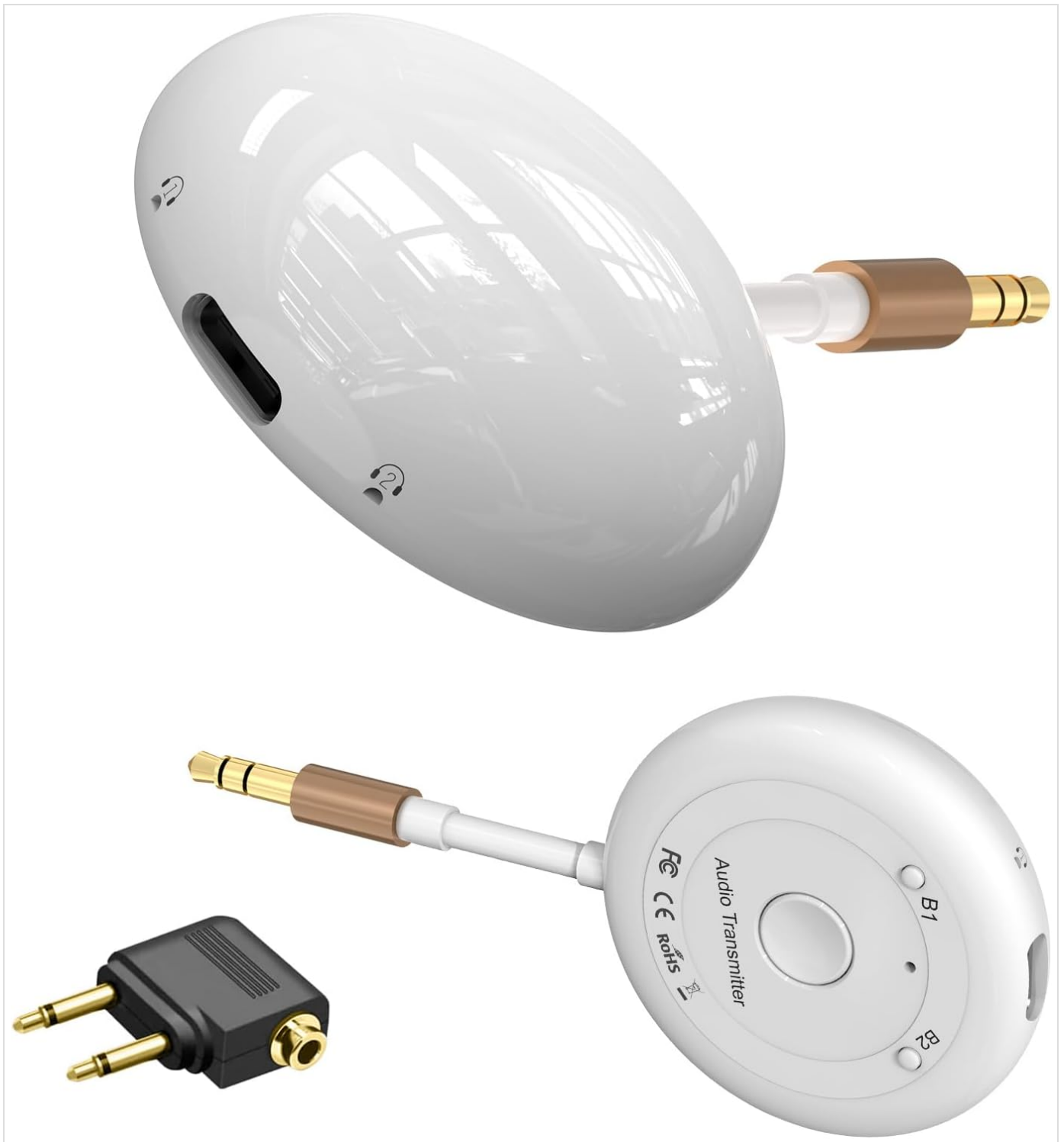
Image: The Black Horse Bluetooth 5.3 Audio Transmitter, showcasing its compact design, integrated 3.5mm AUX plug, and an included dual-pin airplane adapter.