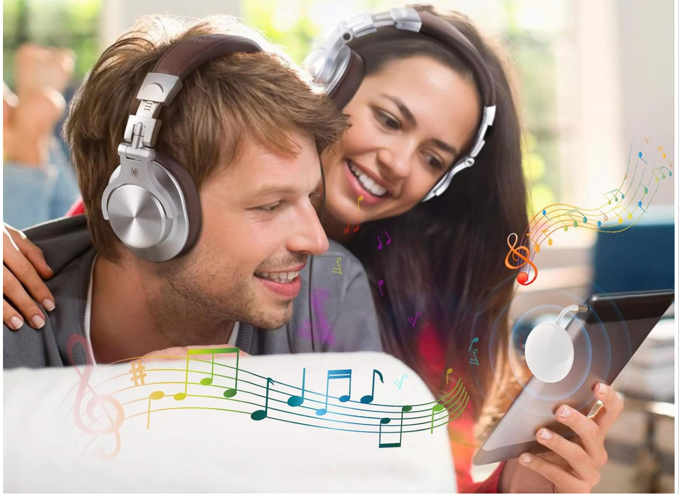
Image: Dual Wireless Connection - A couple enjoying music together using two pairs of headphones connected to a single transmitter.