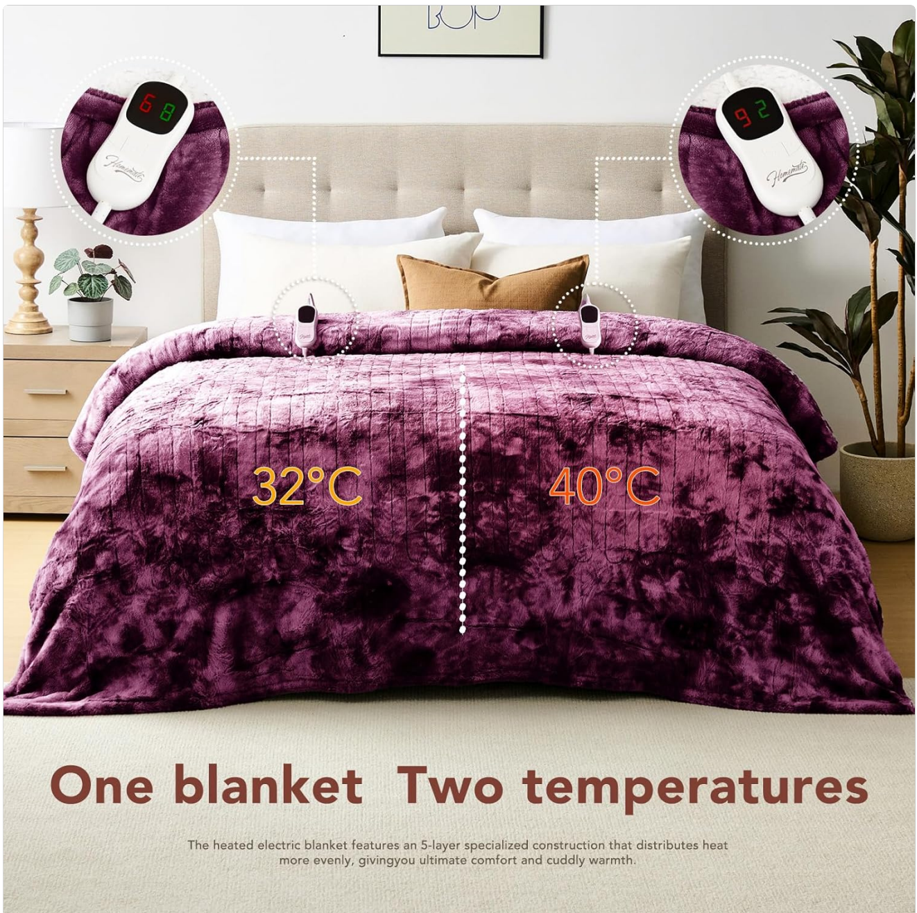
Image: A Queen size blanket demonstrating dual temperature control, allowing two different heat settings on each side.