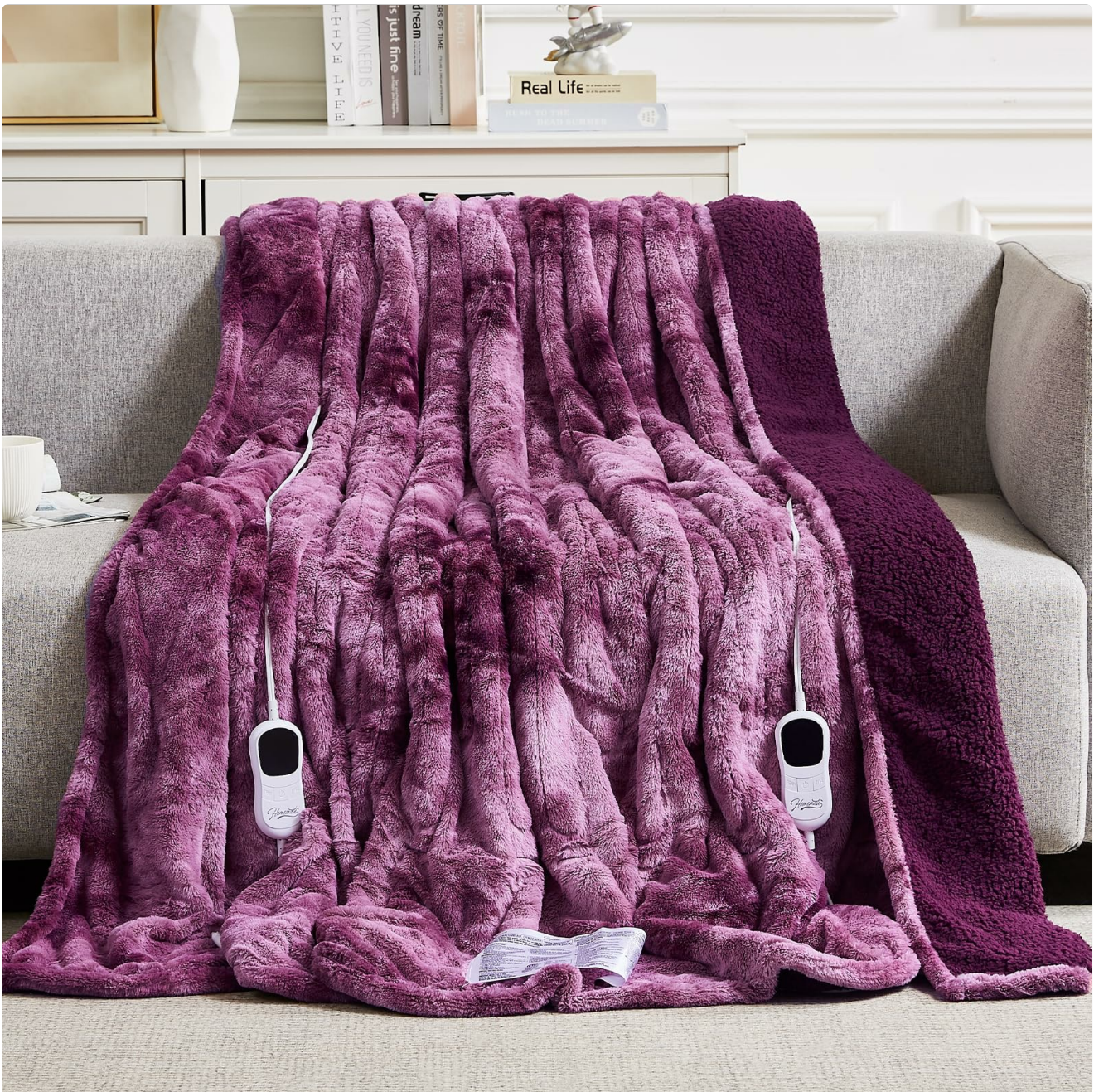
Image: The Homemate Electric Heated Blanket in Queen Size, Purple color, showcasing its soft texture.

Your browser does not support the video tag.