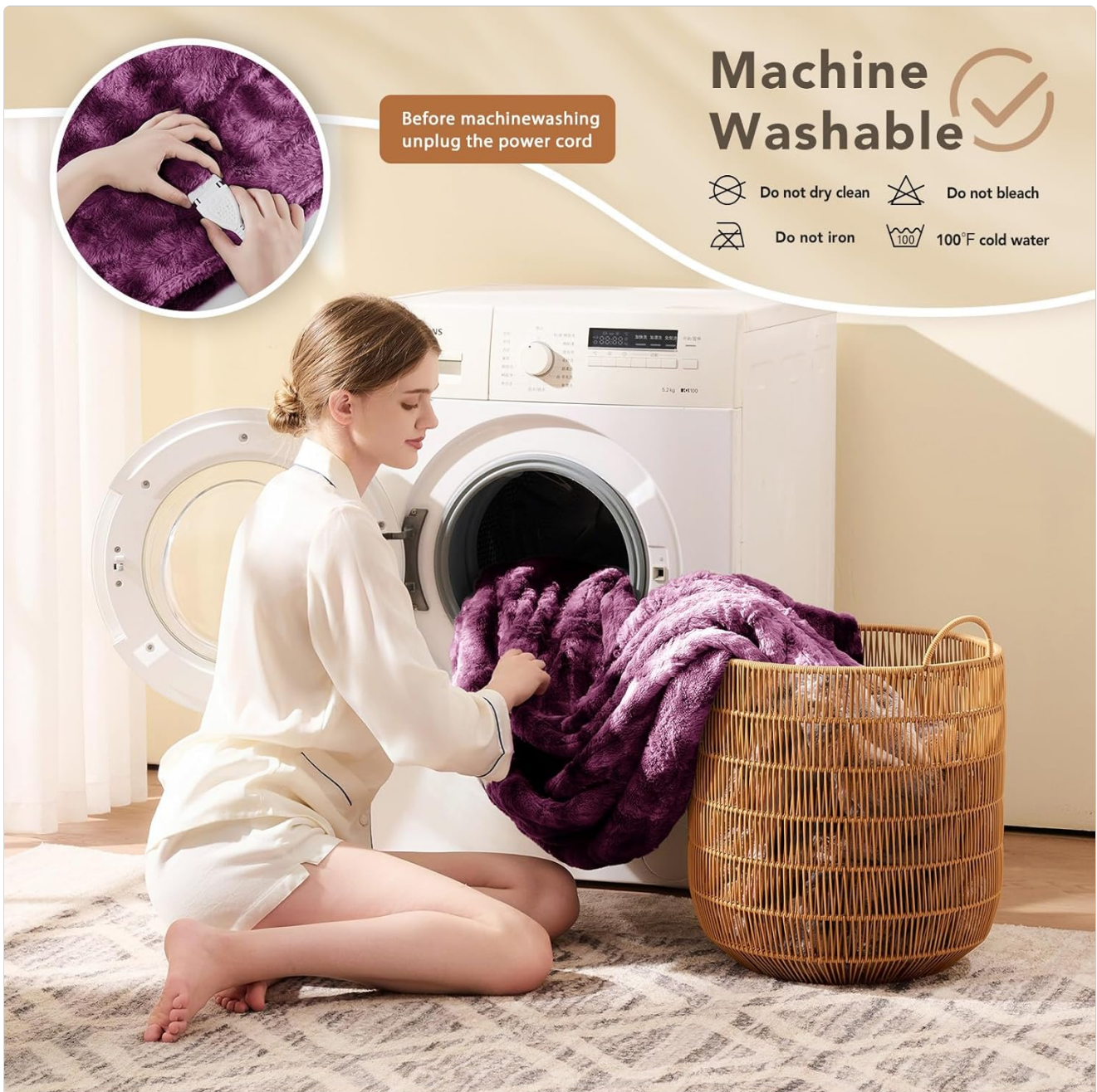
Image: Visual guide for machine washing the heated blanket, emphasizing unplugging the power cord before washing and care symbols (do not dry clean, do not bleach, do not iron, 100°F cold water).