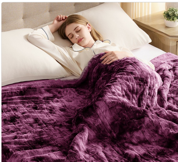
Image: Close-up view of the blanket's soft faux fur and sherpa material, highlighting its texture.