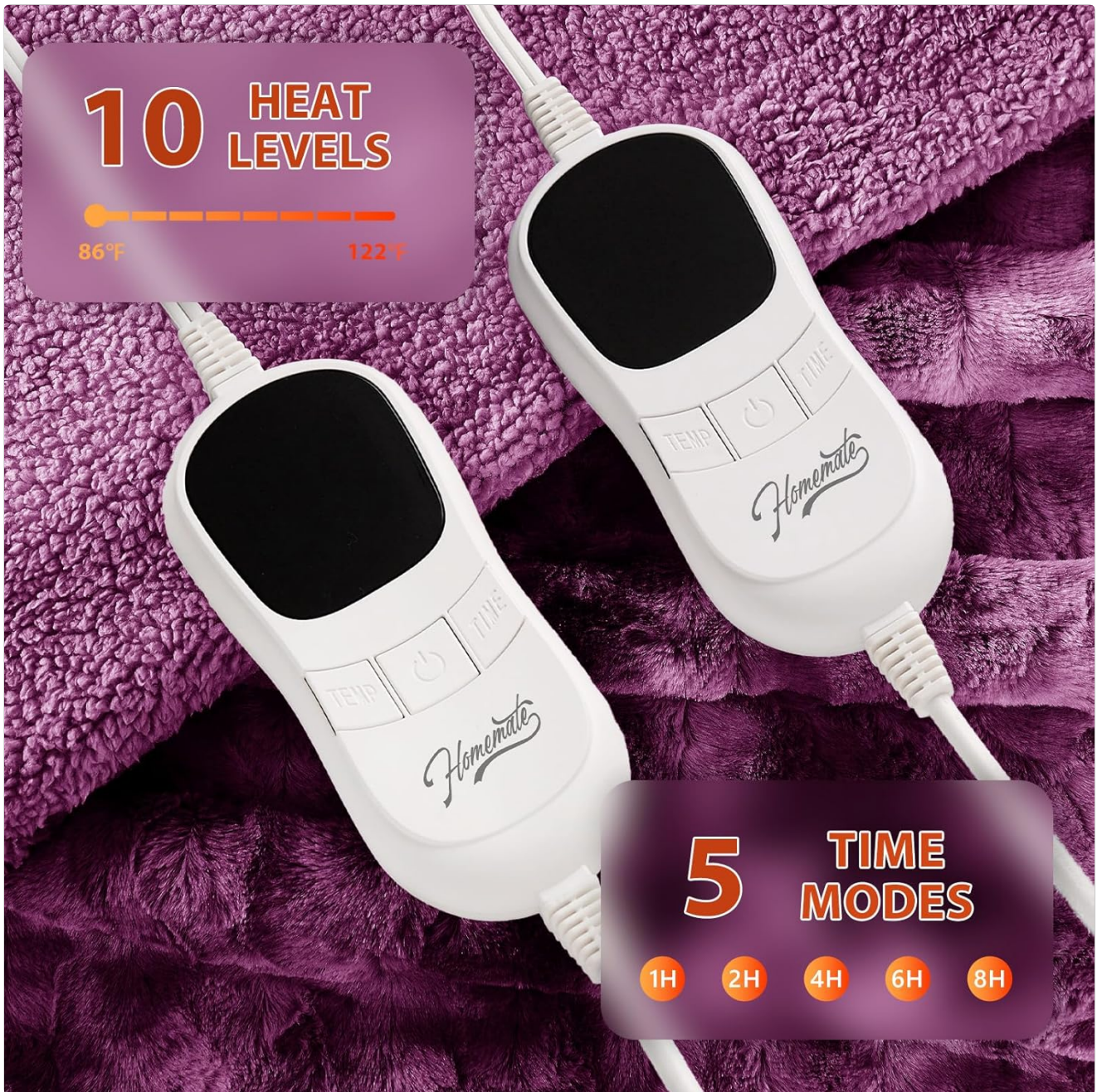
Image: Close-up of the blanket's controller, displaying options for 10 heat levels and 1/2/4/6/8 hour auto-off timer settings.