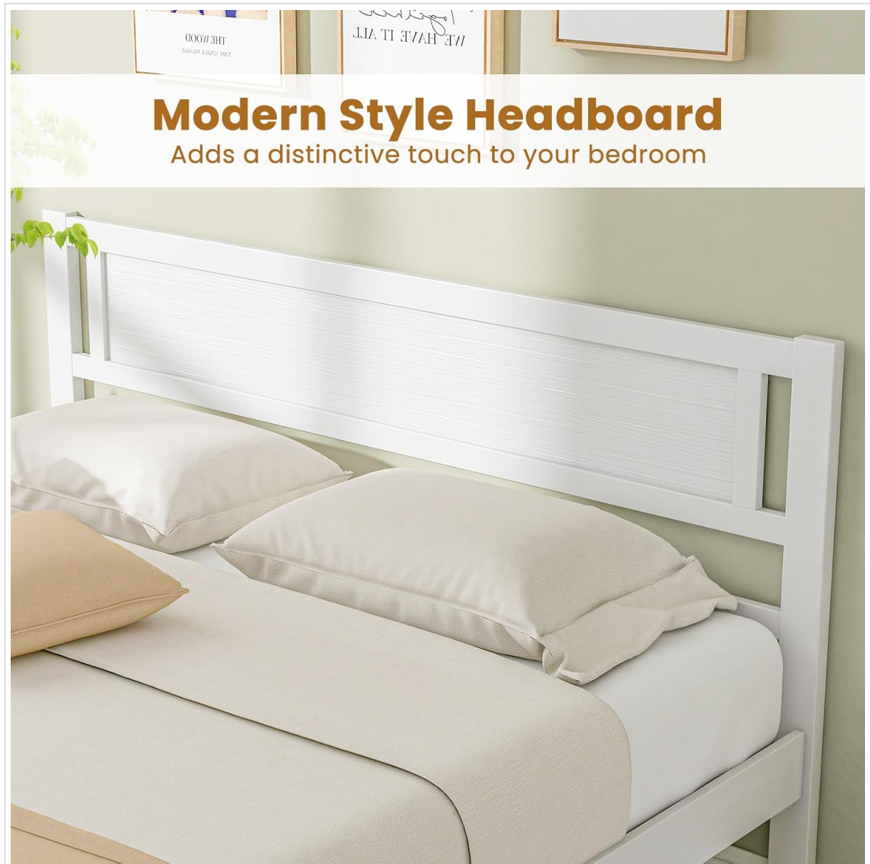
Image: Detail of the modern headboard design.