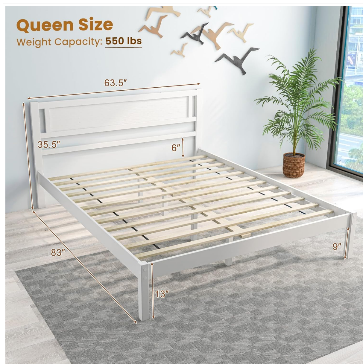
Image: Detailed dimensions of the bed frame, including length, width, height, and under-bed clearance.