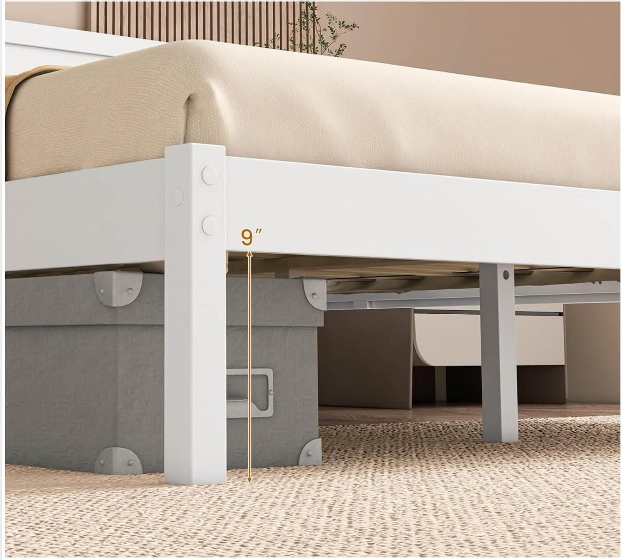
Image: Demonstration of the 9-inch under-bed storage clearance.