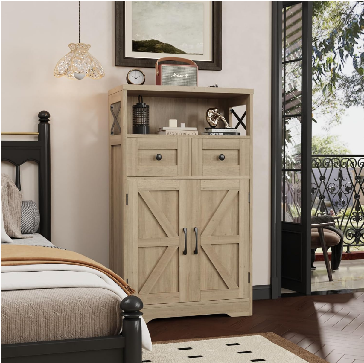
Figure 4: Detailed features including adjustable shelf and metal handles.