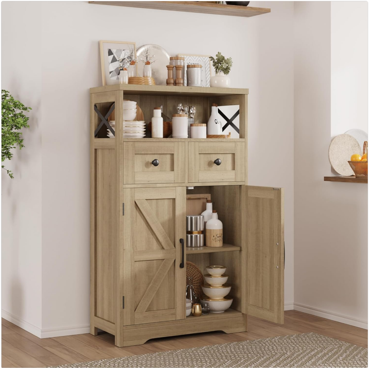
Figure 2: Cabinet with doors open, showing the adjustable shelf.