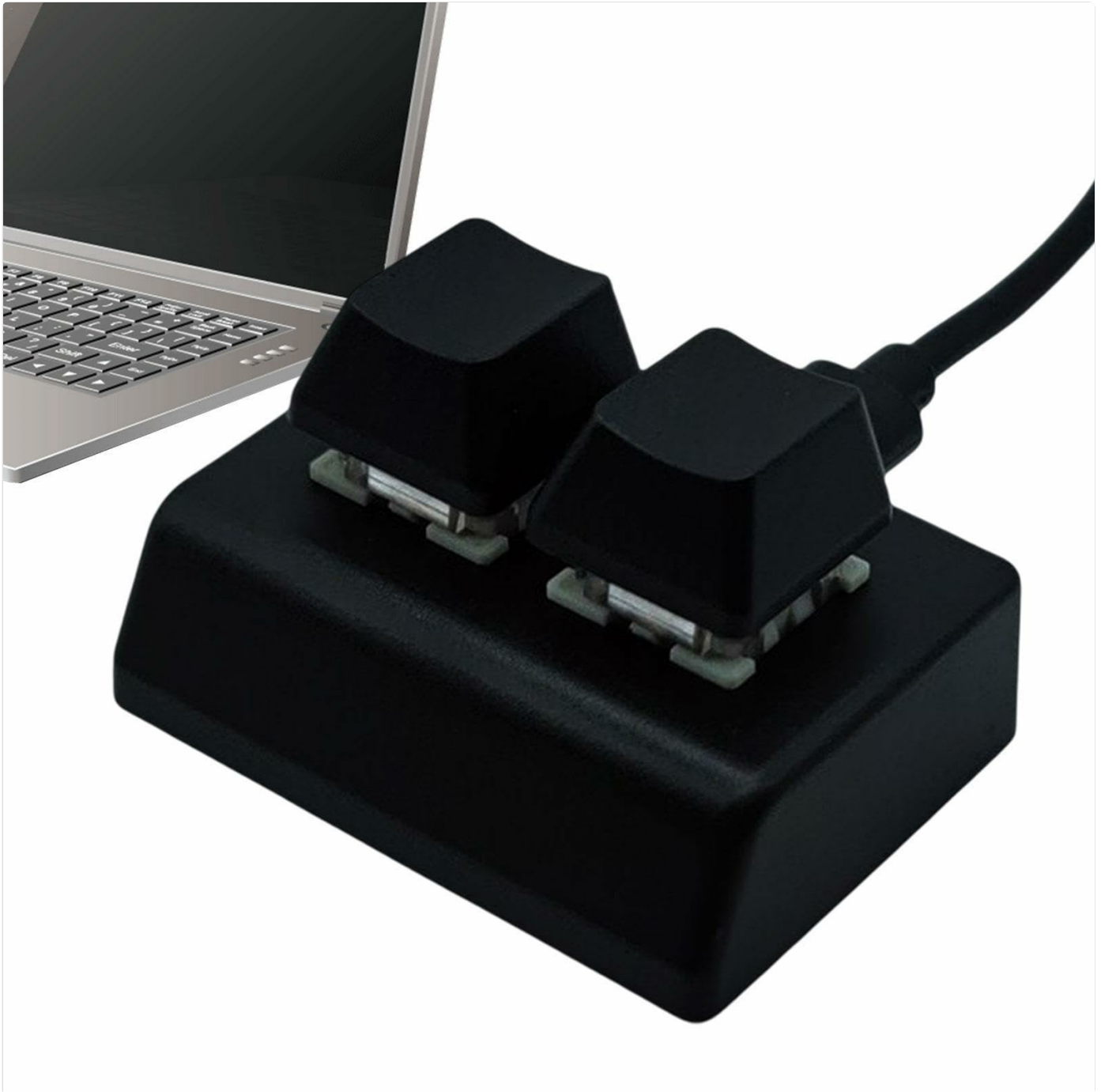
Image: A user operating the 2-key mechanical keyboard, demonstrating its integration into a typical computer setup.

Note: Specific software or a web-based tool is usually required for programming custom key functions. Please refer to the manufacturer's website or included documentation for detailed instructions on how to access and use the programming utility.