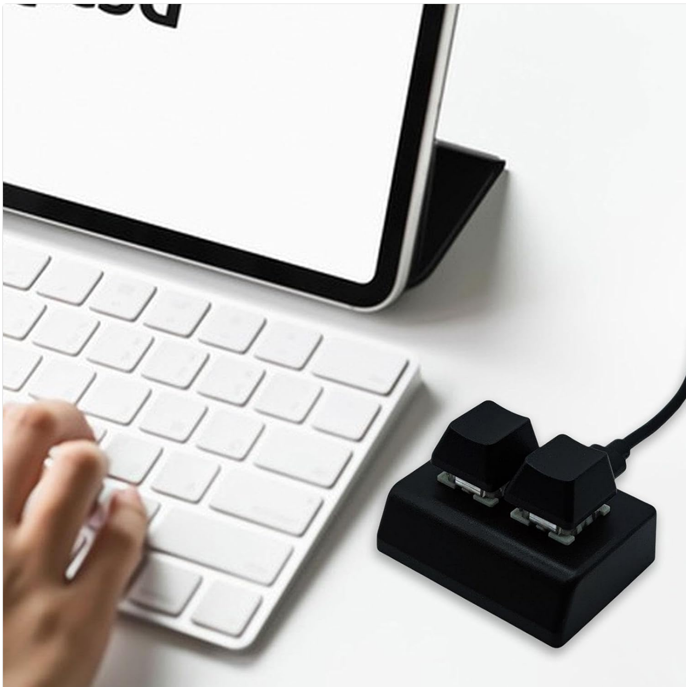
Image: The 2-key mechanical keyboard positioned next to a laptop, illustrating its compact size and readiness for use.