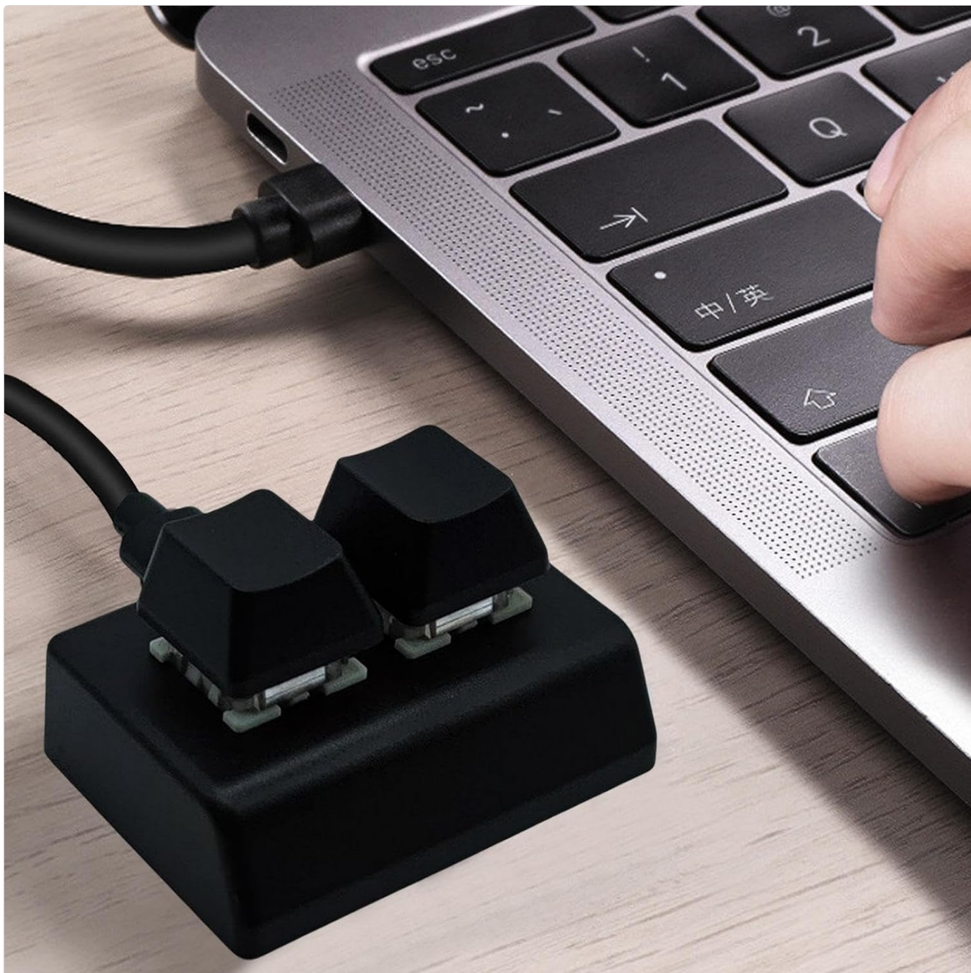
Image: The 2-key mechanical keyboard connected to a laptop via its USB cable, demonstrating its compact size and connectivity.