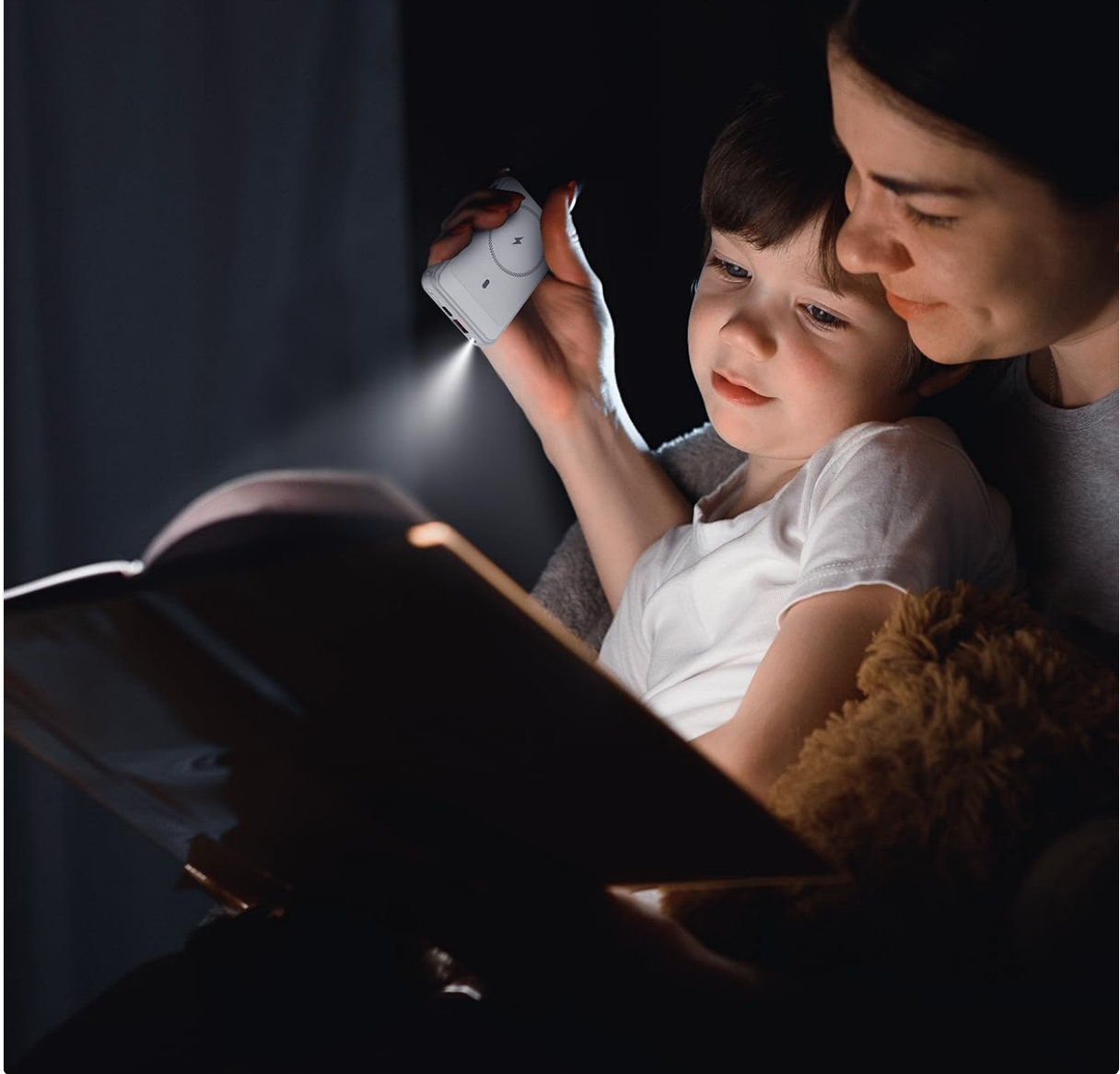
Image: A person holding the power bank with its LED flashlight illuminated, providing light in a dark setting, useful for emergencies or reading.

The strong magnetic connection holds your phone securely