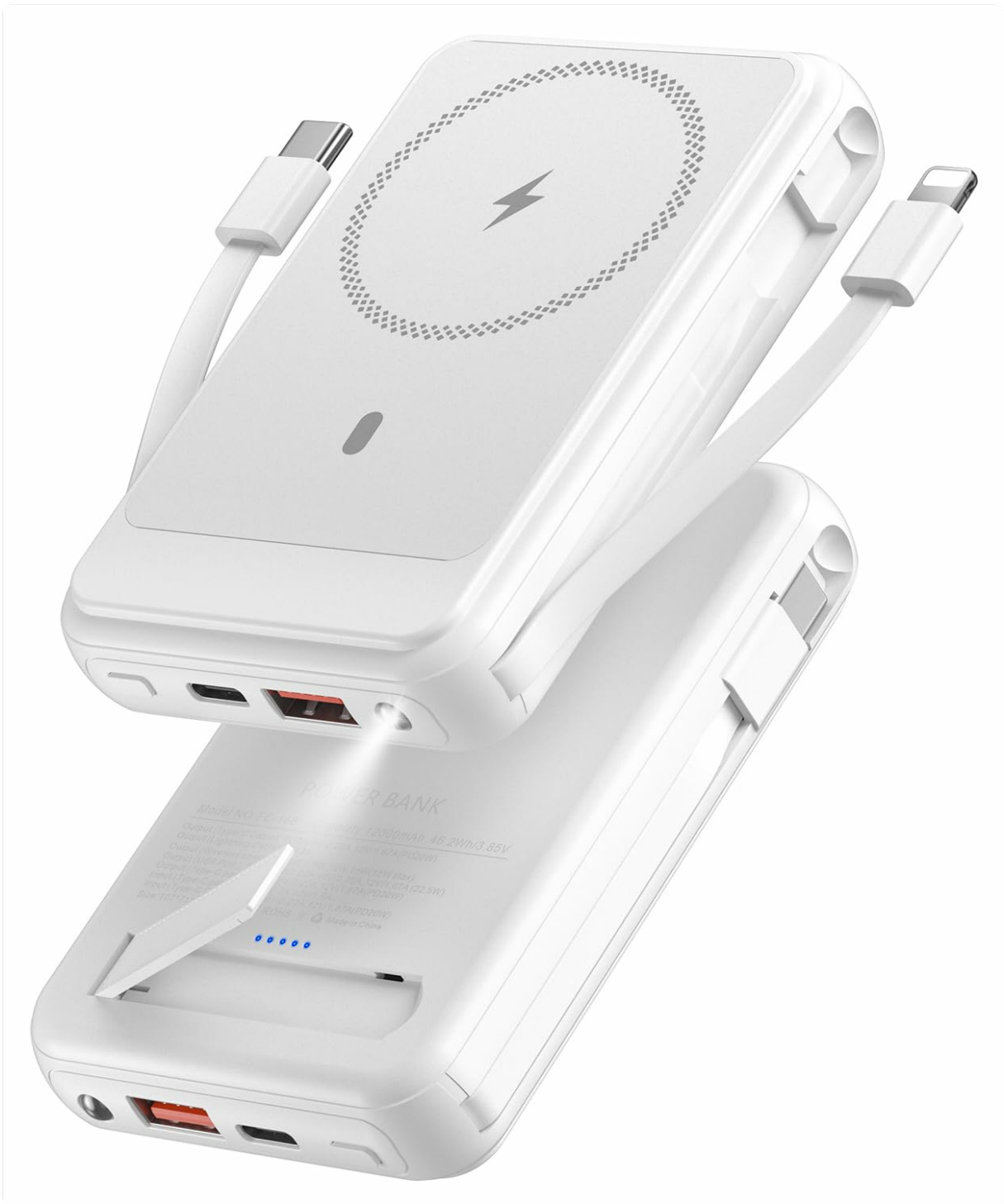
Image: The superallure FC-168 Magnetic Wireless Power Bank in white, showcasing its compact design and magnetic charging interface.