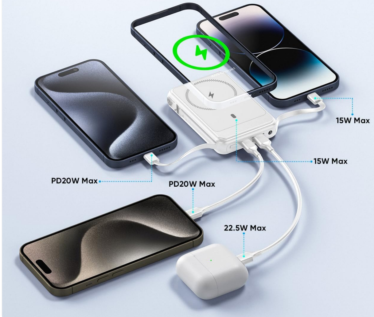
Image: The power bank connected to multiple devices (iPhones, AirPods) via wireless charging, built-in cables, and external USB ports, demonstrating its 12000mAh capacity and ability to power 5 devices at once.