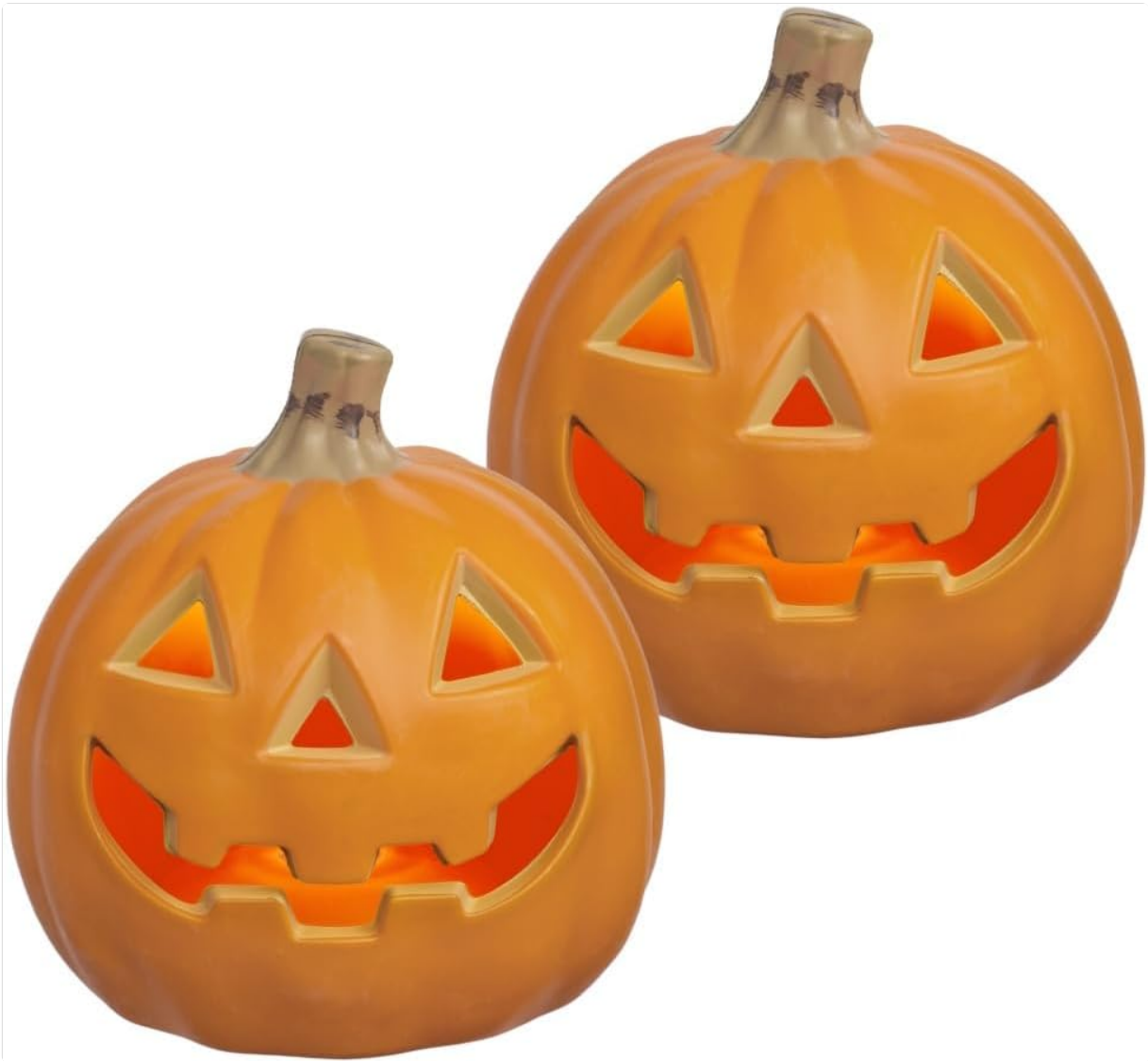
Image: Two Xodus Innovations Small LED Lighted Pumpkins, illuminated with a warm orange glow, showcasing their design and lighting effect.