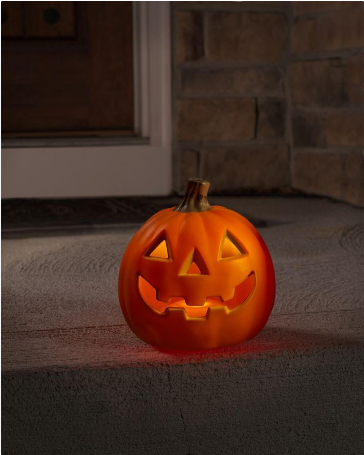
Image: A single Xodus Innovations Small LED Lighted Pumpkin illuminated on an outdoor step, demonstrating its suitability for evening display.