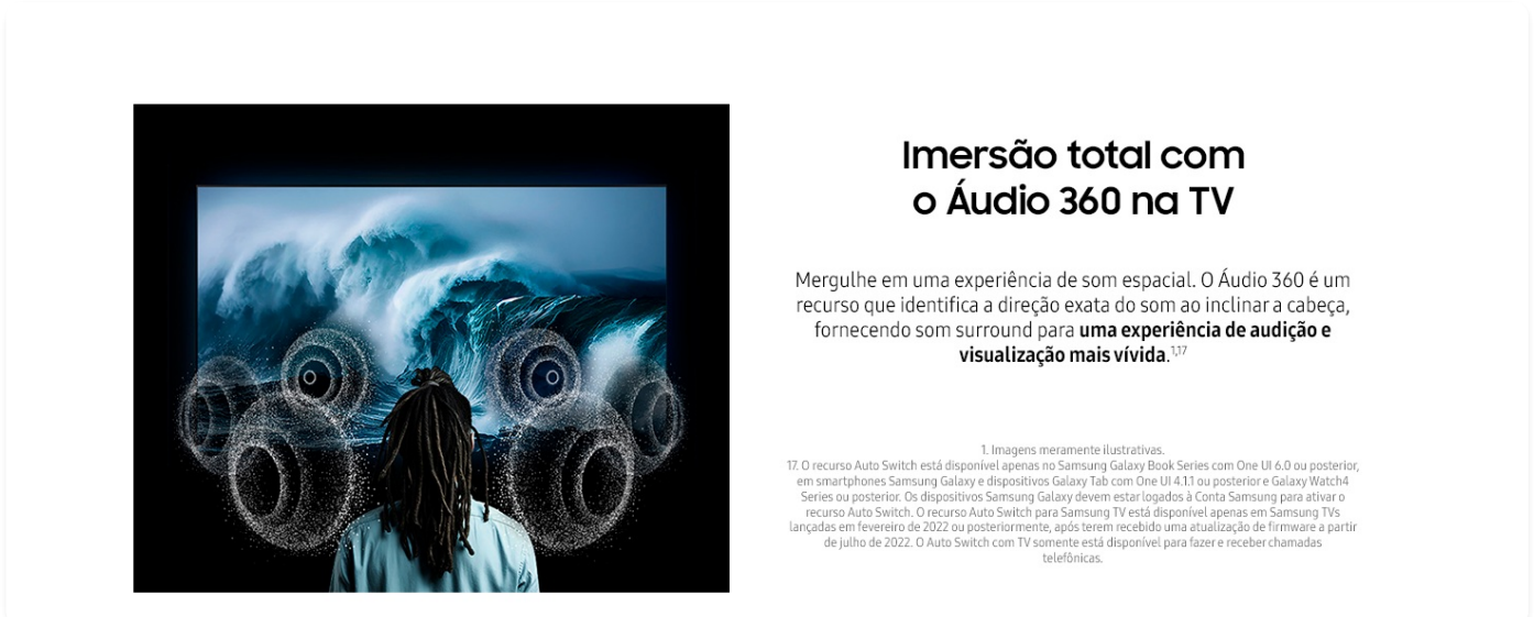
Image: A person wearing Galaxy Buds3 Pro, immersed in a visual and auditory experience from a TV screen, illustrating 360 Audio.

Experience immersive spatial sound with 360 Audio. This feature identifies the exact direction of sound as you move your head, providing a more vivid audio and visual experience, especially when watching content on compatible Samsung Galaxy devices and TVs.