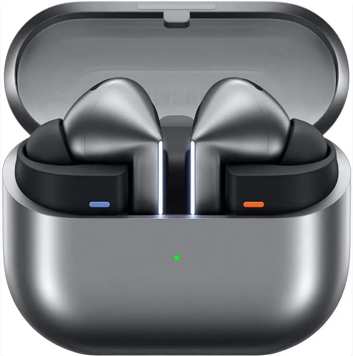
Image: Galaxy Buds3 Pro earbuds inside their open charging case, showing the charging indicator light.

Before first use, ensure your Galaxy Buds3 Pro and their charging case are fully charged. Place the earbuds into the charging case. Connect the USB Type-C cable to the charging case and a power source. The indicator light on the case will show charging status.