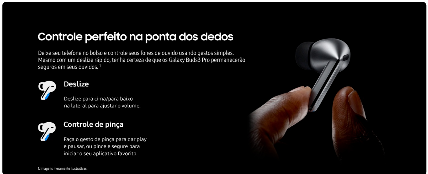
Image: Visual guide to touch and pinch controls on the Galaxy Buds3 Pro, including swipe for volume and pinch for play/pause or app launch.