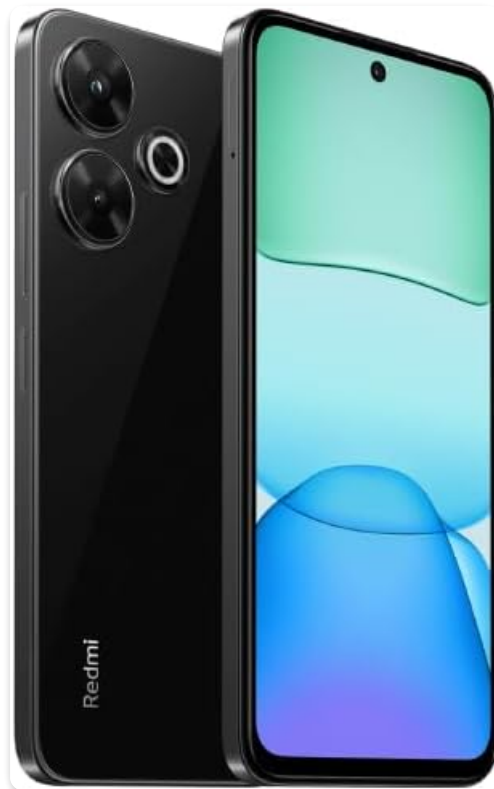
Figure 1: Front and back view of the Xiaomi Redmi 13 smartphone, showcasing its sleek design and camera module.

The Xiaomi Redmi 13 (model 24049RN28L) is a powerful and versatile smartphone designed for global use. It features a large 6.79-inch IPS LCD display, a high-resolution 108 MP main camera, and a long-lasting 5030 mAh battery with 33W fast charging. This device supports dual SIM functionality and is factory unlocked for GSM networks, making it compatible with various carriers worldwide.