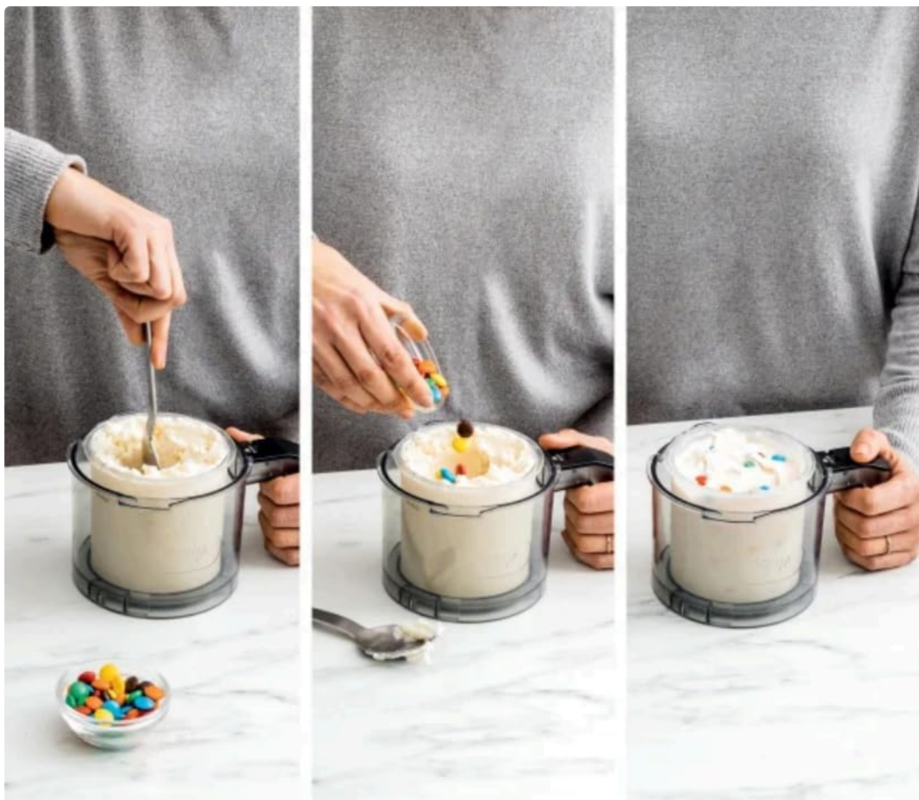
Image: A visual guide demonstrating the process of preparing ingredients and adding mix-ins to the Creami pint before processing.

Place the motor base on a clean, dry, level surface. Insert the Creami Pint filled with your frozen base into the outer bowl. Attach the outer bowl lid with the Creamerizer Paddle securely to the outer bowl. Align the outer bowl assembly with the motor base and rotate the handle clockwise until it clicks into place.