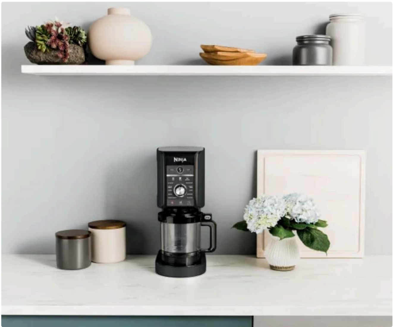
Image: The Ninja Creami Deluxe appliance positioned on a kitchen counter, ready for use.