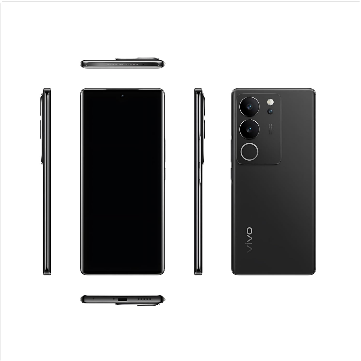
Figure 4.3: Multiple Views of VIVO V29 Pro 5G. Displays the top, bottom, front, back, and side profiles, indicating locations of ports, speakers, and SIM tray.