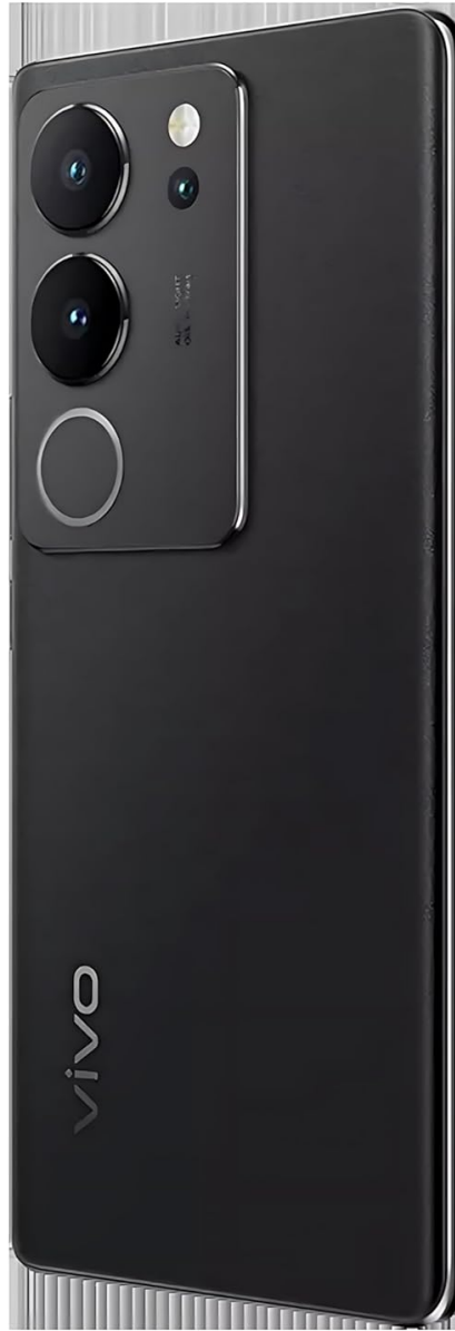
Figure 4.2: Side View of VIVO V29 Pro 5G. Highlights the slim profile and button placement.