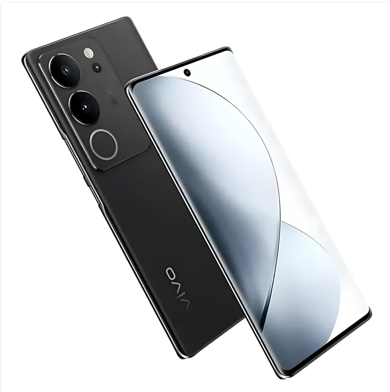
Figure 12.1: VIVO V29 Pro 5G Key Specifications. Summarizes display, OS, camera, memory, connectivity, and battery

Key technical specifications for the VIVO V29 Pro 5G smartphone: