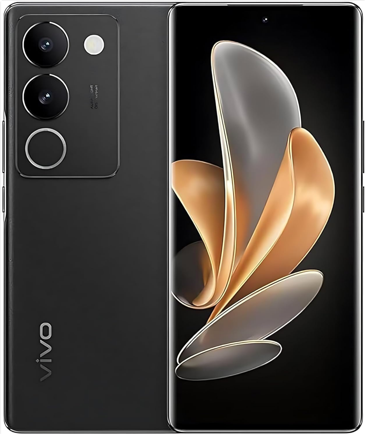
Figure 4.1: Front and Rear View of VIVO V29 Pro 5G. Shows the curved display, front camera, and the triple rear camera module with Aura Light.

Familiarize yourself with the physical components of your VIVO V29 Pro 5G smartphone.