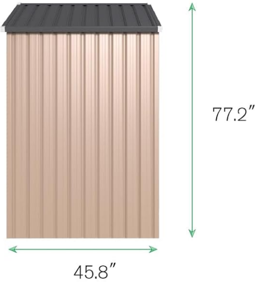
Image: Detailed dimensions of the U-MAX 6x4 Storage Shed, including height, width, and depth measurements.