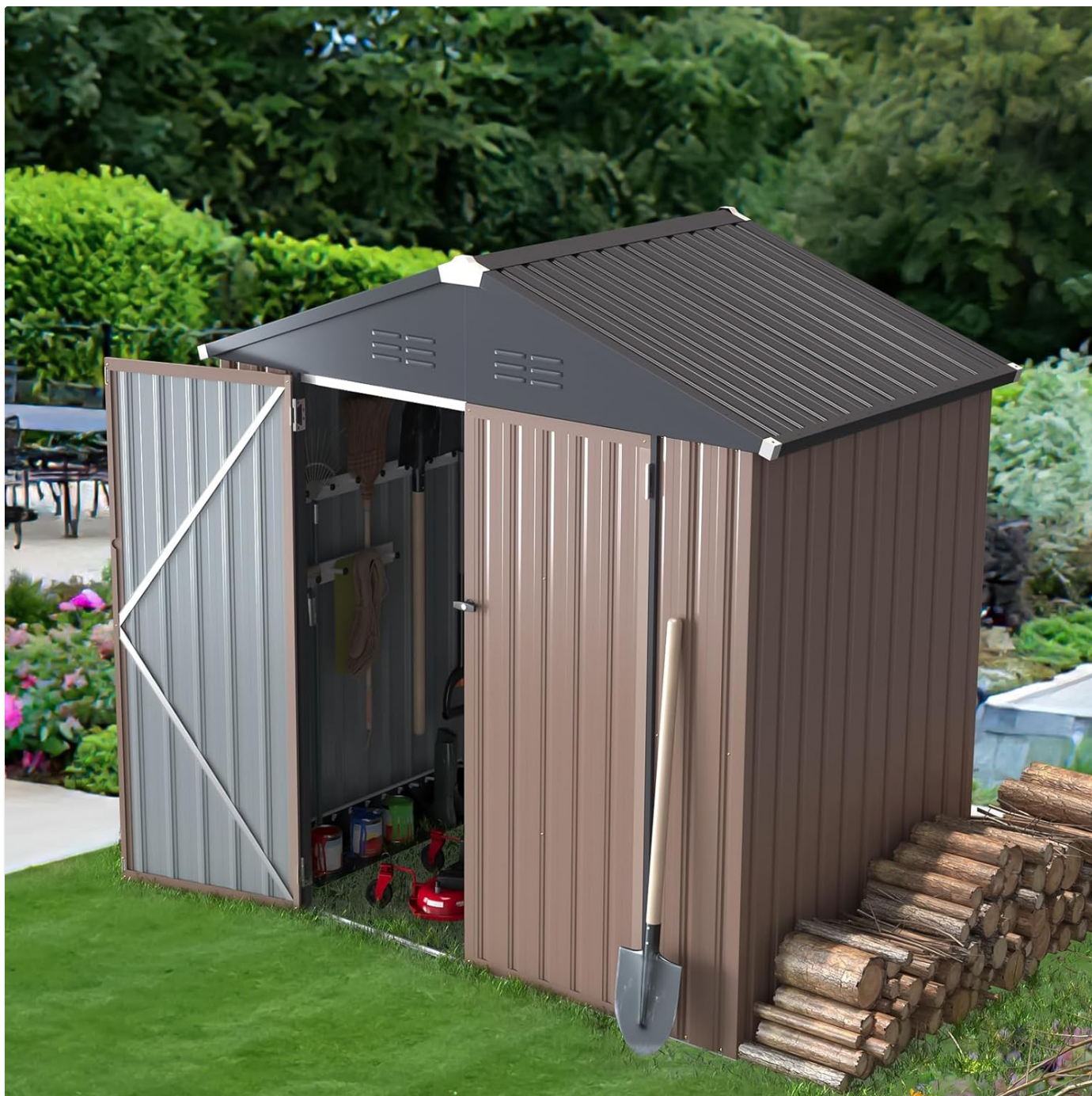
Image: The shed with one door open, illustrating the interior capacity and potential for organizing garden tools and equipment.