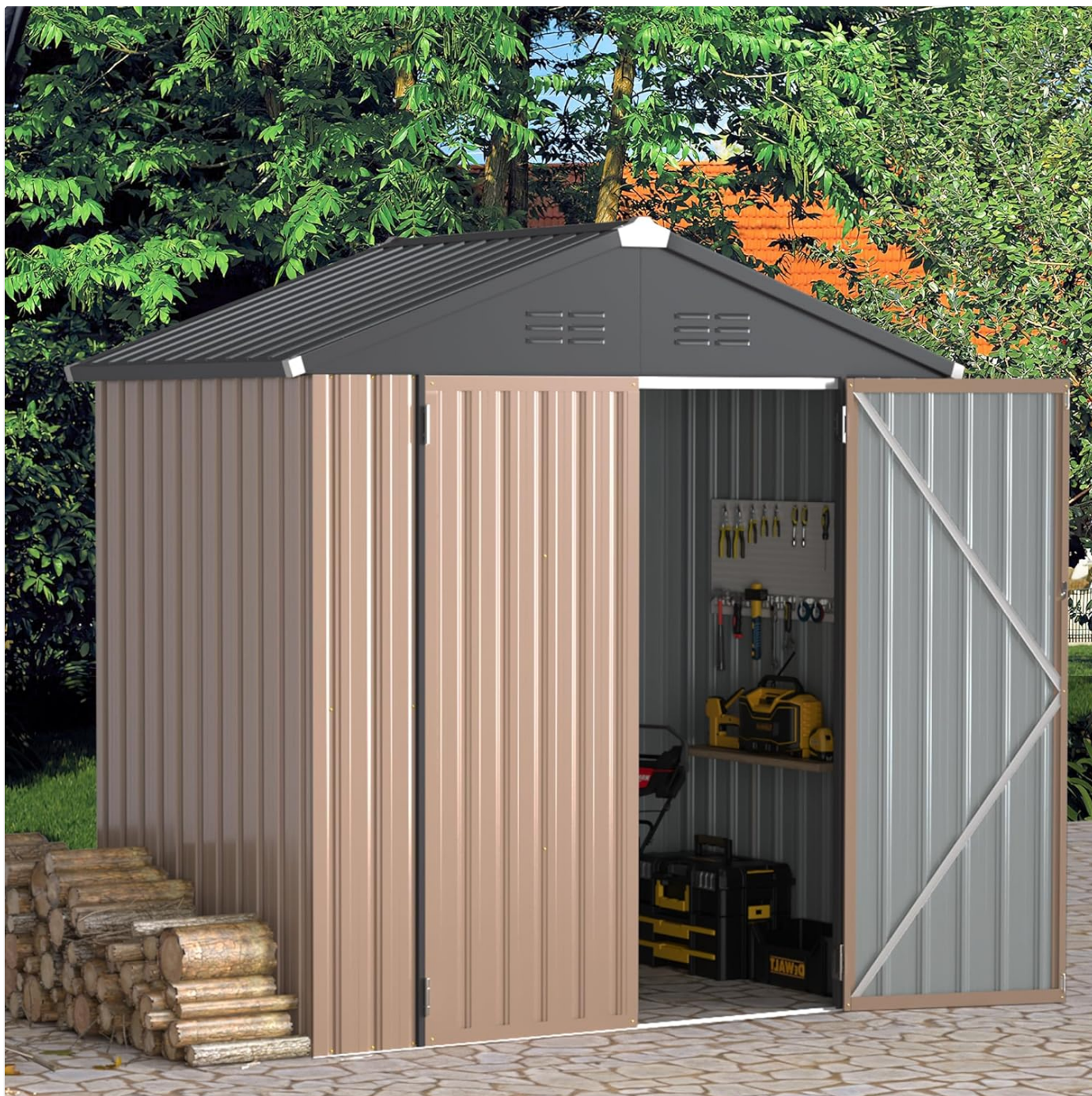
Image: The U-MAX 6x4 Storage Shed, showcasing its compact yet spacious design, ideal for various outdoor storage needs.