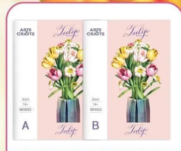
INSTRUCTION x 2