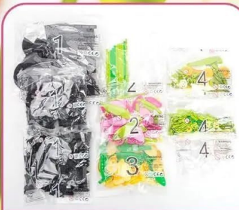
BUILDING BLOCKS PACKAGING BAGS*9