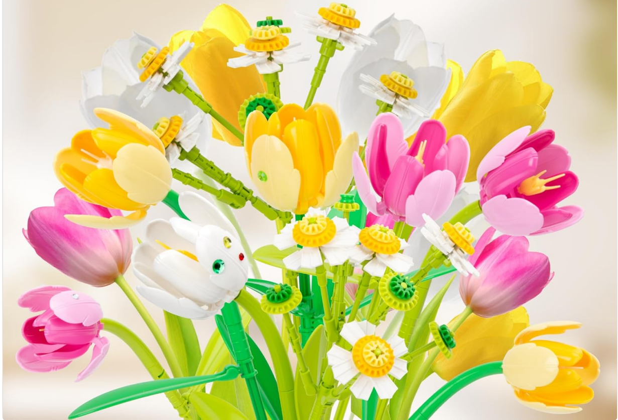
Image 5.1: An example of the exquisite tulip and daisy bouquet after assembly.