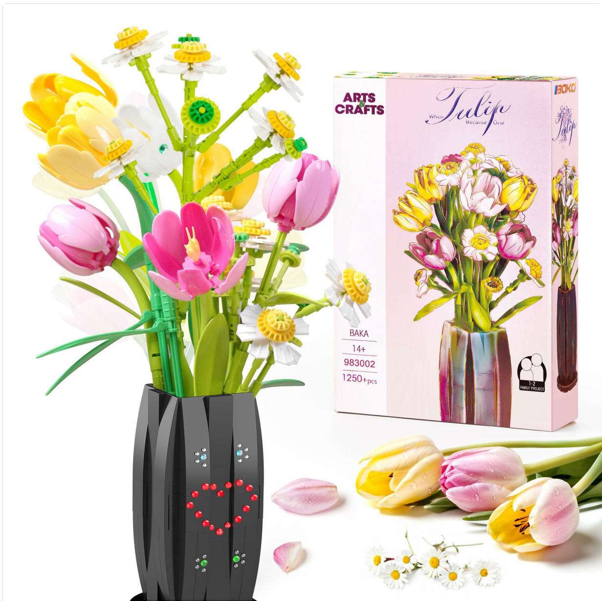
Image 4.1: Components ready for assembly, emphasizing the creative building process.

Take your time during assembly to ensure all connections are secure. The process is part of the creative experience.