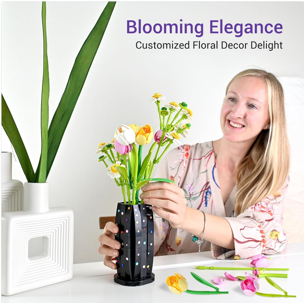
Image 5.2: Arranging the flowers in the vase for a customized floral decor.