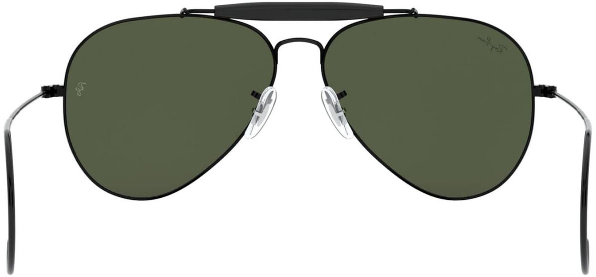
Close-up front view, highlighting the adjustable nose pads and the bridge design for a comfortable and customizable fit.