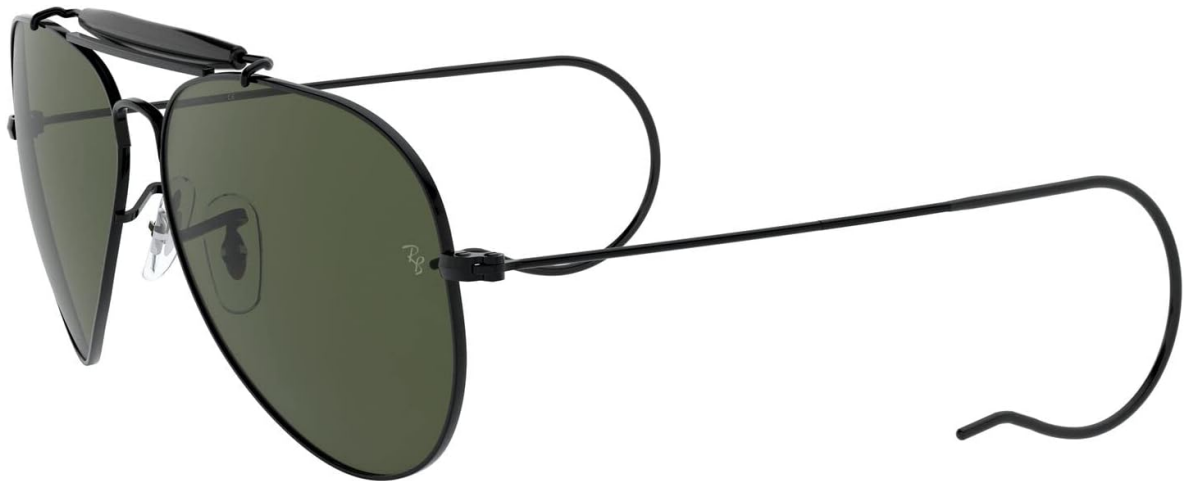
Angled view of the sunglasses, illustrating the unique ear hook design for a secure fit, along with the black frame and green lenses.