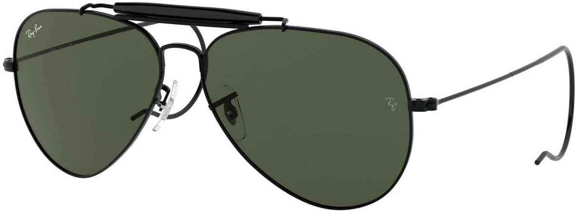
Front view of the Ray-Ban RB3030 Outdoorsman I Aviator Sunglasses, showcasing the black metal frame and classic G-15 green lenses.