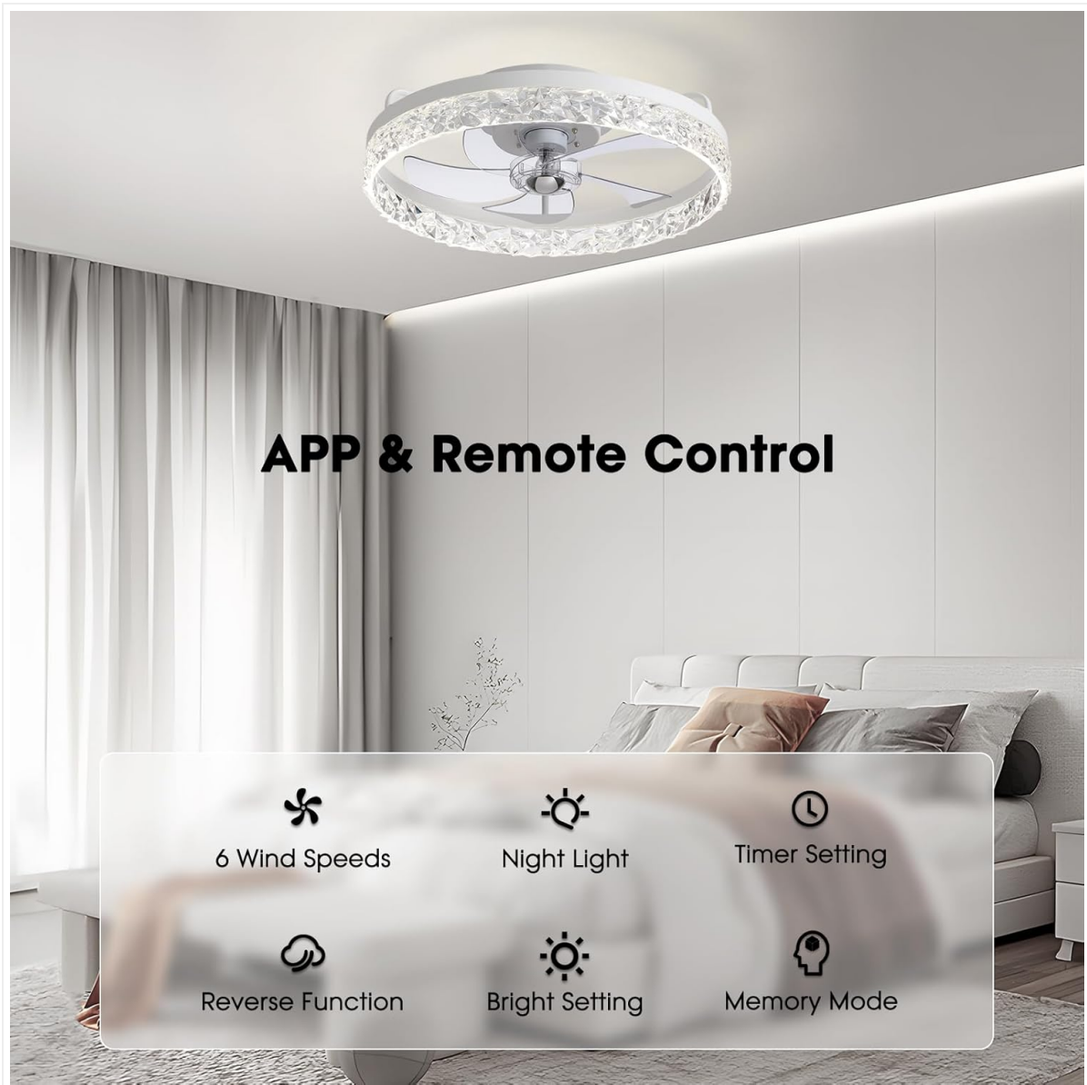
Figure 4.2: Stepless dimming and memory function. The light can be adjusted from 5% to 100% brightness (2568 lumens), and the fan retains the last used settings.