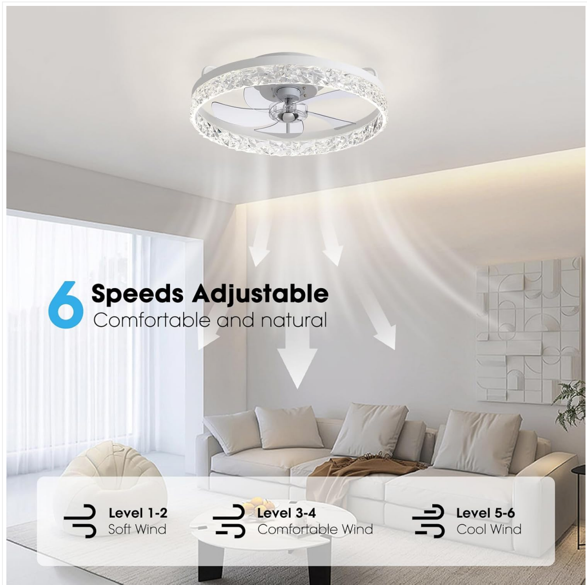
Figure 4.3: 6 Speeds Adjustable. This image illustrates the different airflow levels from soft to cool wind, corresponding to the 6-speed settings.