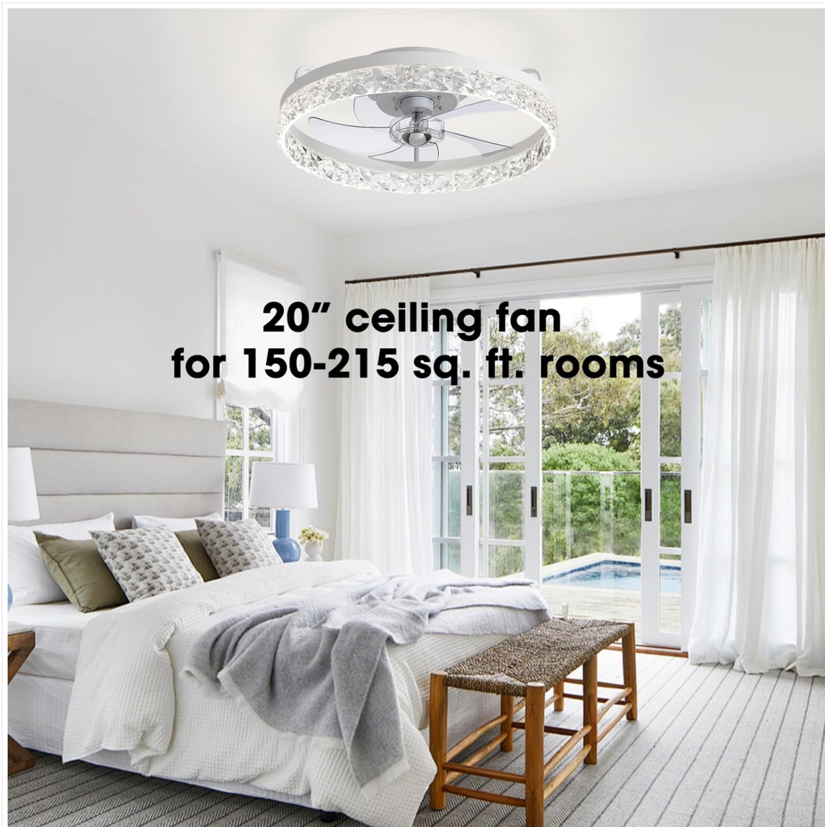
Figure 3.1: Product dimensions and recommended room size. The fan measures 20 inches in diameter, 7.9 inches in height, and 2.8 inches in thickness. It is suitable for rooms between 7-10 feet high and approximately 8.5 x 8.5 feet in area.