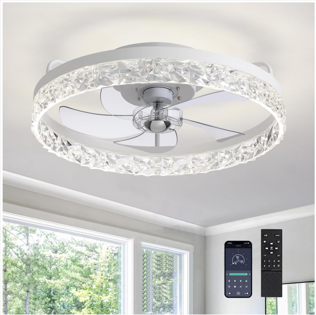
Figure 2.1: LUDOMIDE 20-inch Ceiling Fan with Lights and Remote, Model CFL-1102-02. This image displays the complete ceiling fan unit, including the integrated light and remote control.