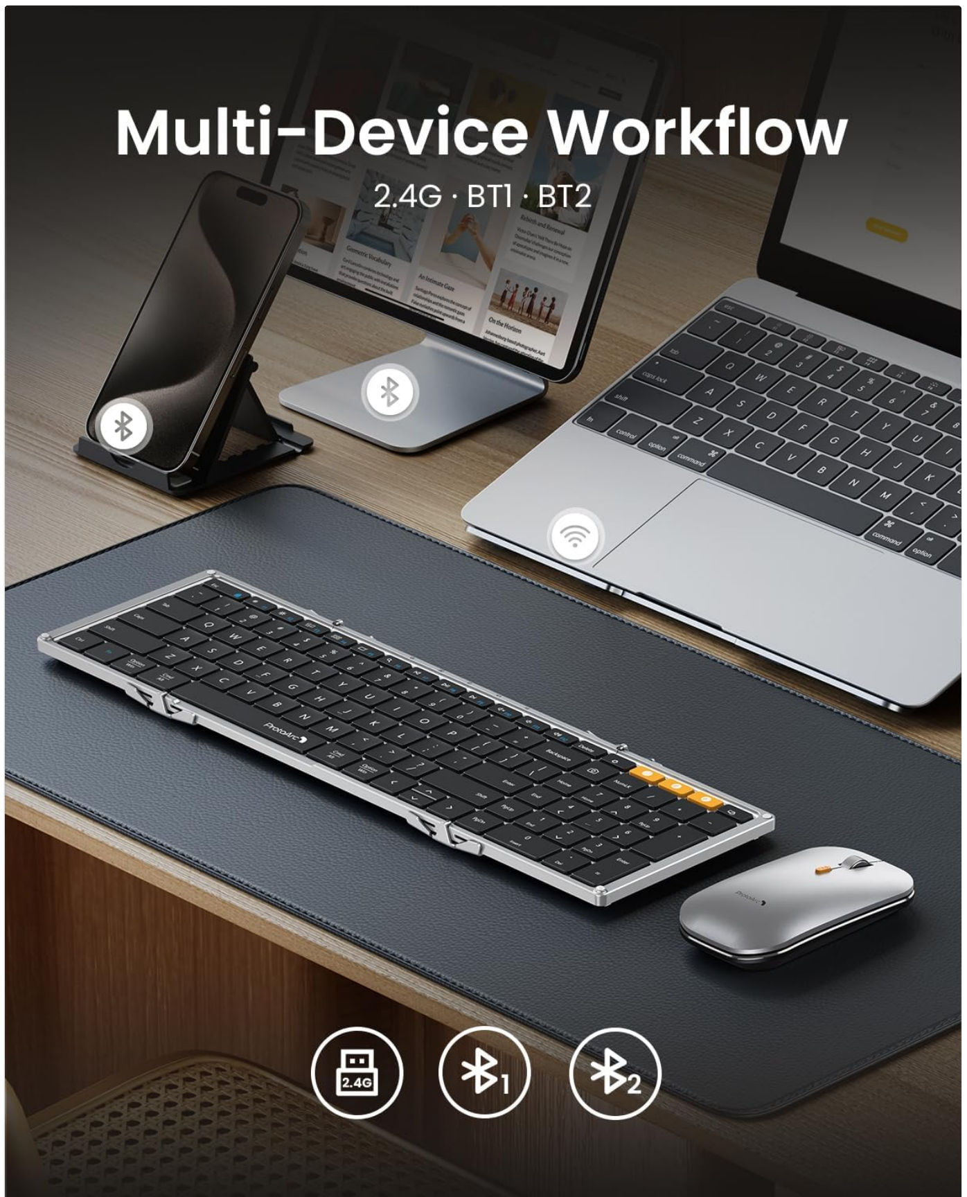
Image: The ProtoArc keyboard and mouse set up with a laptop and a tablet, demonstrating its multi-device connectivity via 2.4G wireless and Bluetooth.