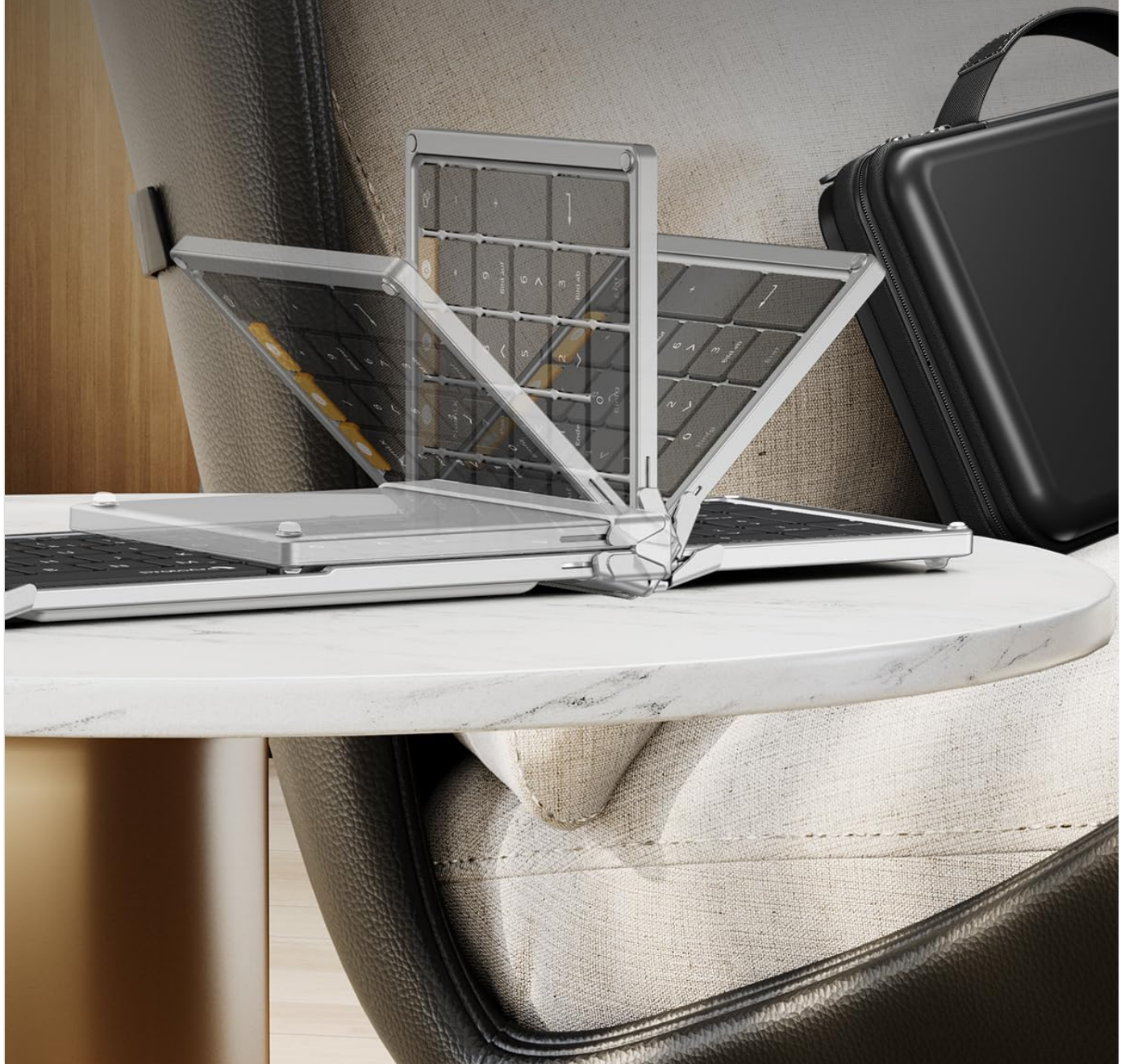
Image: The ProtoArc foldable keyboard in a partially unfolded state, highlighting its stable hinges and folding mechanism.