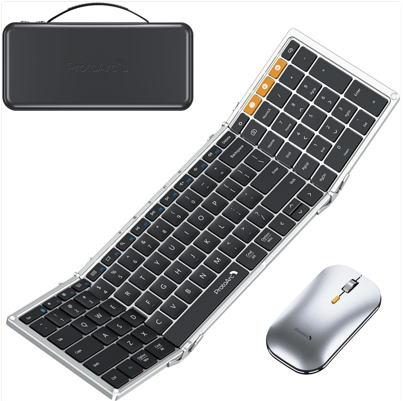
Image: The ProtoArc Foldable Keyboard and Mouse combo, including the keyboard, mouse, and carrying case.