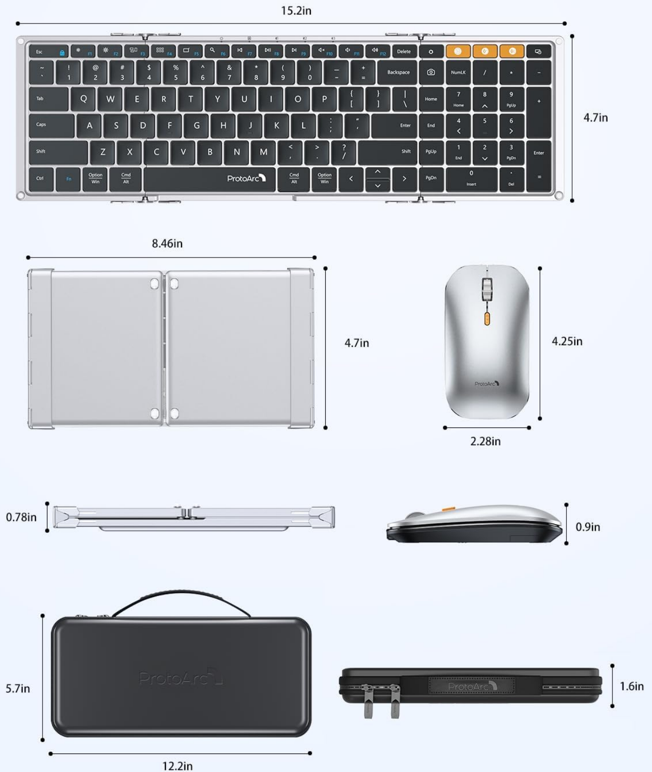
Image: Detailed dimensions of the ProtoArc XKM01 keyboard (unfolded and folded), mouse, and carrying case.